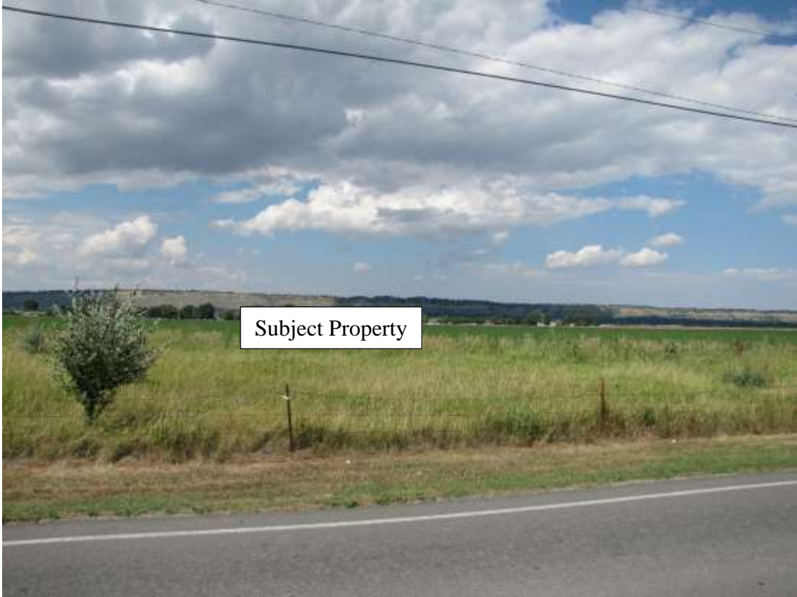
Subject property from Central Avenue