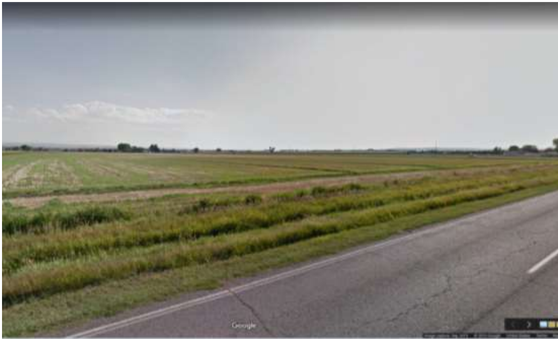
View south and west from subject property across Central Avenue