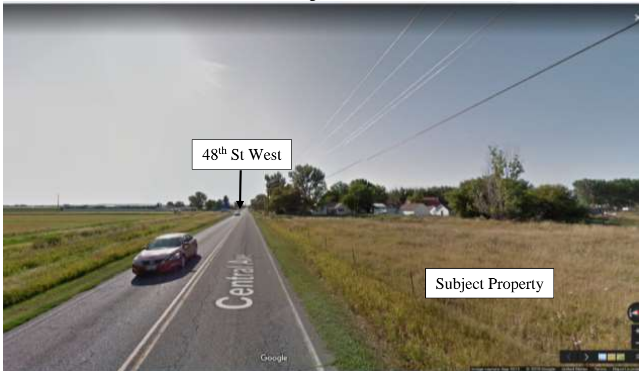
View west along Central Avenue