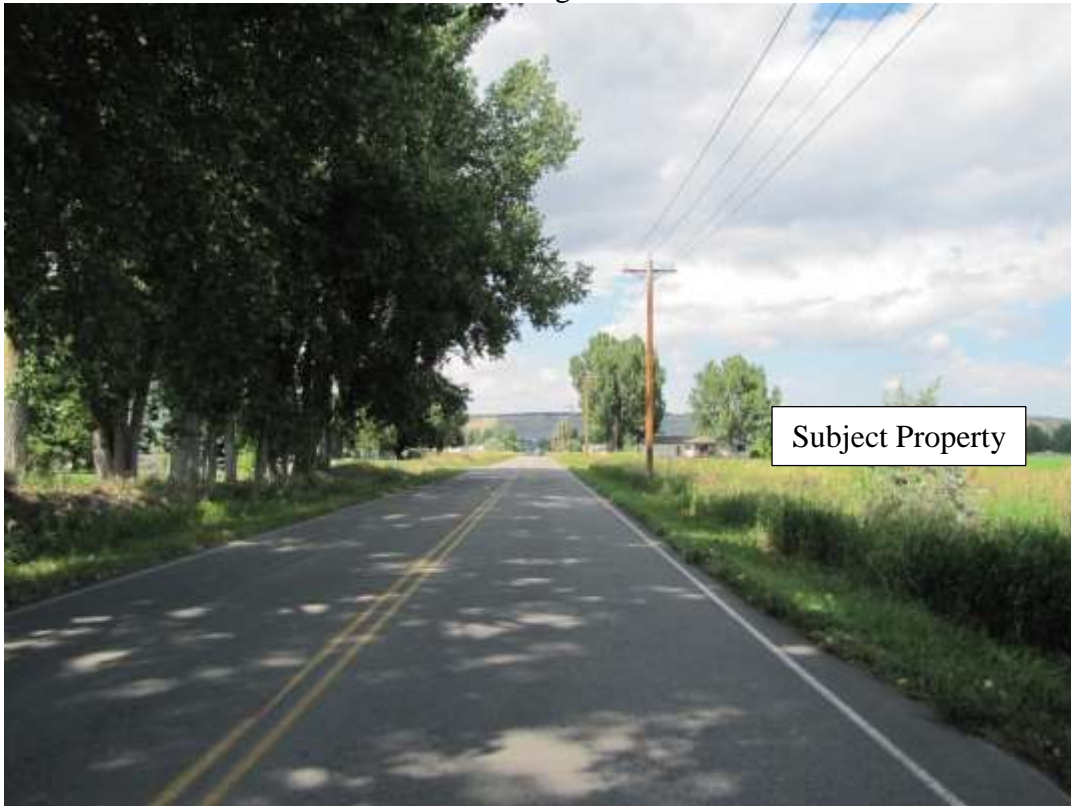
View south along 48 th St West