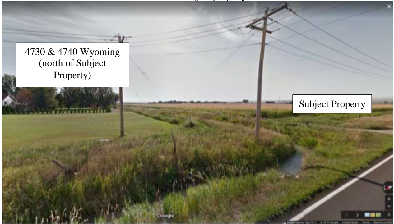
View south and east across subject property (NW corner) from 48 th St West