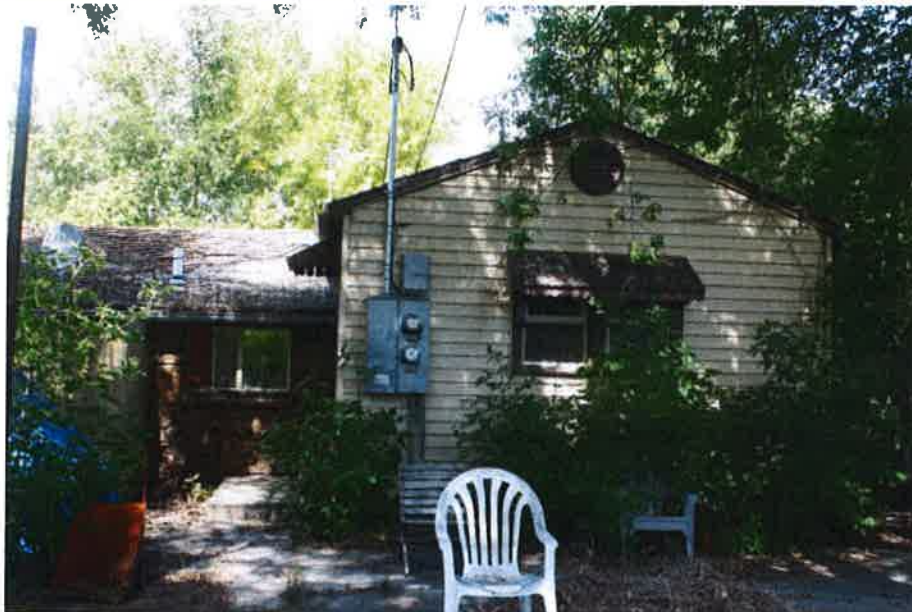
Subject: 1020 Terry Ave., Billings, MT 59102 Description: View of the back (south side) of the house