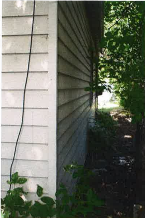
Subject: 1020 Terry Ave., Billings, MT 59102 Description: View of the east side of the house

PHOTOGRAPHS (35mm or good quality digitals of each exterior side of property, and photos of adjacent streetscape) Photocopy this page for additional photos