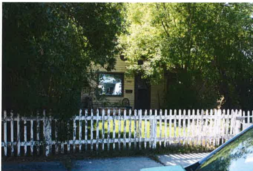
Subject: 1020 Terry Ave., Billings, MT 59102 Description: Front façade; photographer facing south

PHOTOGRAPHS (35mm or good quality digitals of each exterior side of property, and photos of adjacent streetscape) Photocopy this page for additional photos