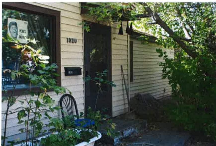
Subject: 1020 Terry Ave., Billings, MT 59102 Description: Alternative view of the front (north) side of the home