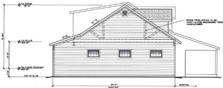
2 SIDE ELEVATION SCALE: 1/4"=1'-0"