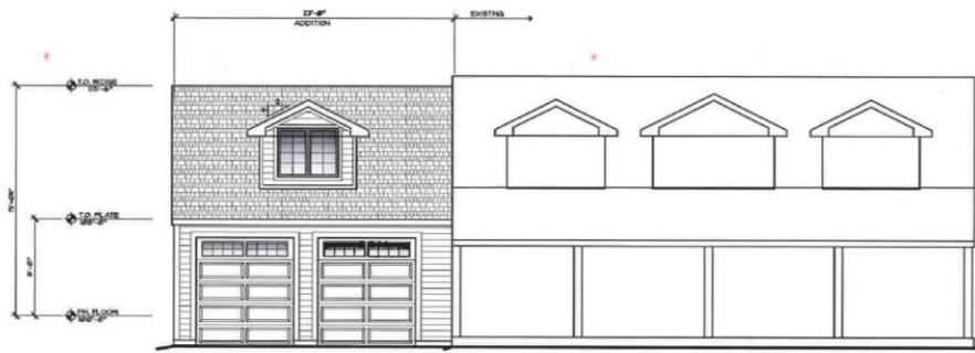
1 FRONT ELEVATION SCALE: 1/4"=1'-0"