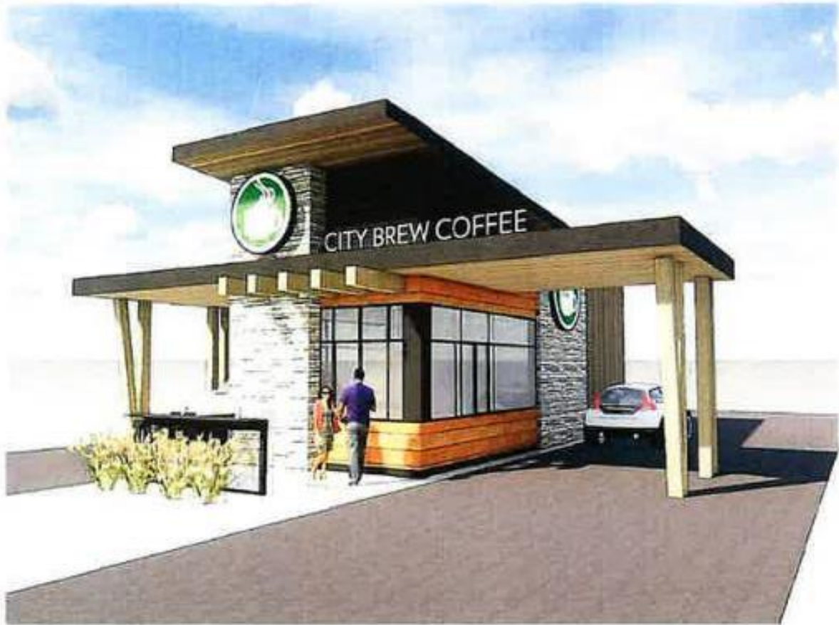
CITY BREW 5TH AND GRAND - PROPOSED CONCEPT DESIGN