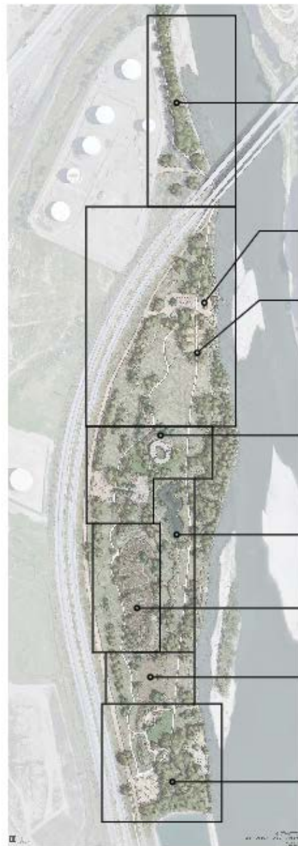
Coulson Park - Phasing Plan