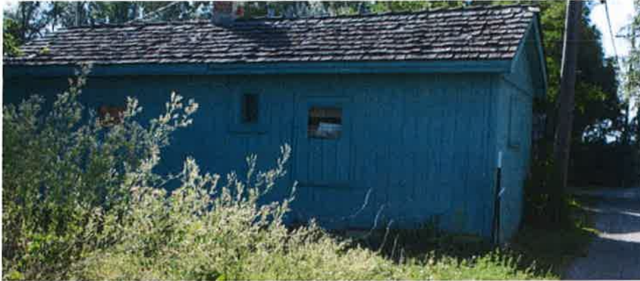
Subject: 910 South 27 th Street, Billings, MT 59101 Description: North and west sides of the detached shed along the alley

PHOTOGRAPHS (35mm or good quality digitals of each exterior side of property, and photos of adjacent streetscape) Photocopy this page for additional photos