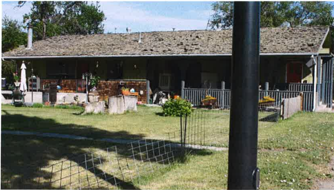
Subject: 910 South 27 th Street, Billings, MT 59101 Description: View of the south side of the house