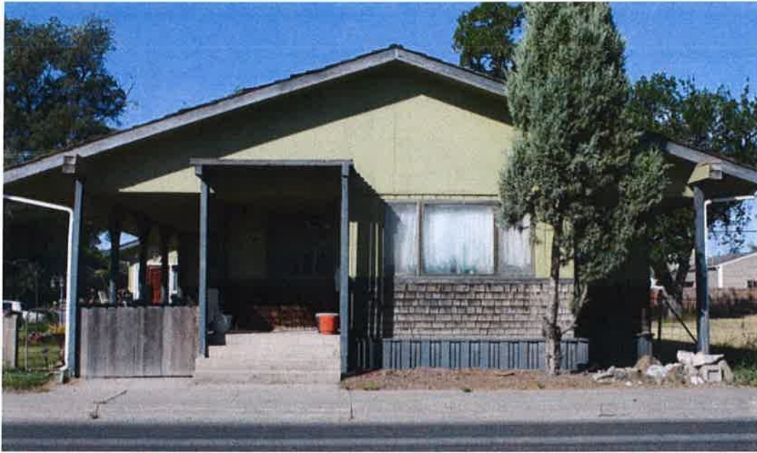
Subject: 910 South 27 th Street, Billings, MT 59101 Description: Front façade (photographer facing west)

PHOTOGRAPHS (35mm or good quality digitals of each exterior side of property, and photos of adjacent streetscape) Photocopy this page for additional photos