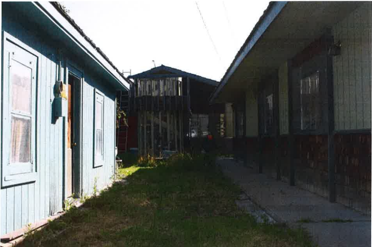
Subject: 910 South 27 th Street, Billings, MT 59101 Description: (L) view of the south side of the shed, (C) view of the rear of the house (east side), (R) view of the north side of the detached accessory building/garage