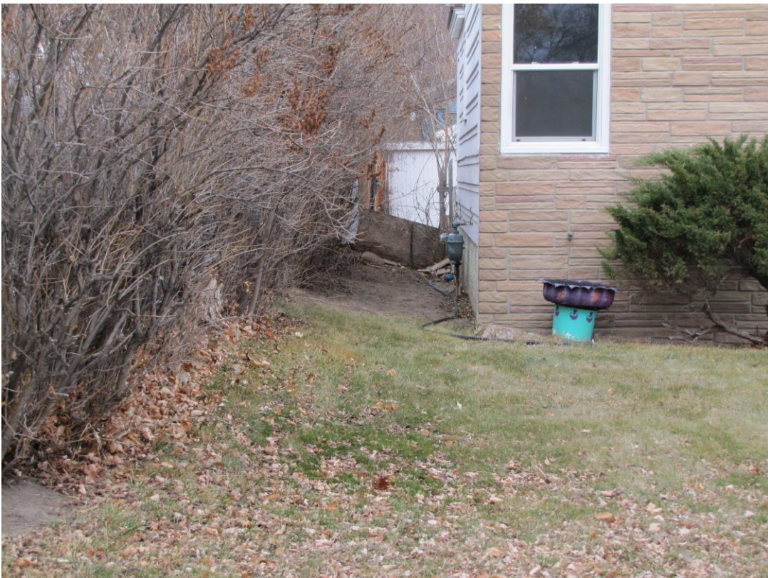
East to rear of property