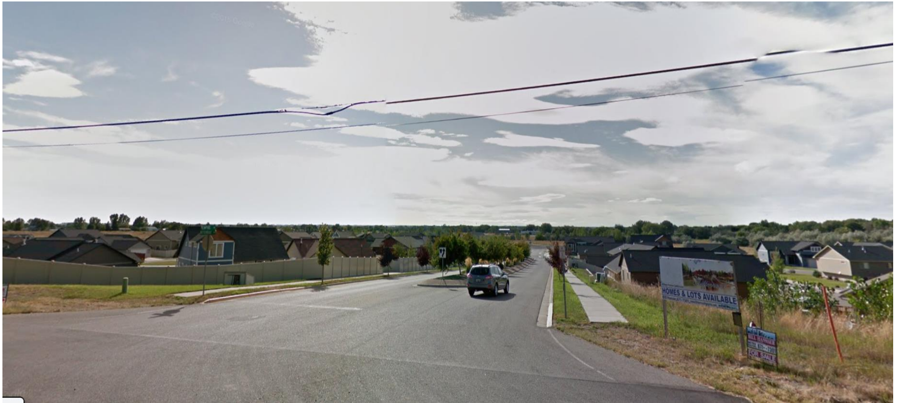
Entrance to Bitterroot Heights Subdivision from Bitterroot Drive (2015)