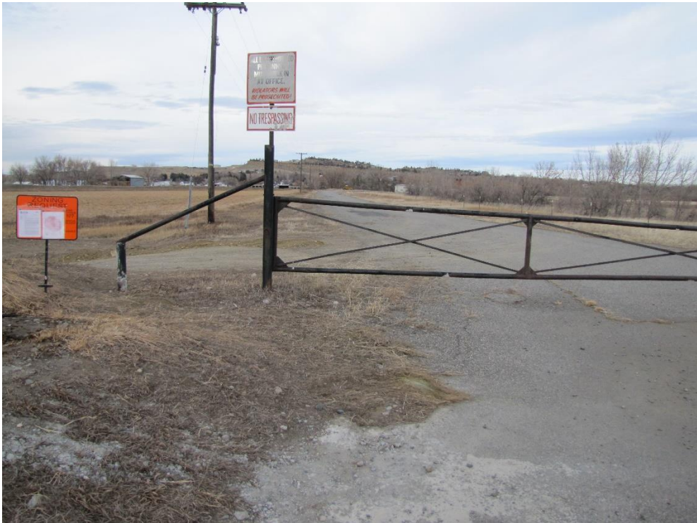
Subject property view north and east