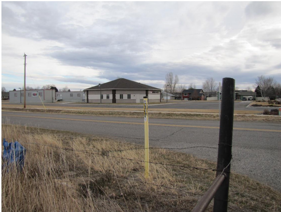
View south across Mary Street at intersection with Hawthorne Lane