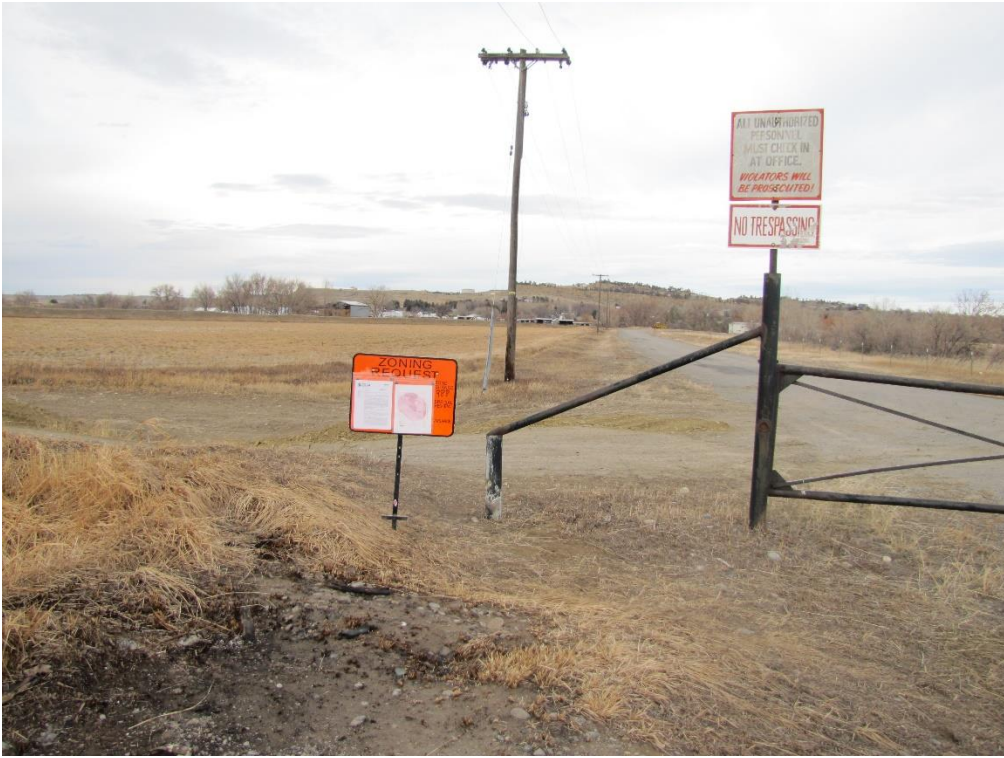
Subject Property from Hawthorne Lane gate