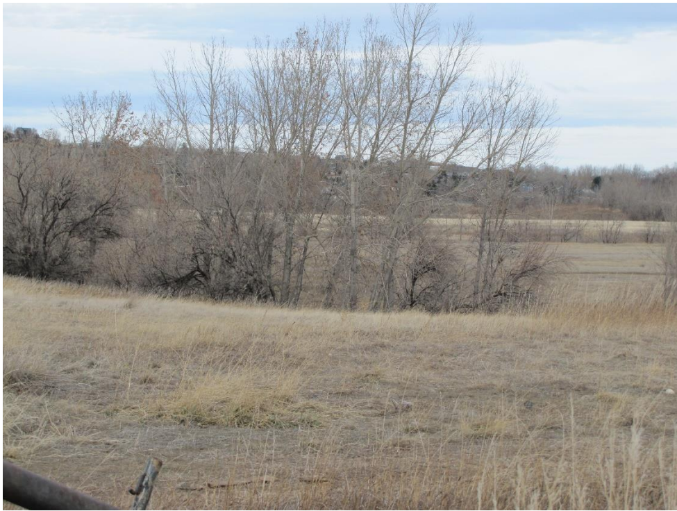
Subject property view north and east