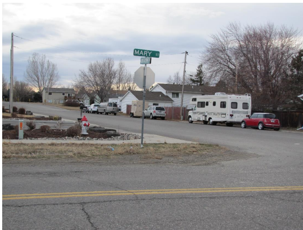
View south west at Mary St and Hawthorne Lane