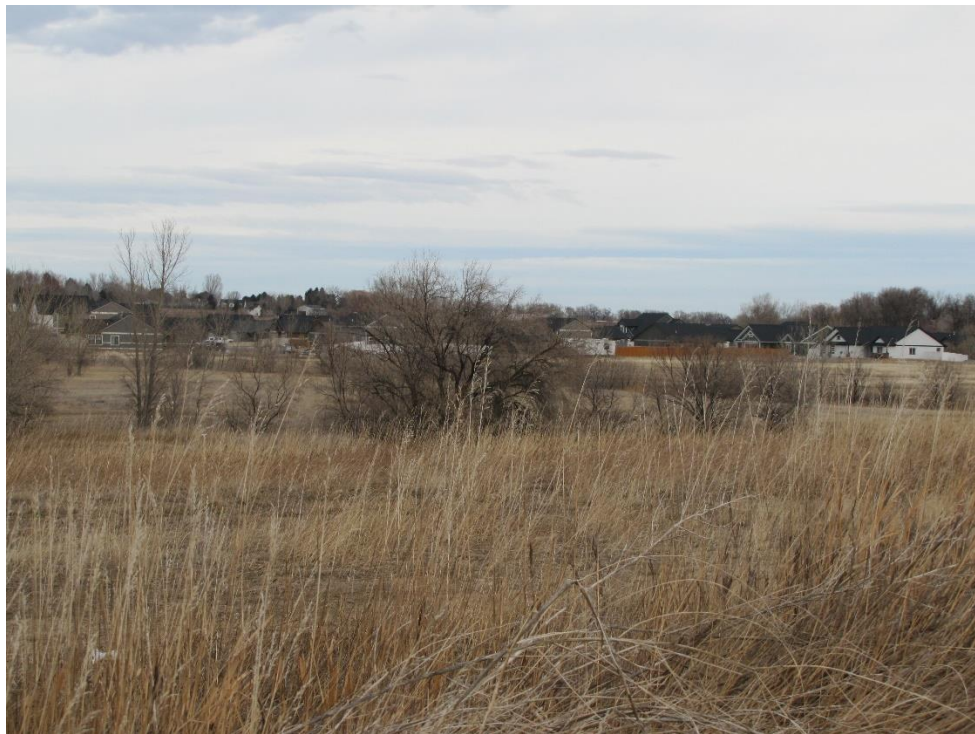
View of Bitterroot Heights Subdivision north and east