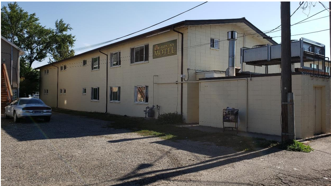
Subject of photo: 3311 2 nd Avenue N, Billings, MT 59101 Photo is taken looking: Southeast from alley