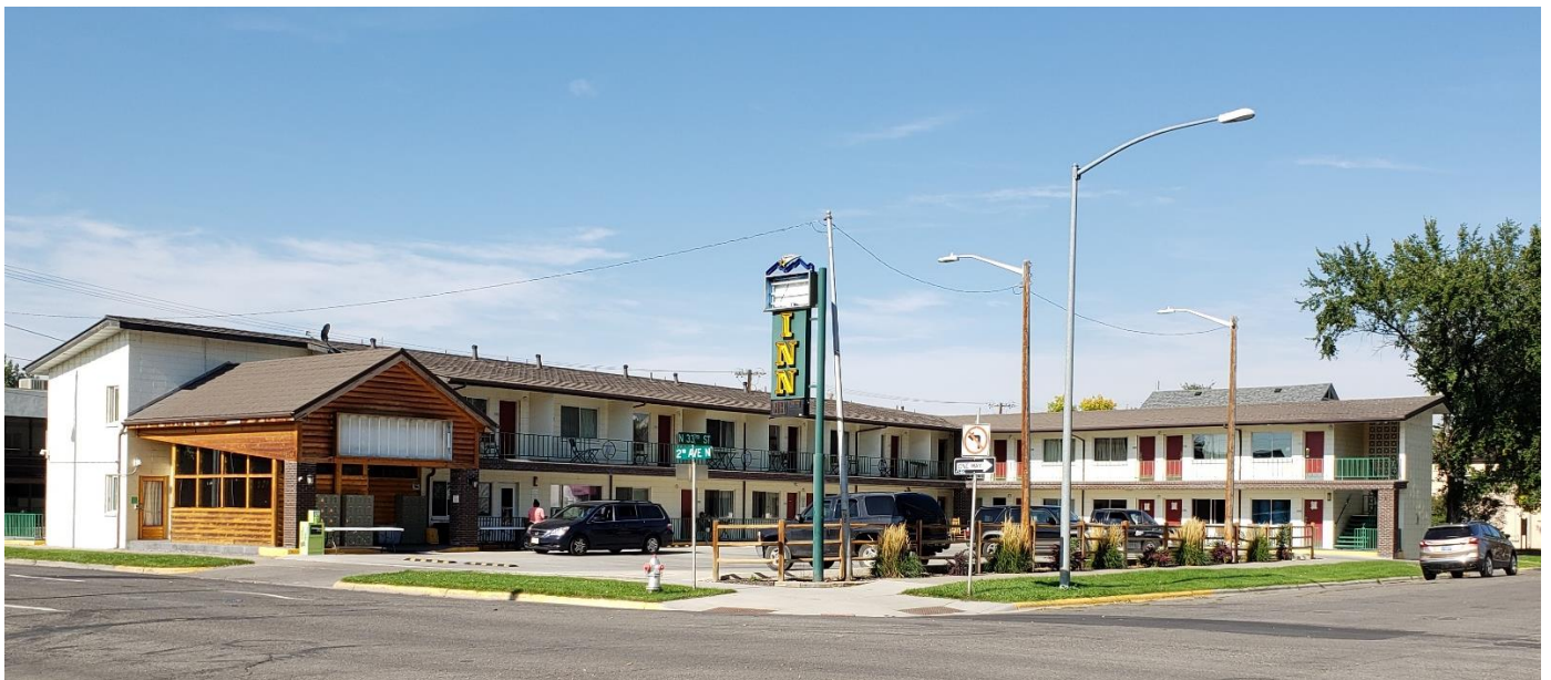
Subject of photo: 3311 2 nd Avenue N, Billings, MT 59101 Photo is taken looking: Northwest from the intersection of 2nd Avenue N & N 33 rd Street