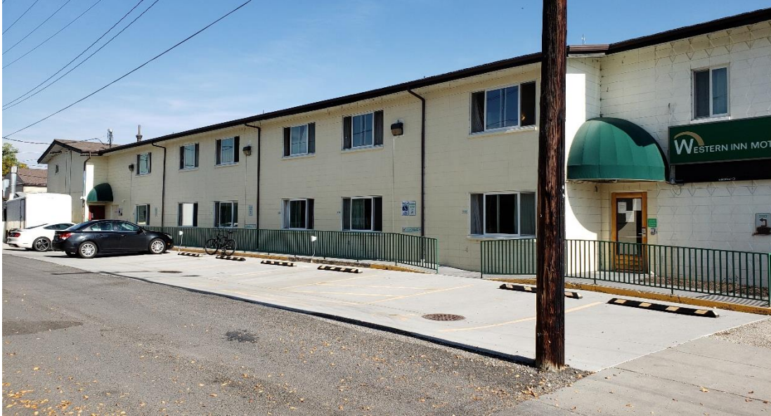
Subject of photo: 3311 2 nd Avenue N, Billings, MT 59101 Photo is taken looking: Northeast from alley at 2 nd Ave. N

Photocopy this page for additional photos