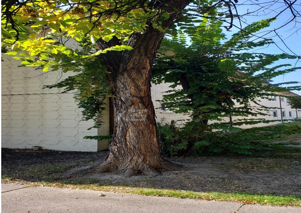
Subject of photo: 3311 2 nd Avenue N, Billings, MT 59101 Photo is taken looking: Southwest from 2nd Avenue N

Photocopy this page for additional photos