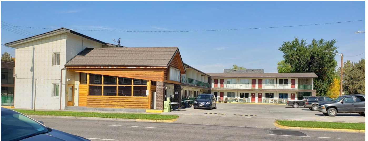
Subject of photo: 3311 2 nd Avenue N, Billings, MT 59101