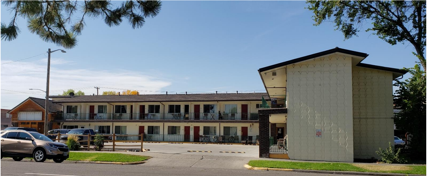
Subject of photo: 3311 2 nd Avenue N, Billings, MT 59101

Photocopy this page for additional photos