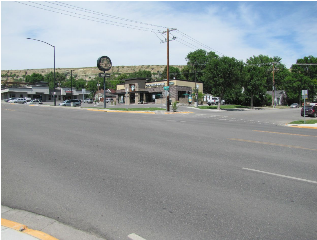
View north and east across N 27 th St