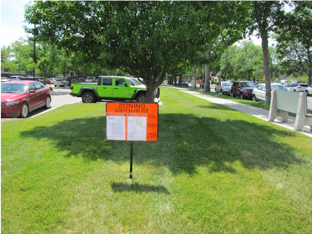
Subject Property – intersection of 12 th Ave N and N 27 th St