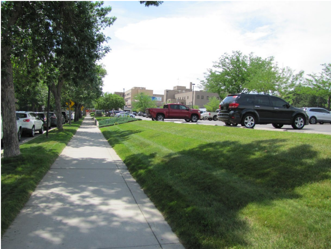
View west on 12 th Ave N from N 27 th St