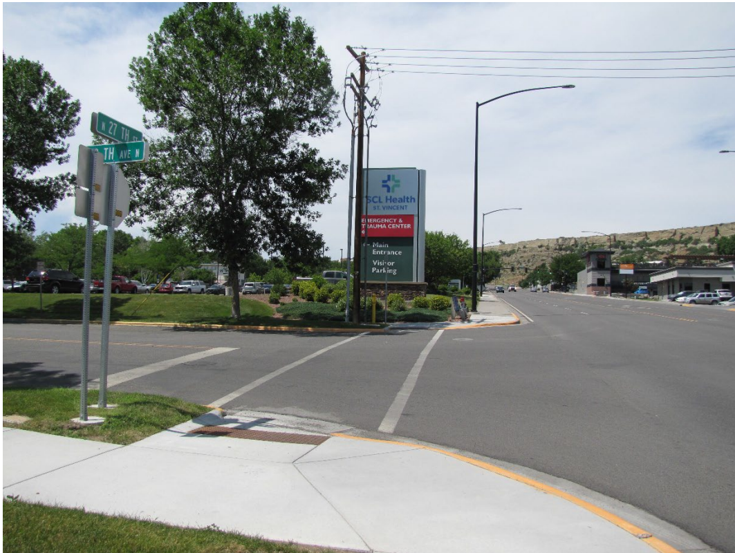
View north on N 27 th St at intersection of 12 th Ave N