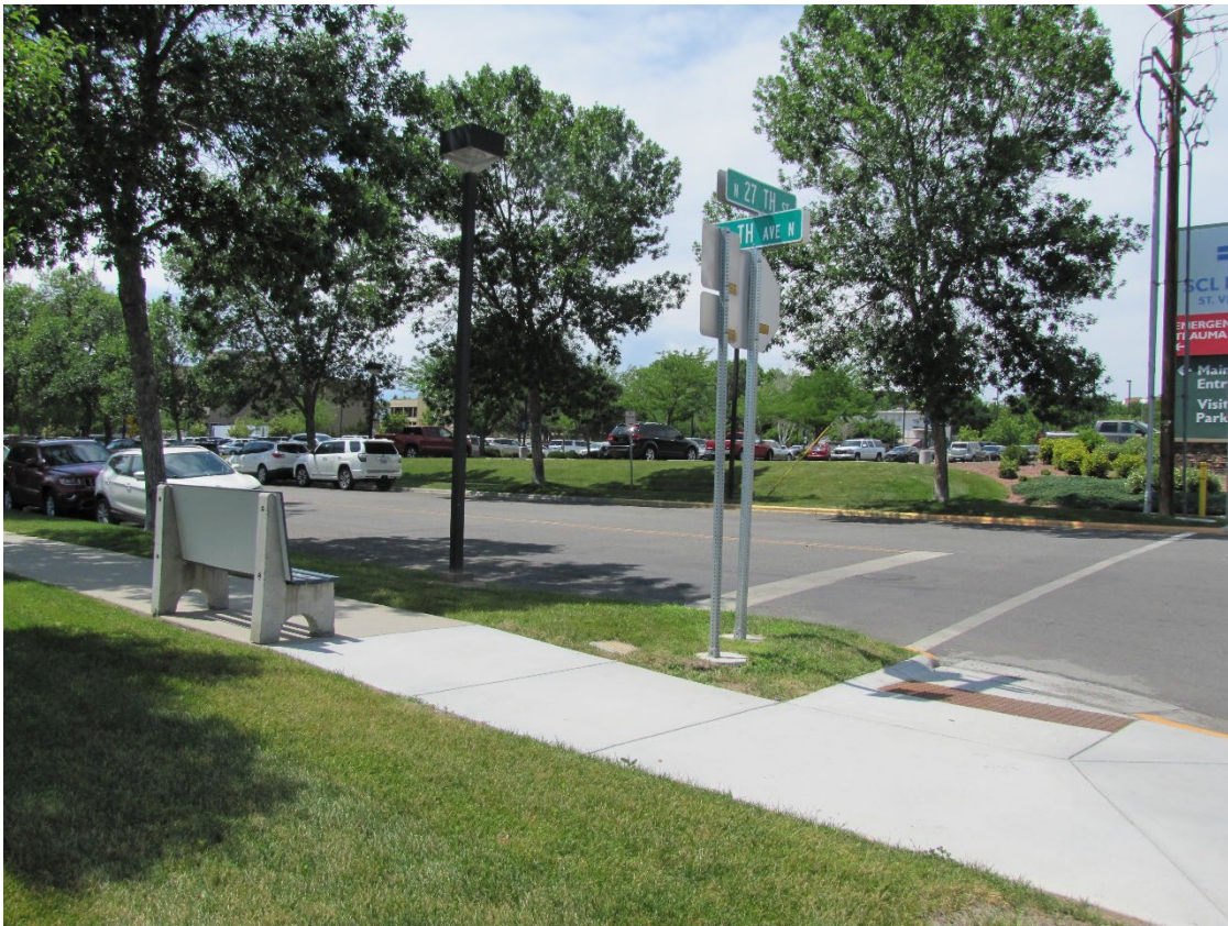
View north and west from intersection of 12 th Ave N and N 27 th St