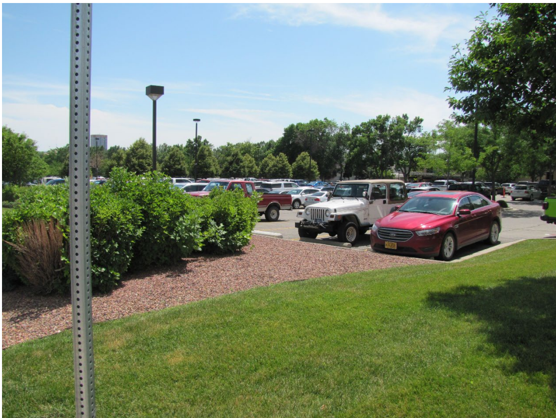
View south and west from intersection of 12 th Ave N and N 27 th St