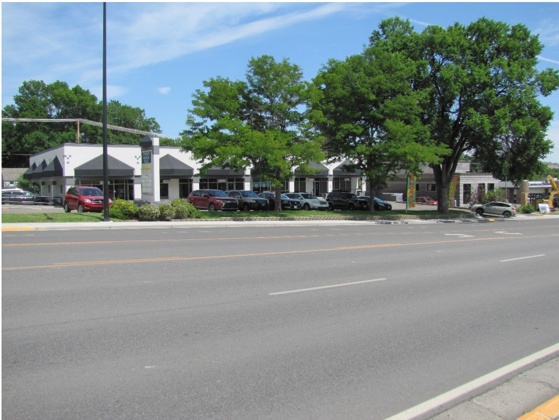
View south east across N 27 th St