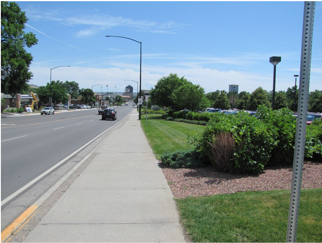
View south along N 27 th St from intersection with 12 th Ave N