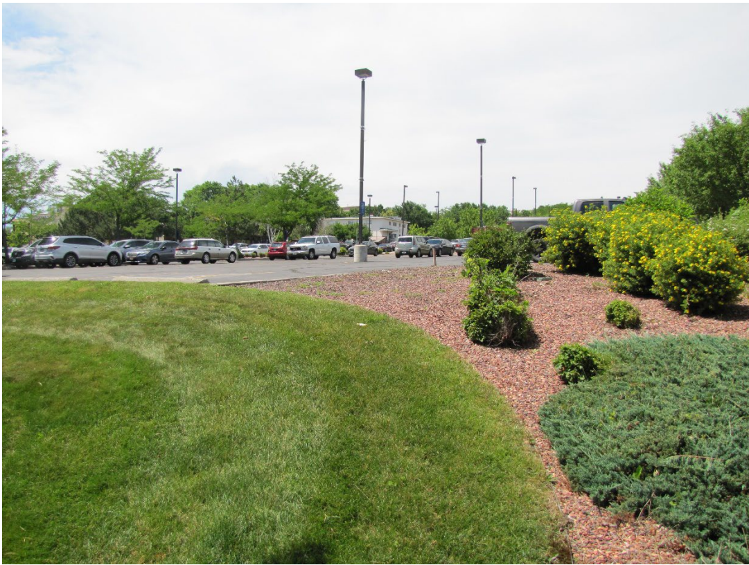
View north and west from 12 th Ave N