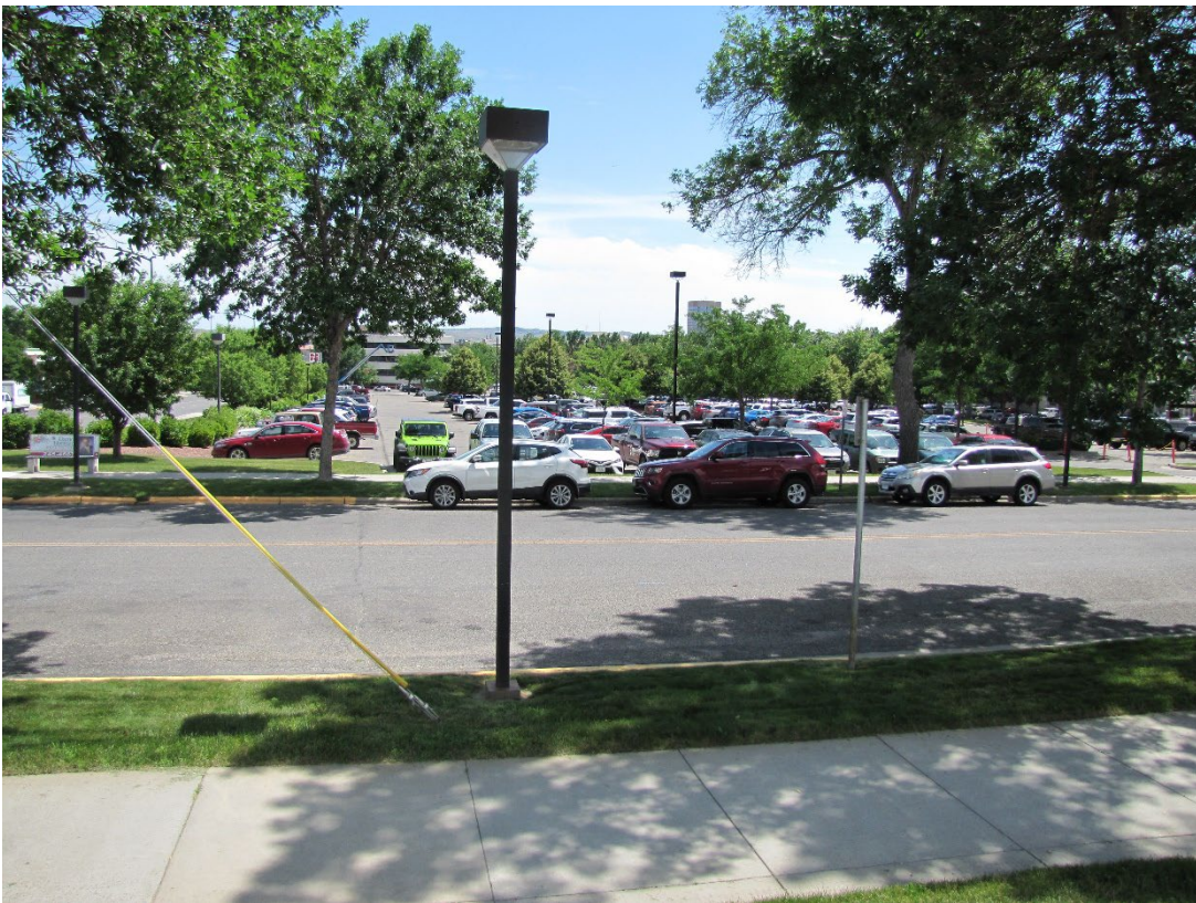
View south across 12 th Ave N