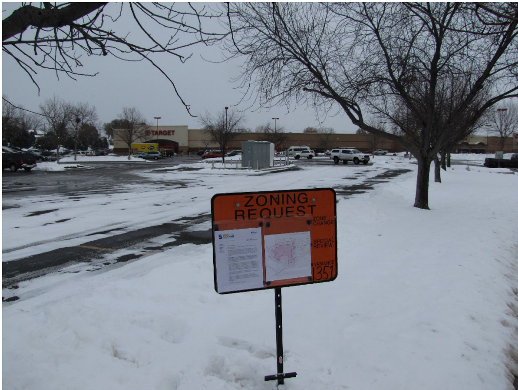
Subject property from primary entry driveway off Main Street