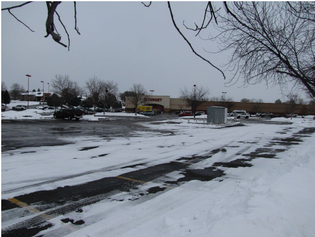
View north east across parking lot