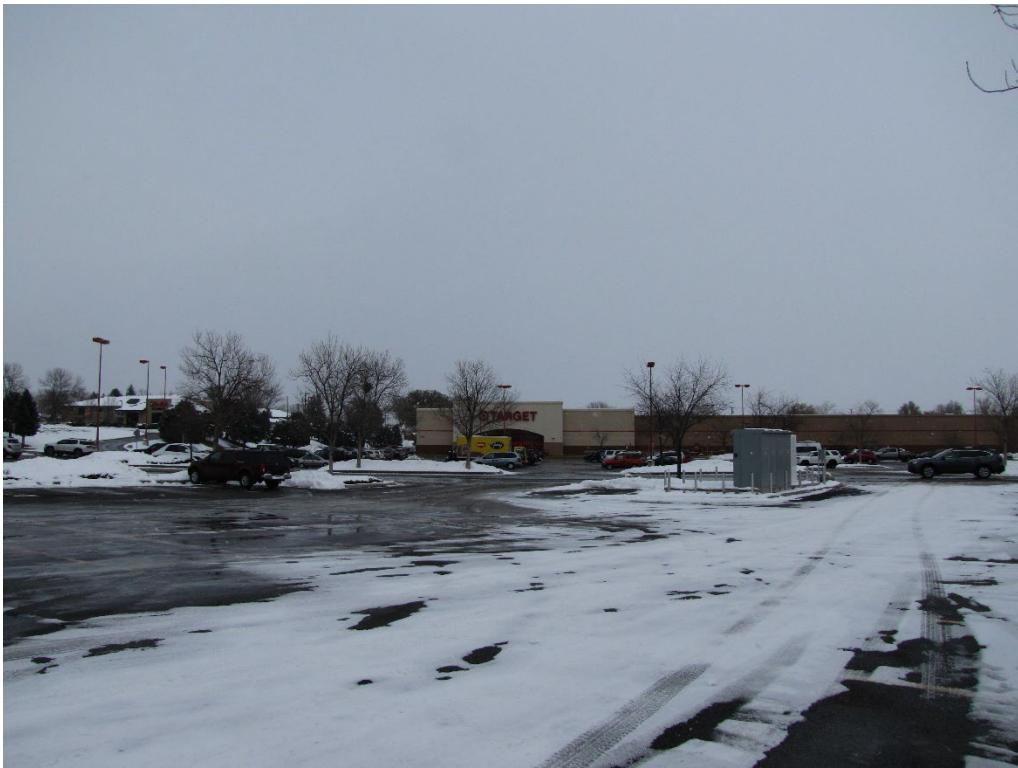
View of Target façade from entryway