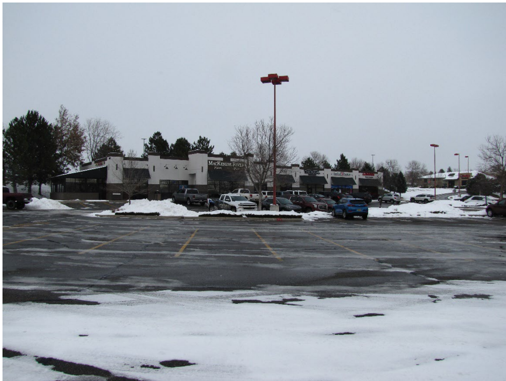
View north and west from parking lot – MacKenzie River Pizza