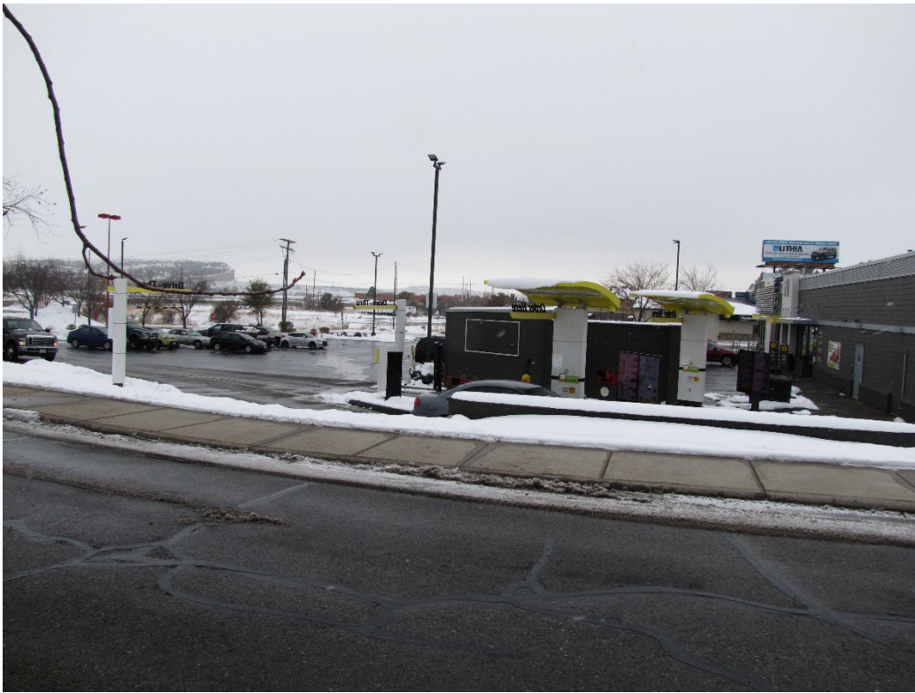
View south from entry driveway – MacDonald's drive through lanes