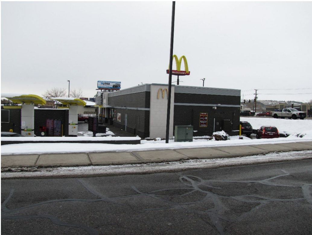
View south and west from entry driveway