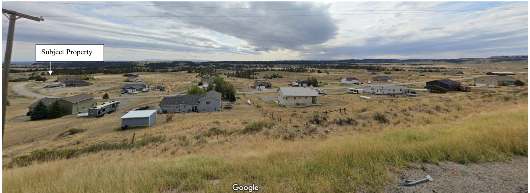
McFarland Subdivision view south and west from Molt Rd – north of subject property and SZD 12 boundary