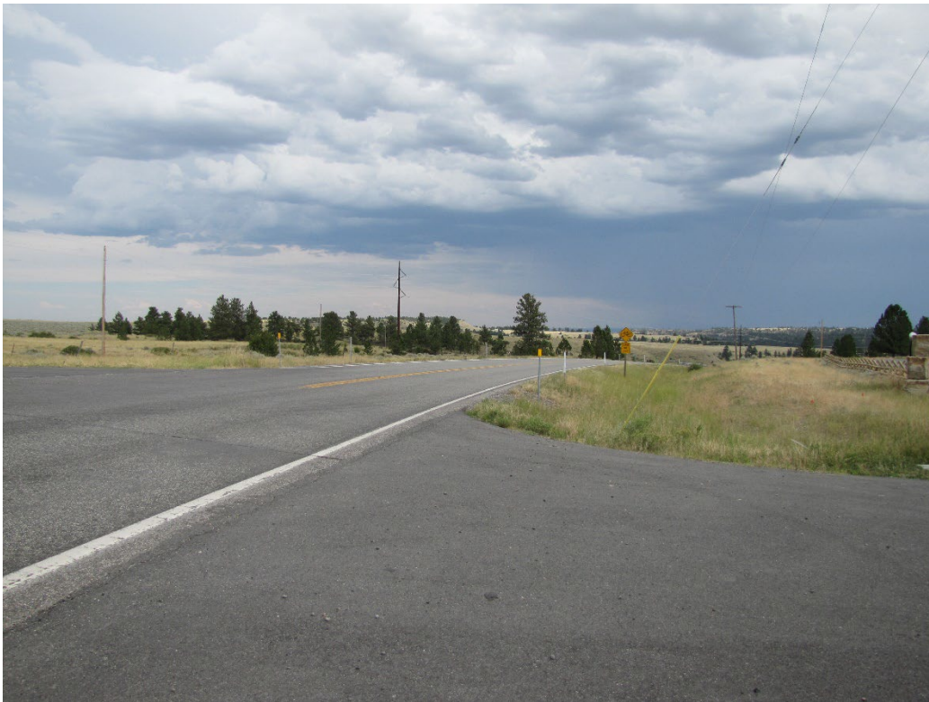
View south and east across Molt Rd