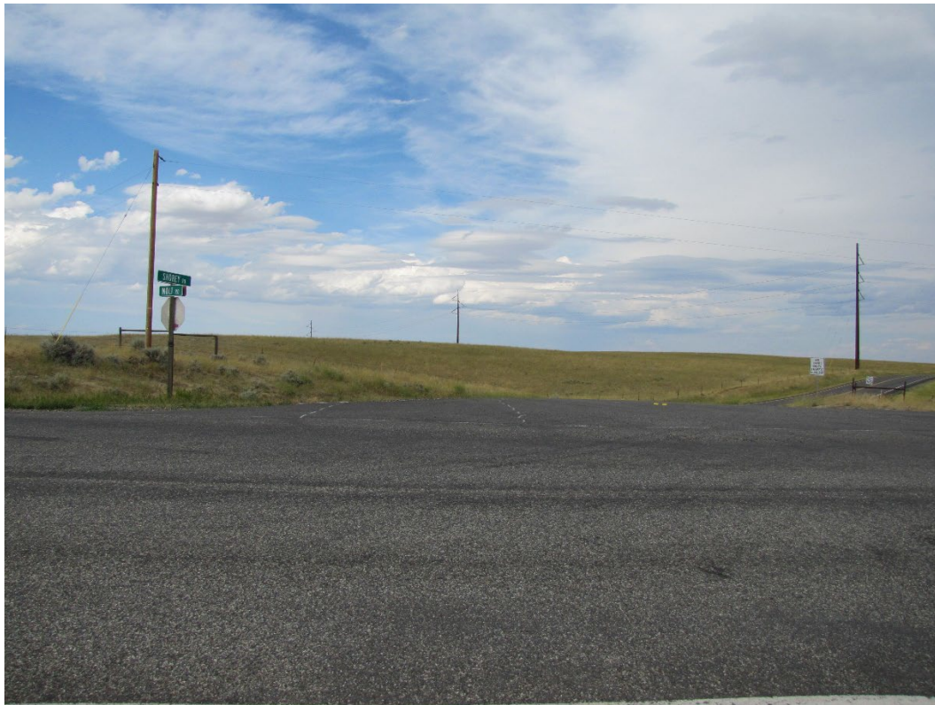
View east across Molt Rd to Shorey Rd intersection from north entry drive