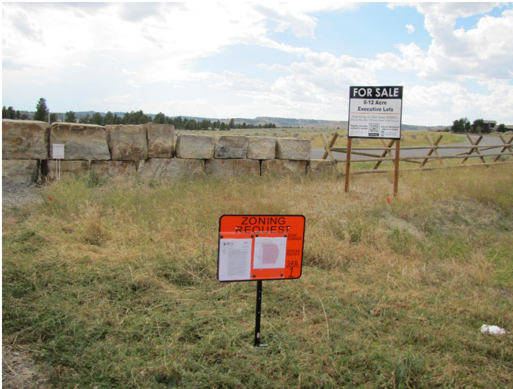
Subject Property – view from north entry drive off Molt Road