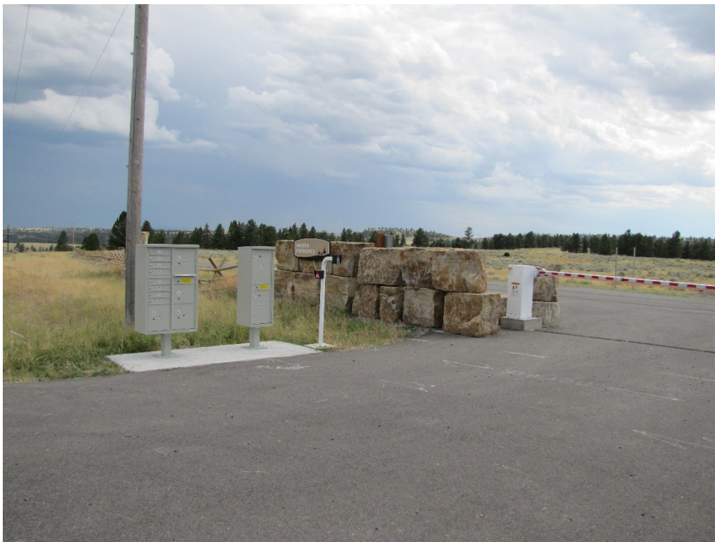
View south and west from north entry drive