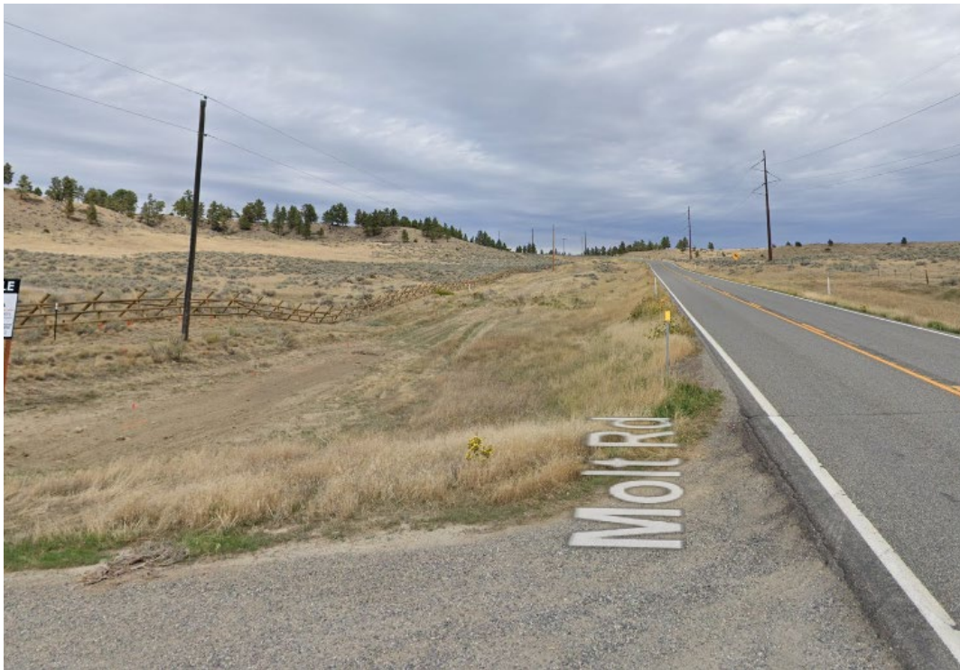
View north on Molt Rd from south entry drive