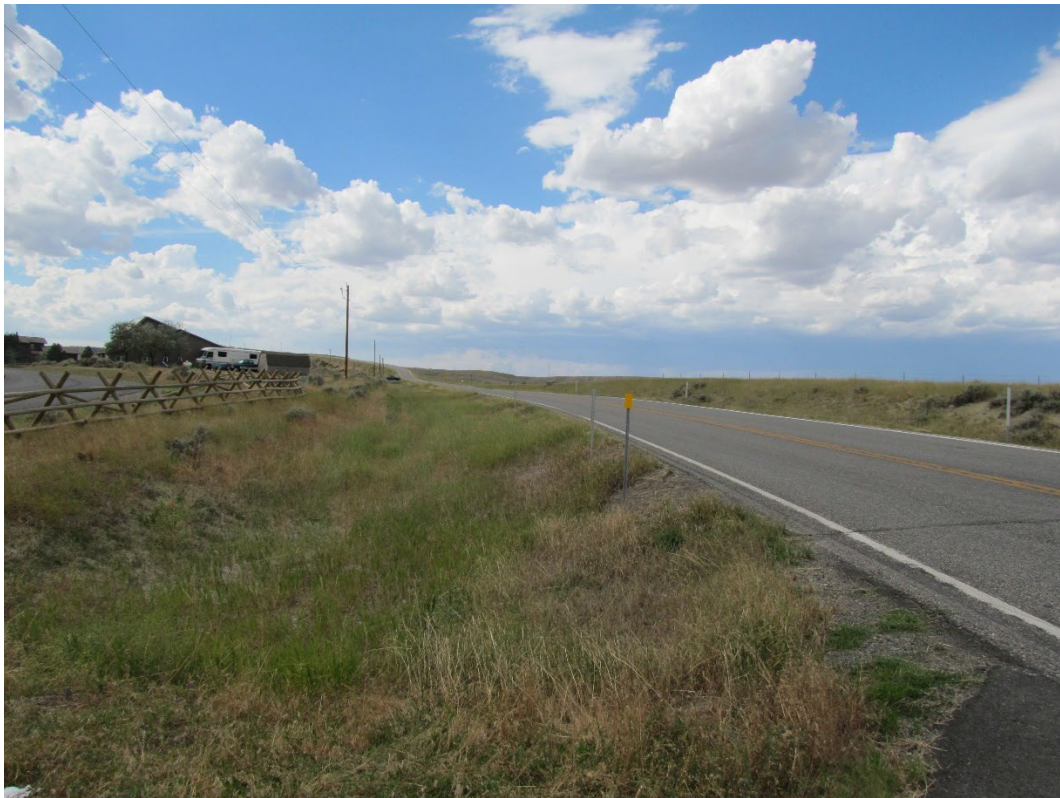
View north on Molt Road from north entry drive