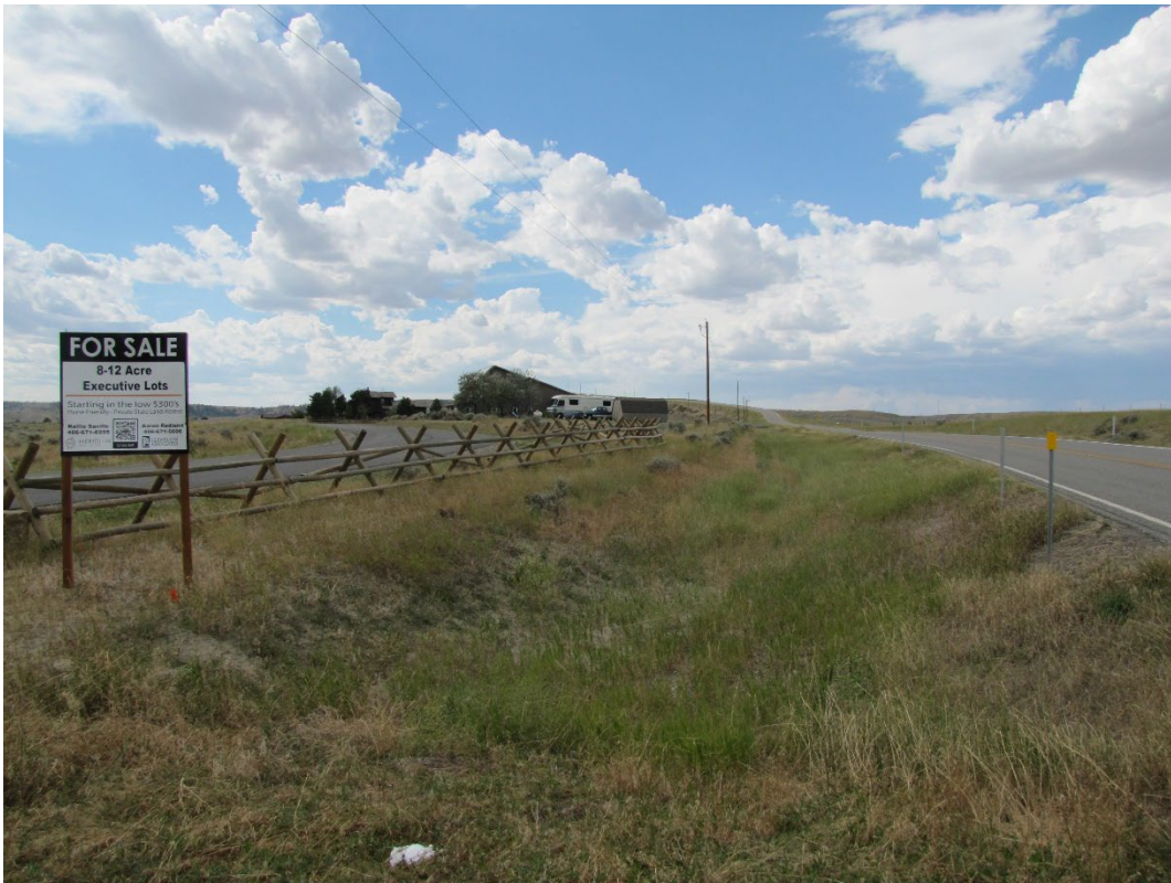
View north from entry road to McFarland Subdivision