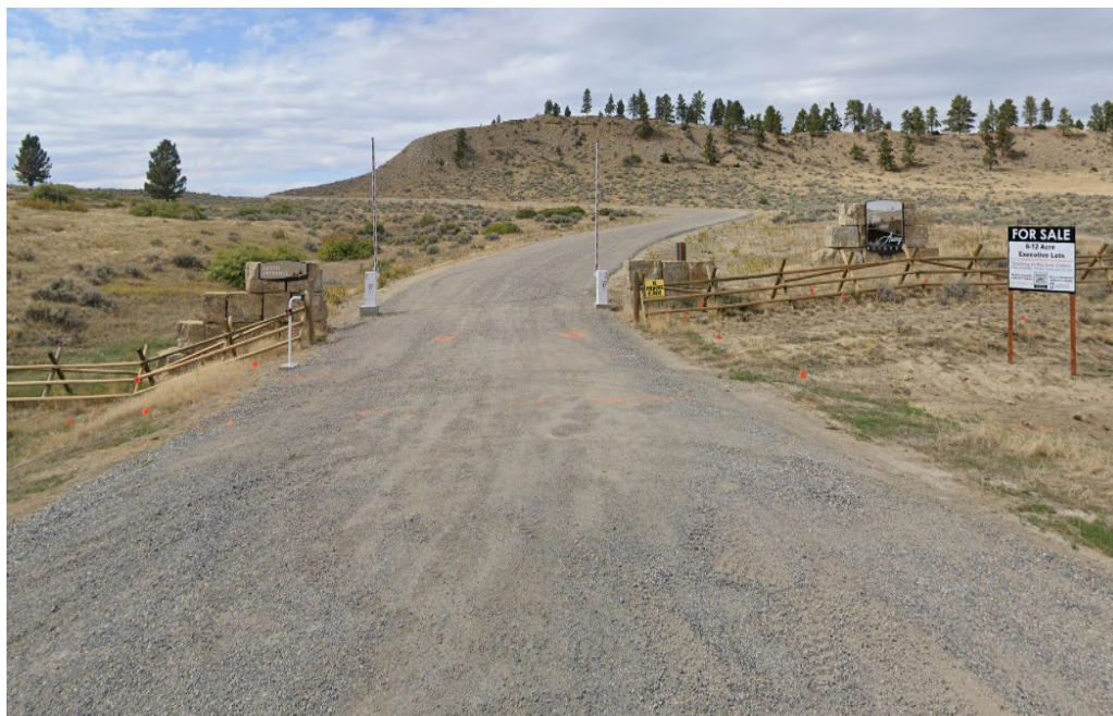
Subject Property – view from south entry drive off Molt Road