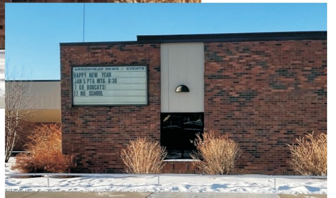
EXISTING MANUAL READER CABINET - REMOVE