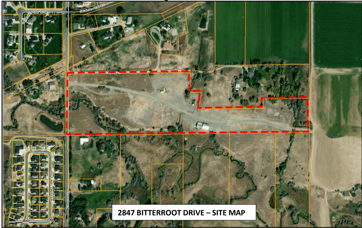
Exhibit A Zoning Master Plan