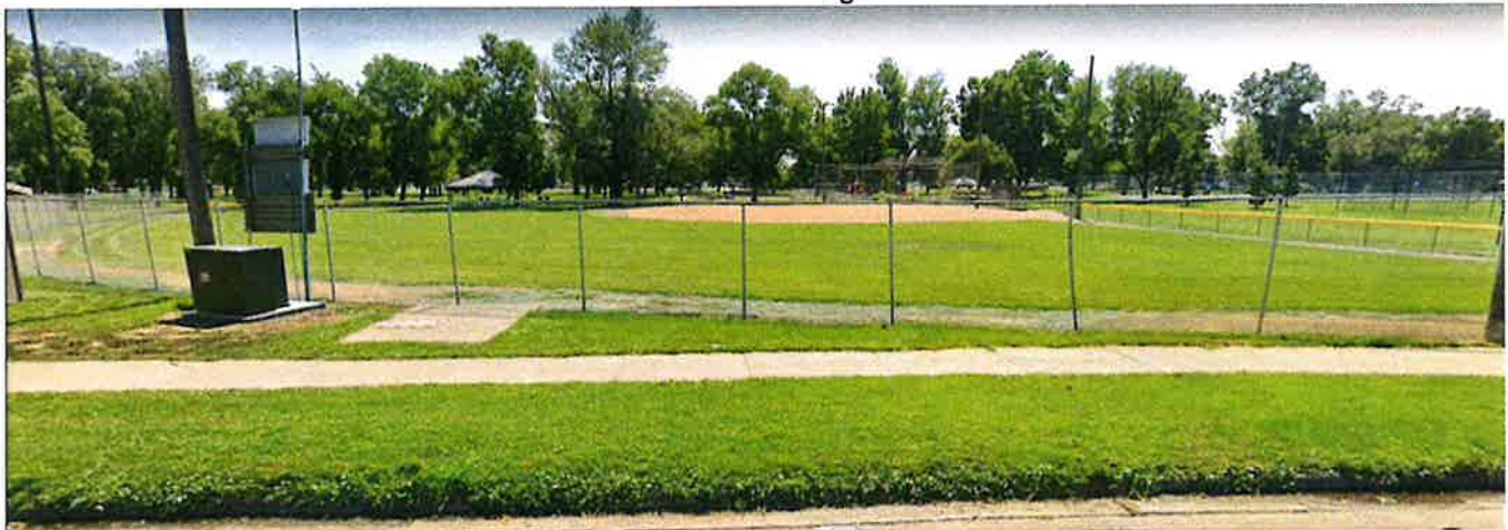
Subject of photo: North Park Baseball Diamond, Billings, MT 59101 Photo is taken looking: South