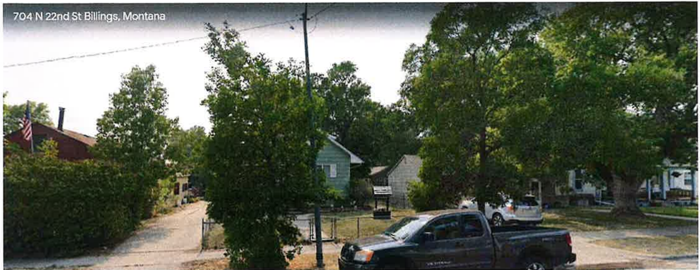
Subject of photo: Residential properties along N 22 nd Street, Billings, MT 59101 Property across the street to the west of the subject property

PHOTOGRAPHS (35mm or good quality digitals of each exterior side of property, and photos of adjacent streetscape) Photocopy this page for additional photos