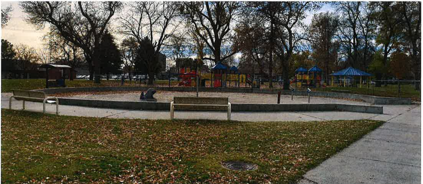
Subject of photo: North Park Wading Pool & Playground, Billings, MT 59101