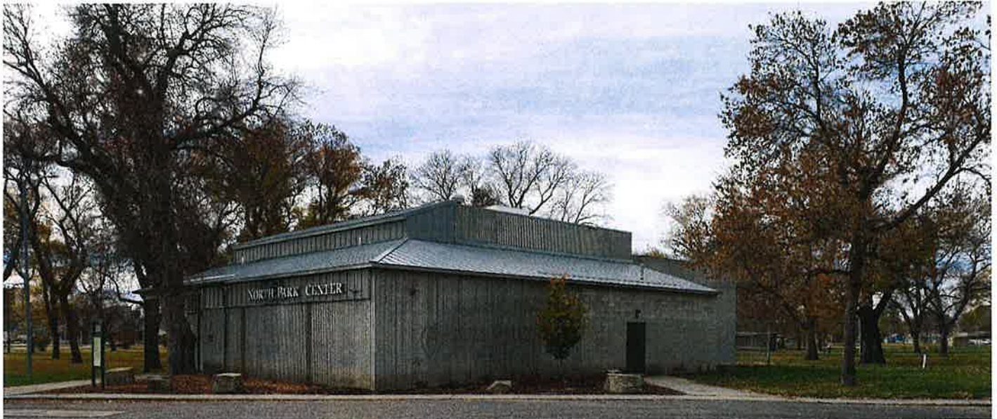
Subject of photo: North Park Recreation Center / Access from parking lot along North 19th Street, Billings, MT 59101 Photo is taken looking: West

PHOTOGRAPHS (35mm or good quality digitals of each exterior side of property, and photos of adjacent streetscape) Photocopy this page for additional photos