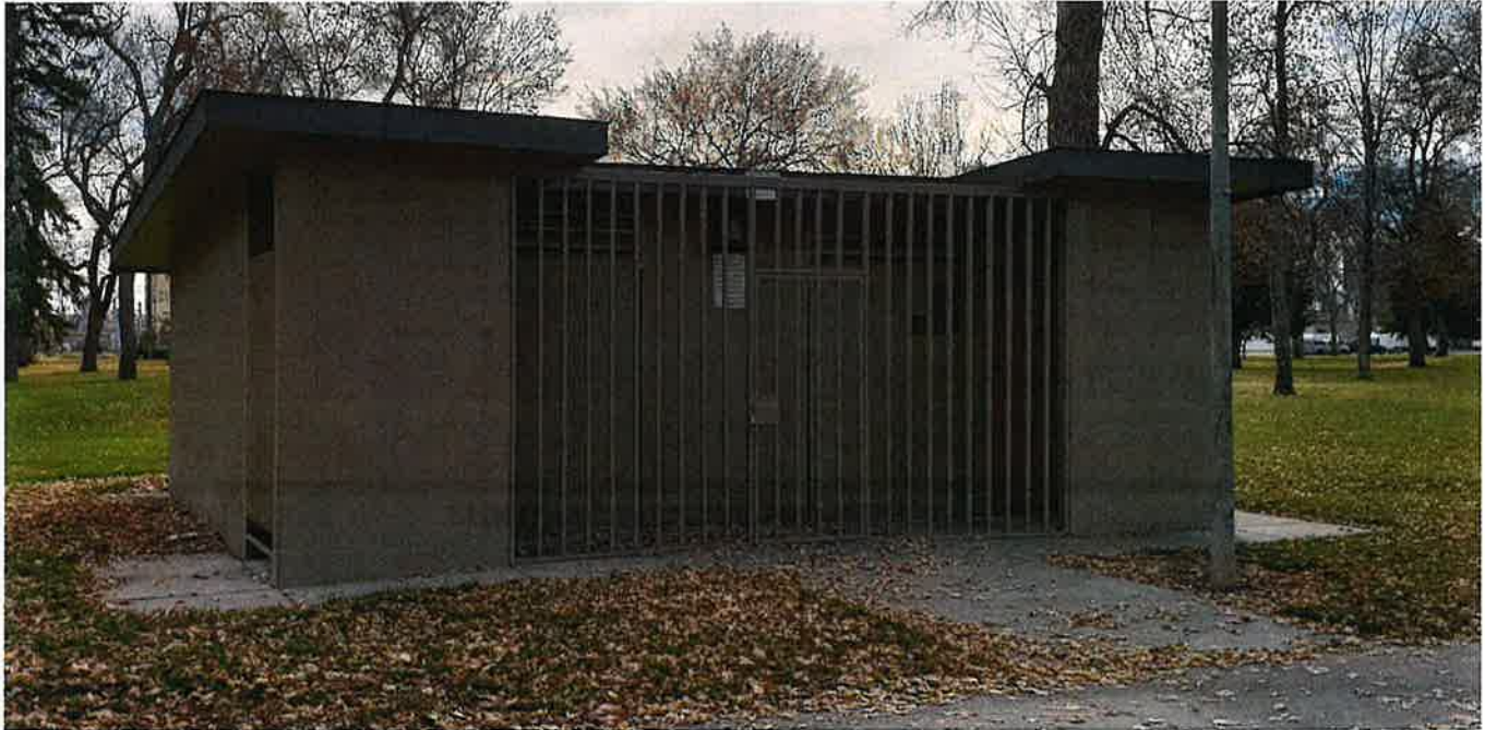
Subject of photo: North Park Restroom, Billings, MT 59101 Photo is taken looking: South

Photocopy this page for additional photos