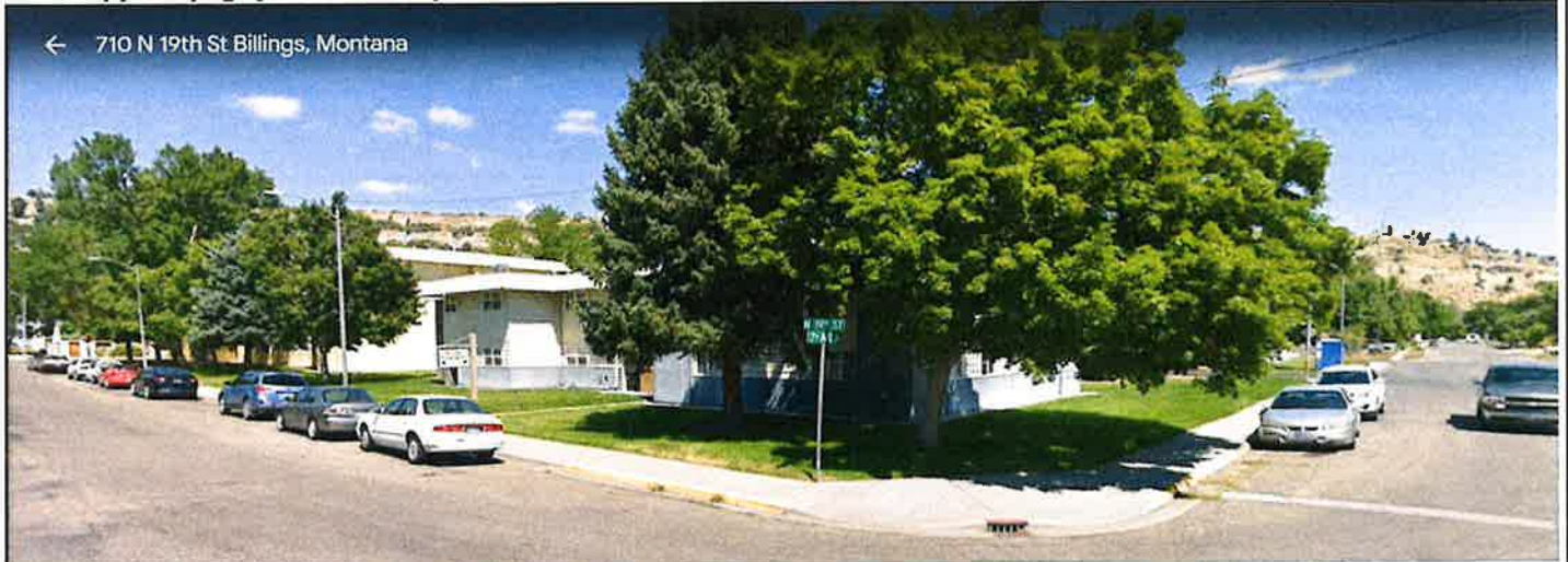
Subject of photo: Residential properties along N 19 th Street, Billings, MT 59101 Property across the street to the east of the subject property

PHOTOGRAPHS (35mm or good quality digitals of each exterior side of property, and photos of adjacent streetscape) Photocopy this page for additional photos