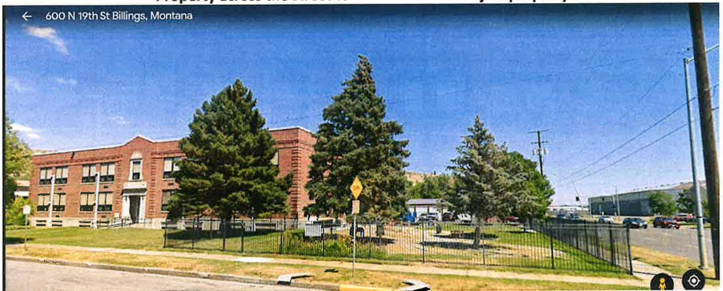
Subject of photo: Commercial property along N 19 th Street, Billings, MT 59101 Former North Park School / Now Head Start

Property across the street to the east of the subject property