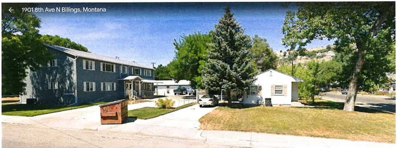
Subject of photo: Residential properties along 8 th Avenue N, Billings, MT 59101 Property across the street to the north of the subject property