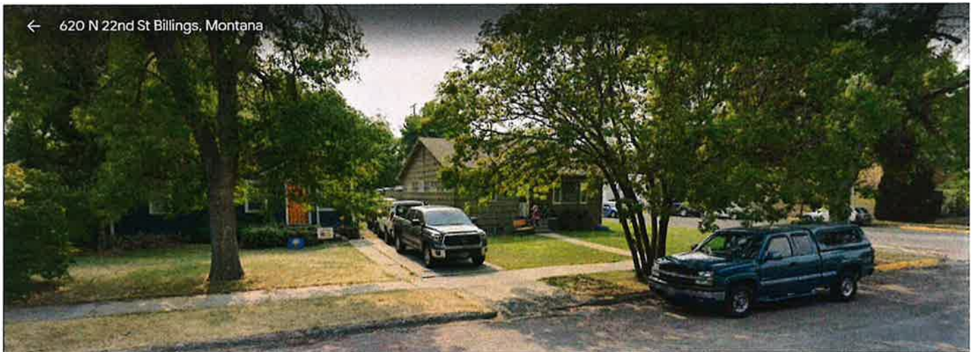
Subject of photo: Residential properties along N 22 nd Street, Billings, MT 59101 Property across the street to the west of the subject property