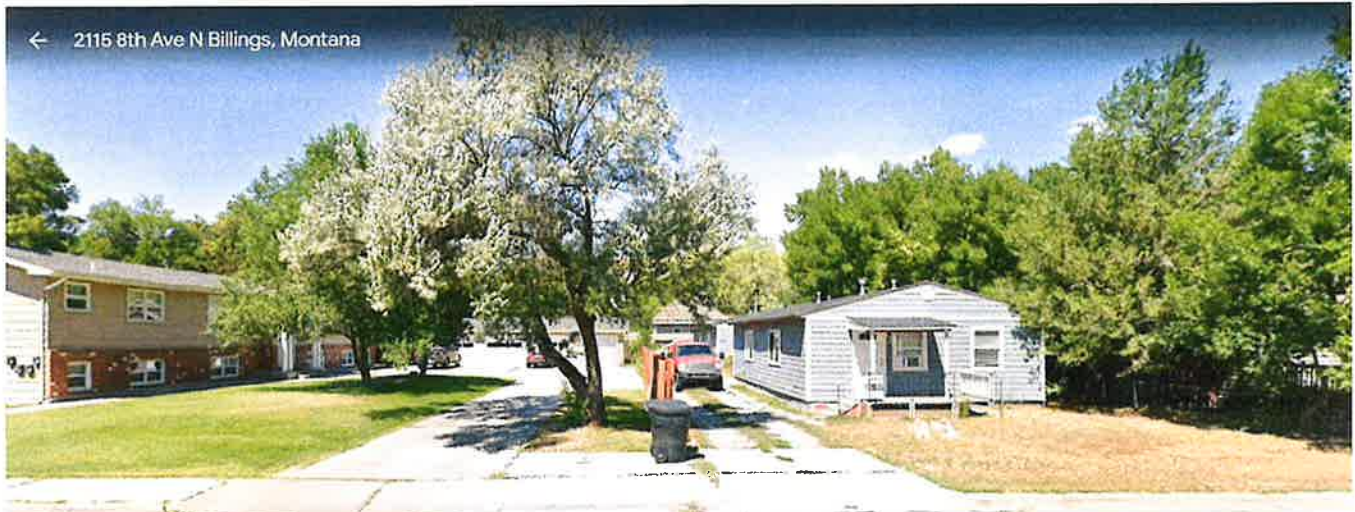
Subject of photo: Residential properties along 8 th Avenue N, Billings, MT 59101 Property across the street to the north of the subject property

PHOTOGRAPHS (35mm or good quality digitals of each exterior side of property, and photos of adjacent streetscape) Photocopy this page for additional photos