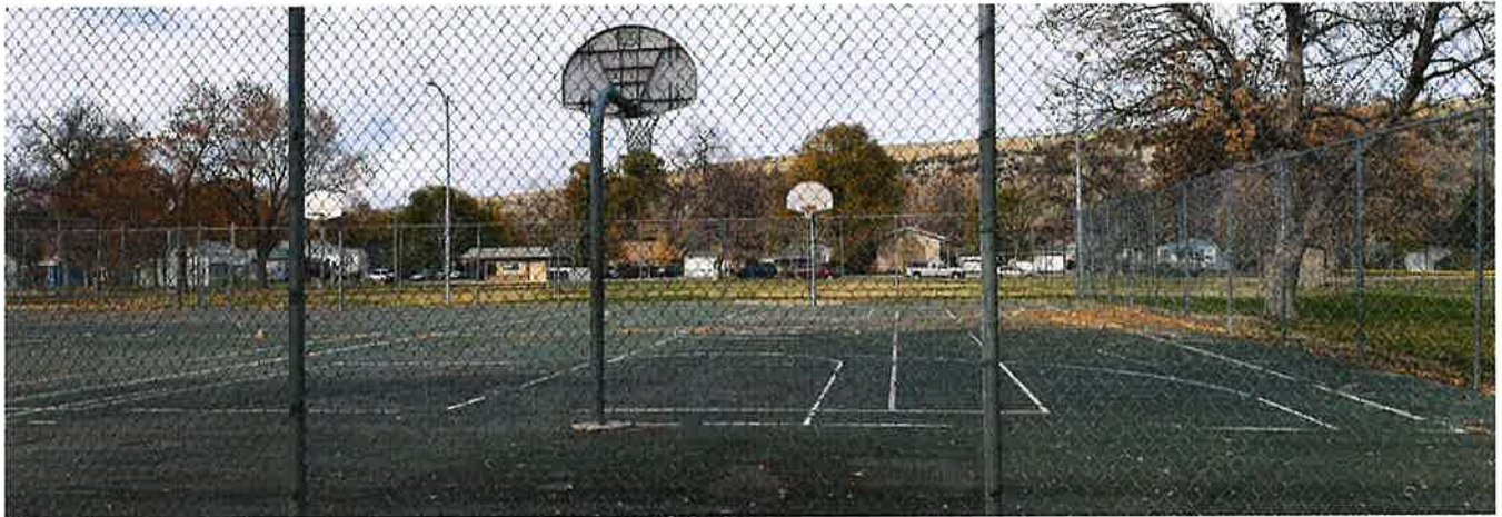
Subject of photo: North Park Basketball Courts, Billings, MT 59101 Photo is taken looking: North

PHOTOGRAPHS (35mm or good quality digitals of each exterior side of property, and photos of adjacent streetscape) Photocopy this page for additional photos