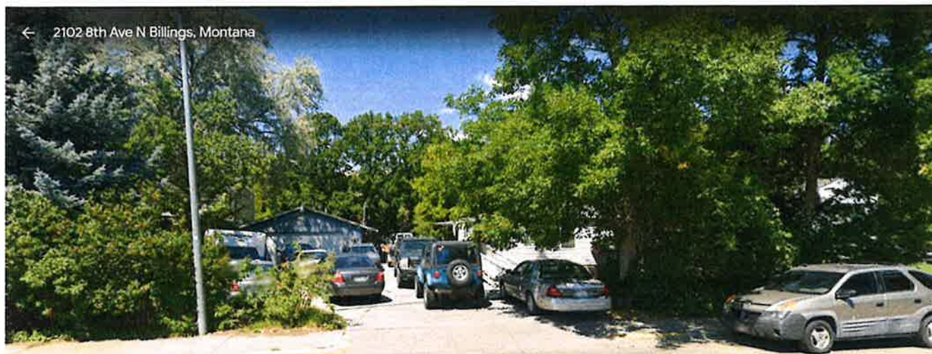
Subject of photo: Residential properties along 8 th Avenue N, Billings, MT 59101 Property across the street to the north of the subject property

PHOTOGRAPHS (35mm or good quality digitals of each exterior side of property, and photos of adjacent streetscape) Photocopy this page for additional photos