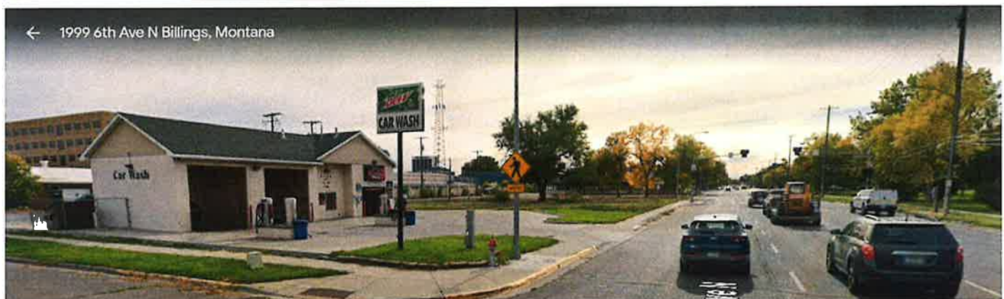
Subject of above photos: Commercial properties along 6 th Avenue N, Billings, MT 59101 Property across the street to the south of the subject property