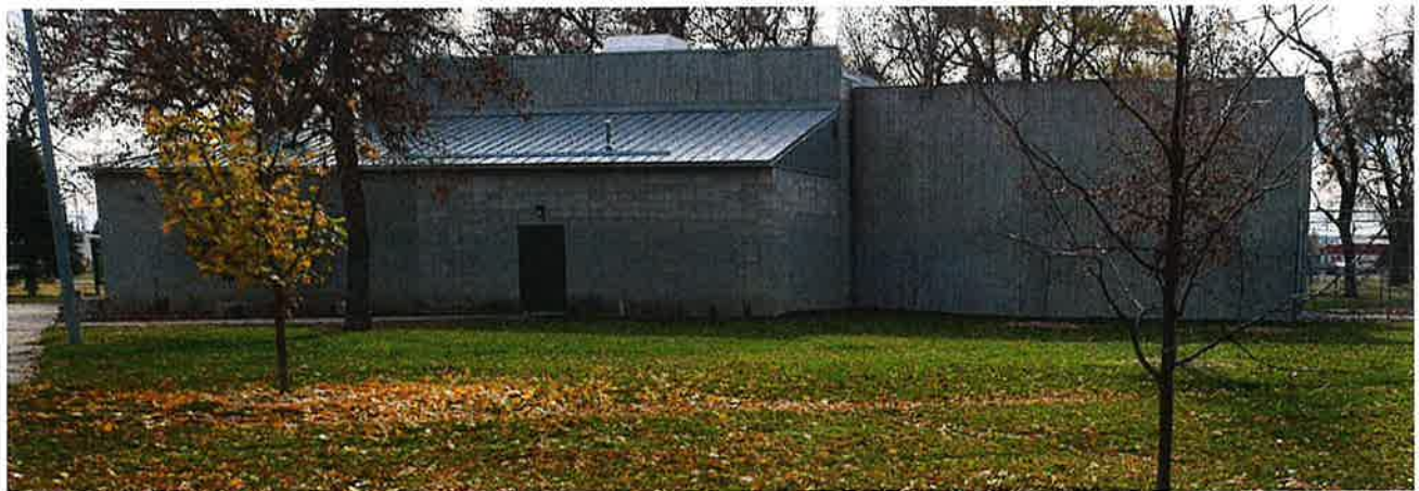
Subject of photo: North Park Recreation Center / Billings, MT 59101 Photo is taken looking: South