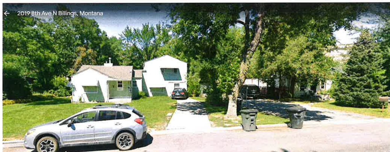
Subject of photo: Residential properties along 8 th Avenue N, Billings, MT 59101 Property across the street to the north of the subject property