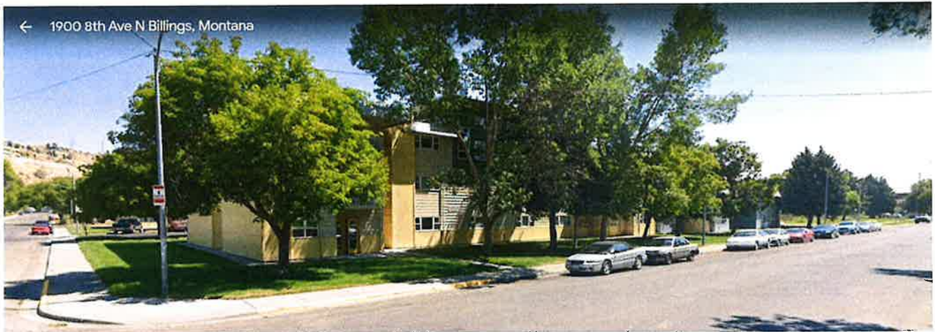
Subject of photo: Residential properties along N 19 th Street, Billings, MT 59101 Property across the street to the east of the subject property

PHOTOGRAPHS (35mm or good quality digitals of each exterior side of property, and photos of adjacent streetscape) Photocopy this page for additional photos