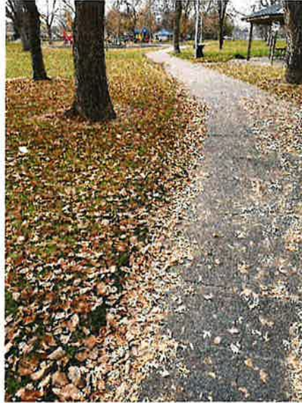
Subject of photo: North Park E-W walkway and picnic shelter, Billings, MT 59101

Photocopy this page for additional photos