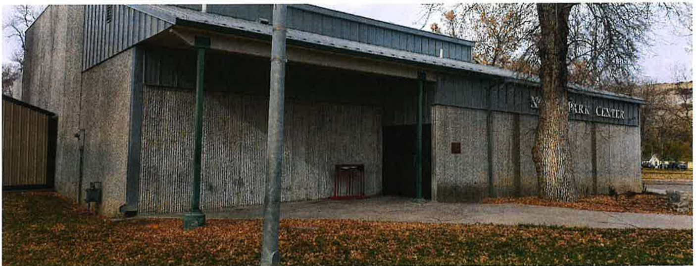
Subject of photo: North Park Recreation Center / Billings, MT 59101 Photo is taken looking: North