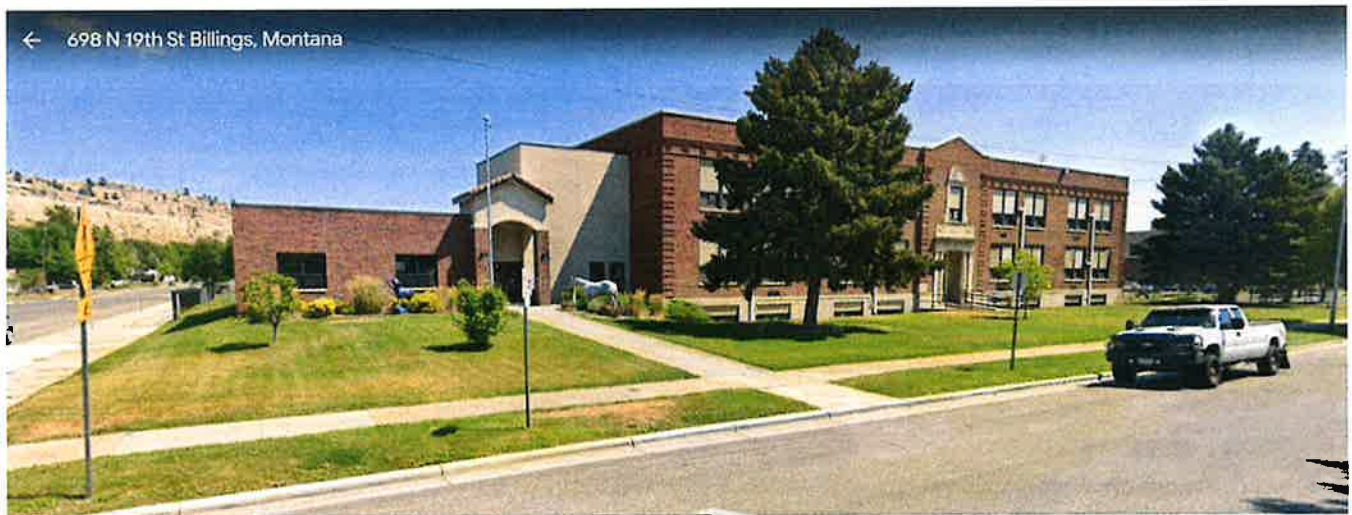
Subject of photo: Commercial property along N 19 th Street, Billings, MT 59101 Former North Park School / Now Head Start Property across the street to the east of the subject property