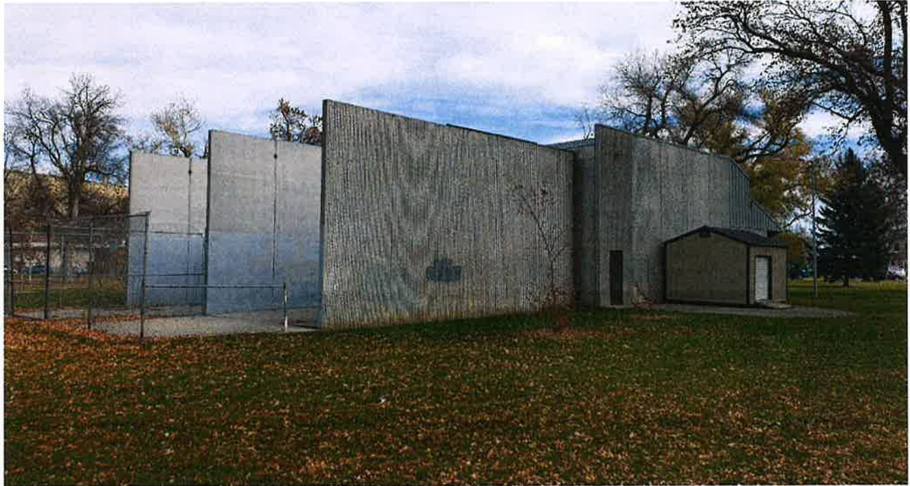
Subject of photo: North Park Recreation Center / Handball Court Addition, Billings, MT 59101 Photo is taken looking: East

PHOTOGRAPHS (35mm or good quality digitals of each exterior side of property, and photos of adjacent streetscape) Photocopy this page for additional photos