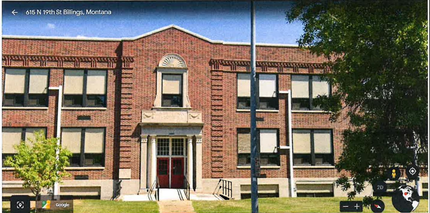
Subject of photo: Commercial property along N 19 th Street, Billings, MT 59101 Former North Park School / Now Head Start

PHOTOGRAPHS (35mm or good quality digitals of each exterior side of property, and photos of adjacent streetscape) Photocopy this page for additional photos