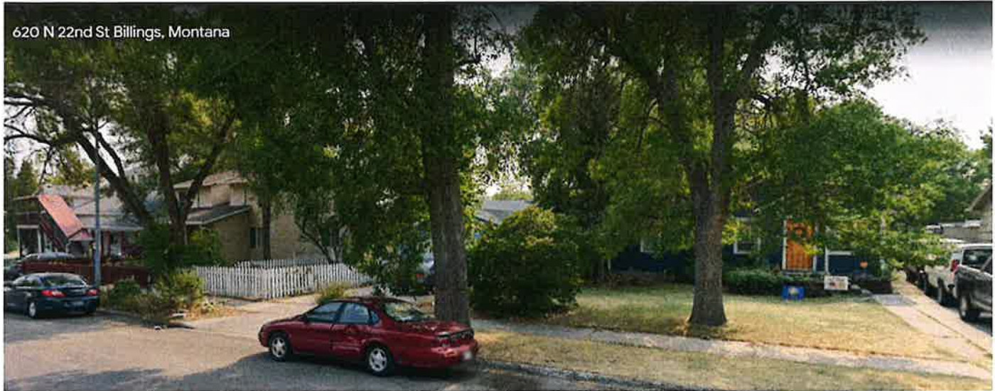
Subject of photo: Residential properties along N 22 nd Street, Billings, MT 59101 Property across the street to the west of the subject property

PHOTOGRAPHS (35mm or good quality digitals of each exterior side of property, and photos of adjacent streetscape) Photocopy this page for additional photos