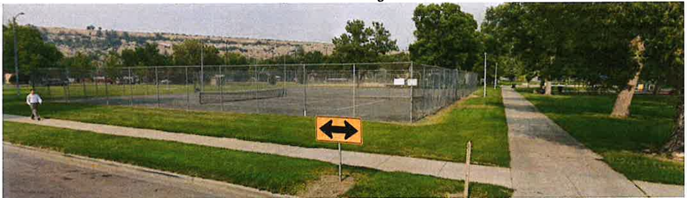
Subject of photo: North Park Tennis Courts & E-W walkway, Billings, MT 59101 Photo is taken looking: East