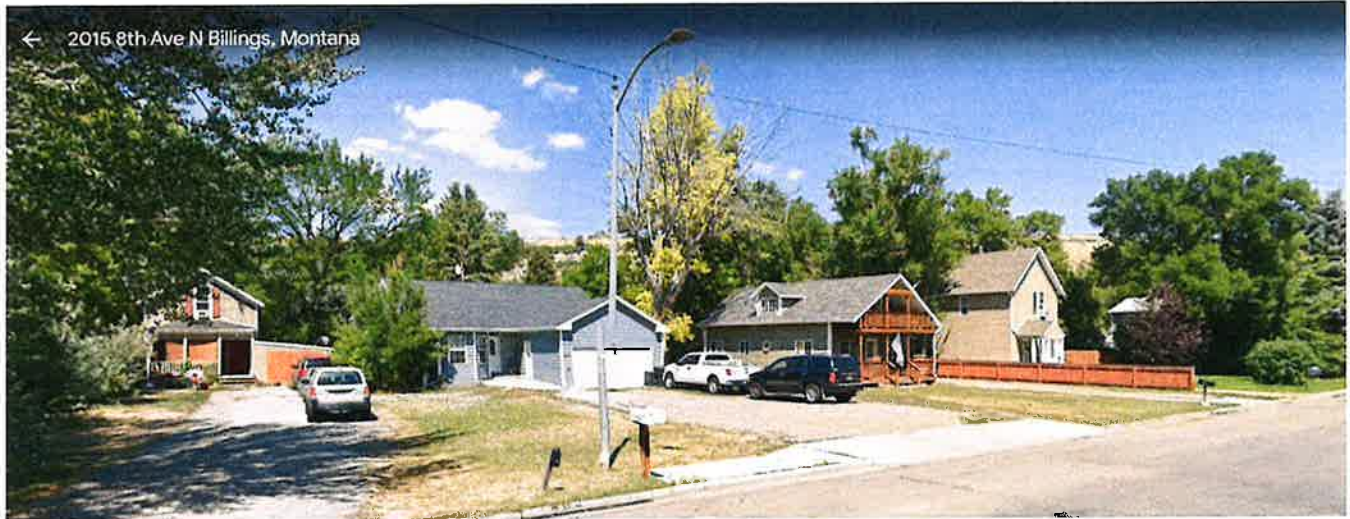
Subject of photo: Residential properties along 8 th Avenue N, Billings, MT 59101 Property across the street to the north of the subject property

PHOTOGRAPHS (35mm or good quality digitals of each exterior side of property, and photos of adjacent streetscape) Photocopy this page for additional photos