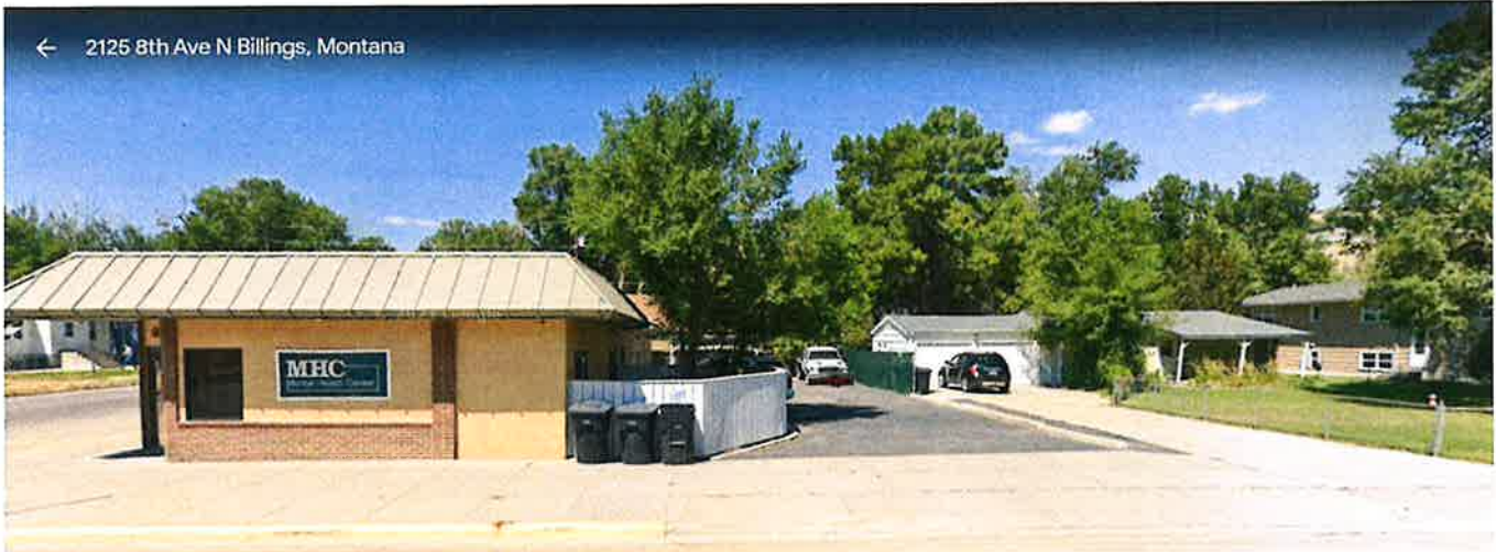
Subject of photo: Commercial & Residential properties along 8 th Avenue N, Billings, MT 59101 Property across the street to the north of the subject property

PHOTOGRAPHS (35mm or good quality digitals of each exterior side of property, and photos of adjacent streetscape) Photocopy this page for additional photos