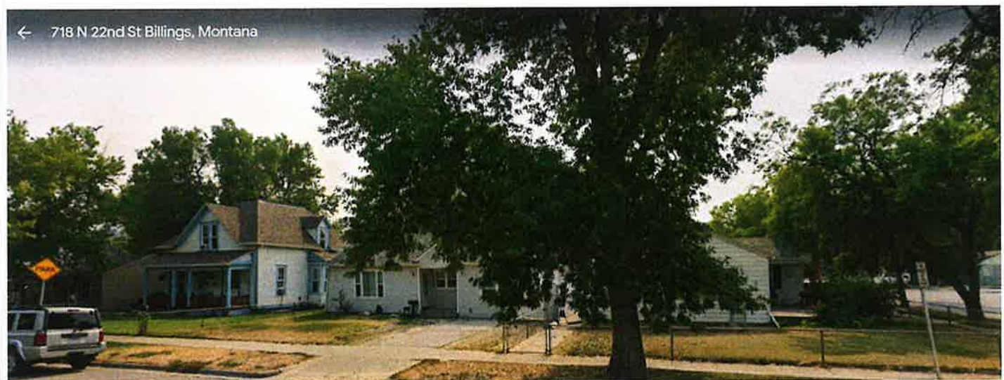
Subject of photo: Residential properties along N 22 nd Street, Billings, MT 59101 Property across the street to the west of the subject property