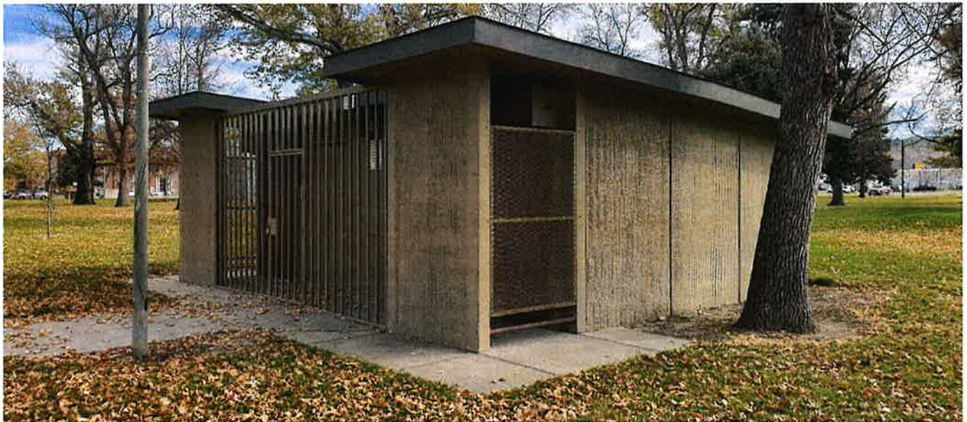
Subject of photo: North Park Restroom, Billings, MT 59101 Photo is taken looking: Southeast