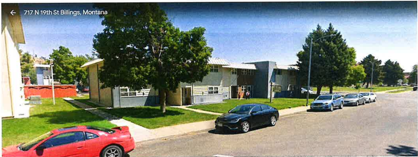
Subject of photo: Residential properties along 8 th Avenue N, Billings, MT 59101 Property across the street to the north of the subject property