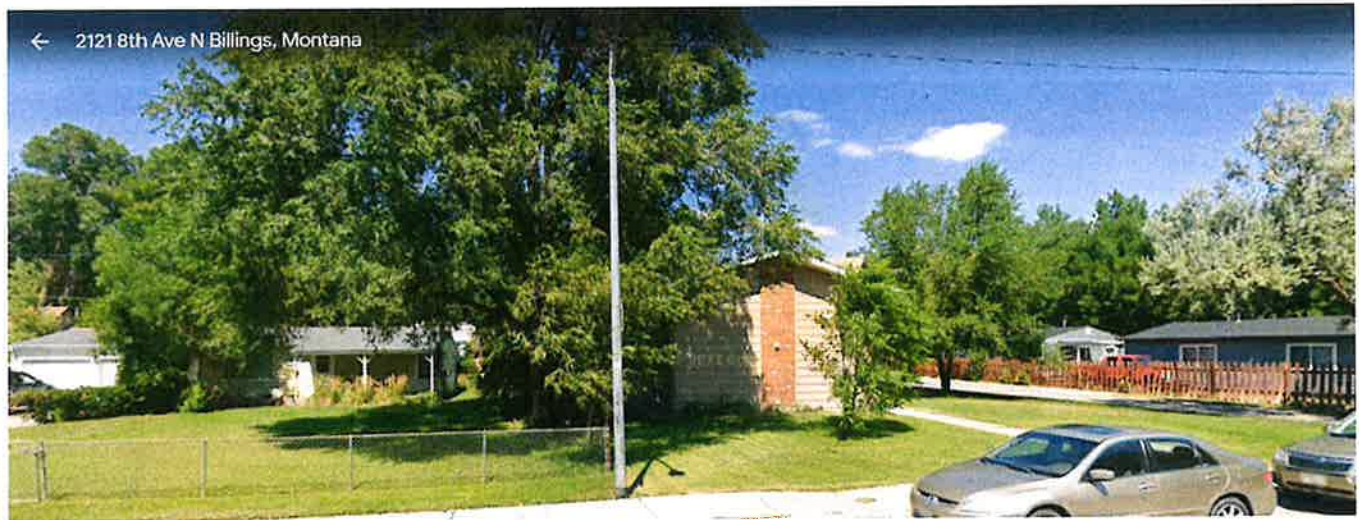
Subject of photo: Residential properties along 8 th Avenue N, Billings, MT 59101 Property across the street to the north of the subject property