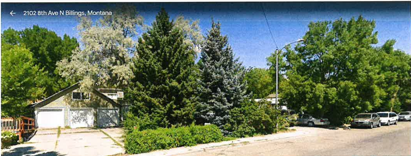
Subject of photo: Residential properties along 8 th Avenue N, Billings, MT 59101 Property across the street to the north of the subject property