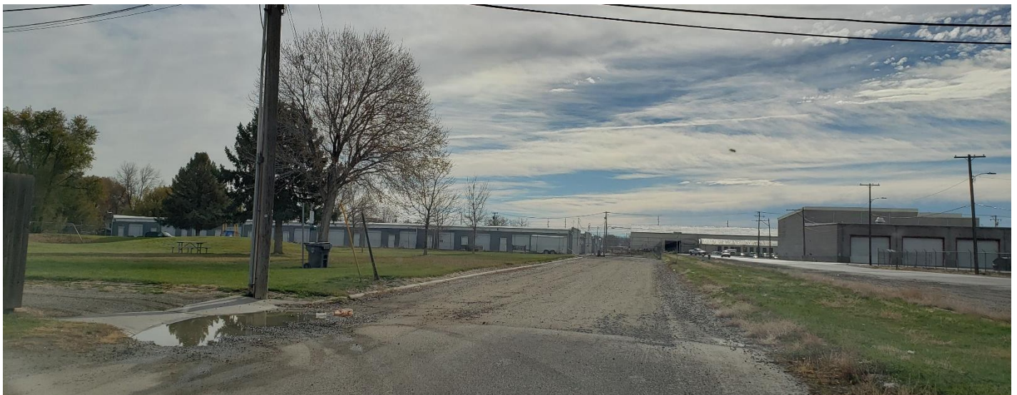
Subject of photo: Entrance to Comanche Park Area via S Plainview Street, Billings, MT 59101 Alley entrance lower left corner Photo is taken looking: South

PHOTOGRAPHS (35mm or good quality digitals of each exterior side of property, and photos of adjacent streetscape) Photocopy this page for additional photos