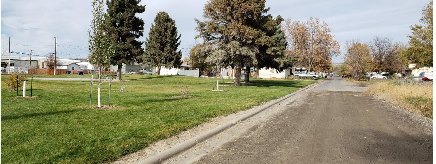
Subject of photo: Comanche Park Area via S 12 Street W, Billings, MT 59101 Photo is taken looking: North