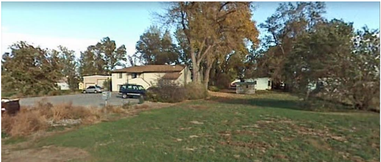
Subject of photo: Residential properties along S 12 th Street W, Billings, MT 59101

Photocopy this page for additional photos