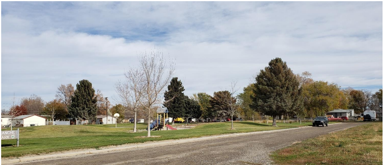
Subject of photo: Comanche Park from corner of S Plainview Street & Kalmar Drive, Billings, MT 59101 Photo is taken looking: Northeast

PHOTOGRAPHS (35mm or good quality digitals of each exterior side of property, and photos of adjacent streetscape) Photocopy this page for additional photos