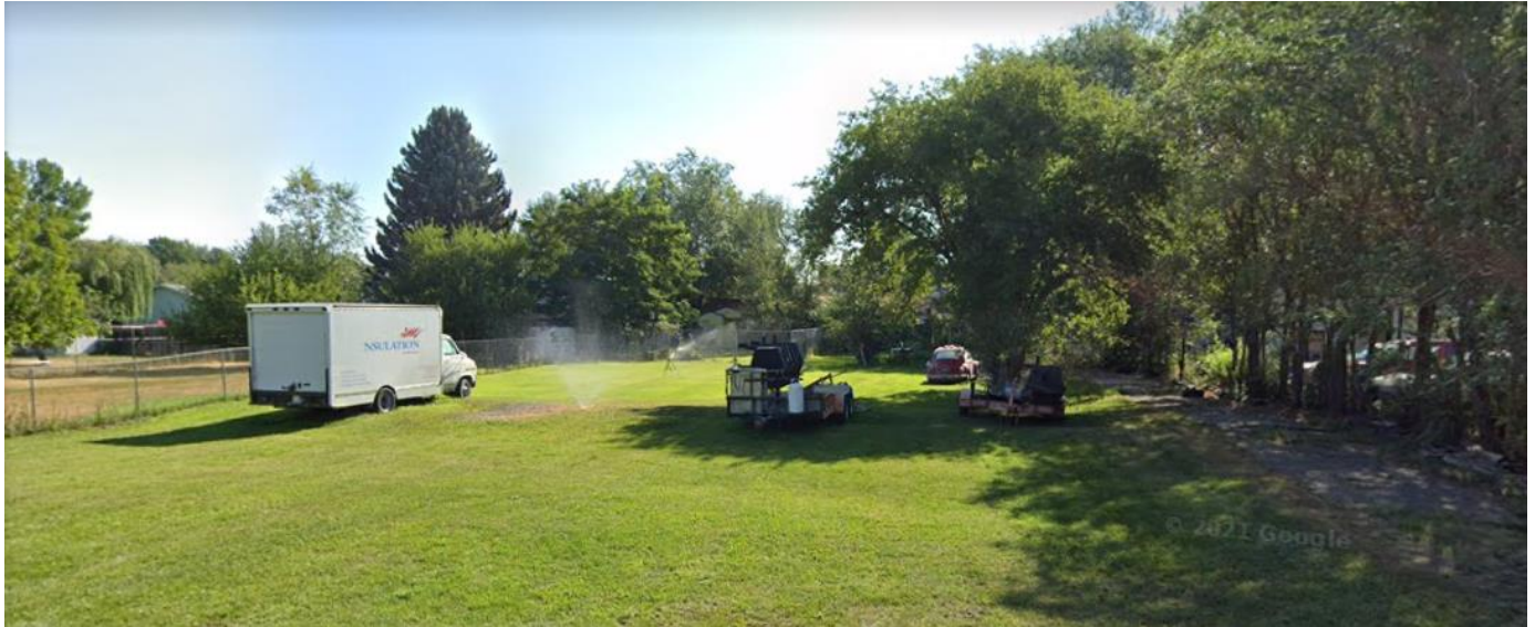
Subject of photo: Residential property along S 12 th Street W, Billings, MT 59101

Photocopy this page for additional photos