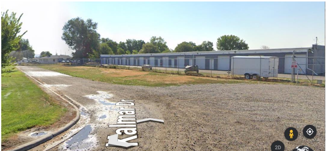
Subject of photo: Commercial property along Kalmar Drive, Billings, MT 59101

PHOTOGRAPHS (35mm or good quality digitals of each exterior side of property, and photos of adjacent streetscape) Photocopy this page for additional photos