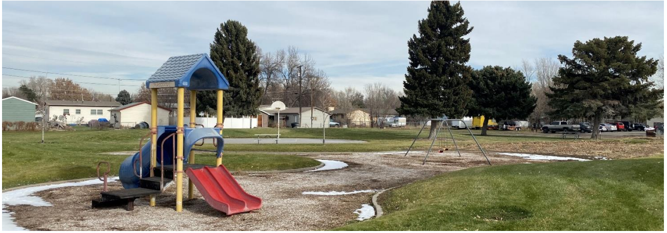
Subject of photo: Comanche Park Playground & Basketball Area / Billings, MT 59101 Photo is taken looking: North