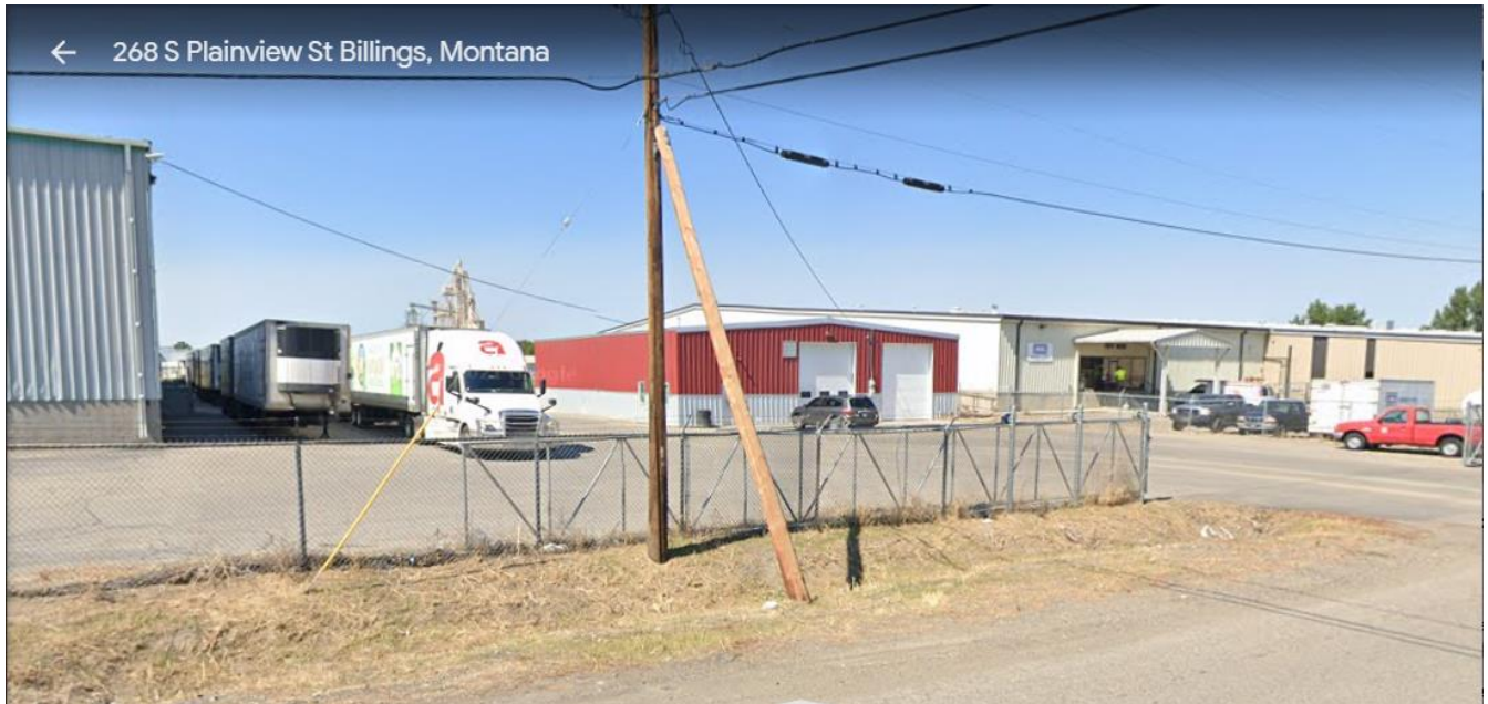
Subject of photo: Commercial properties along S Plainview Street, Billings, MT 59101 Property across the street to the west of the subject property