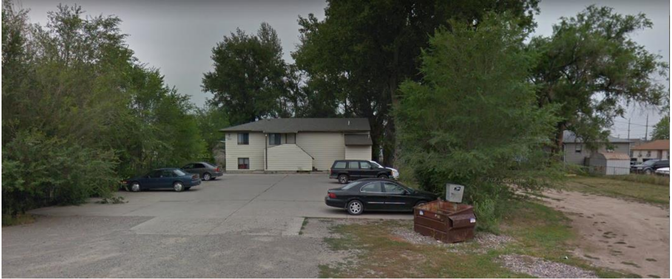
Subject of photo: Residential properties along S 12 th Street W, Billings, MT 59101