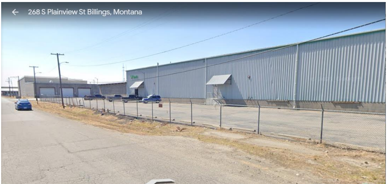
Subject of photo: Commercial properties along S Plainview Street, Billings, MT 59101

PHOTOGRAPHS (35mm or good quality digitals of each exterior side of property, and photos of adjacent streetscape) Photocopy this page for additional photos