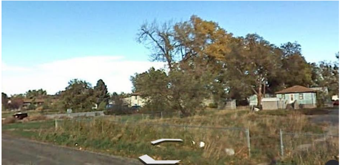
Subject of photo: Residential properties along S 12 th Street West, Billings, MT 59101 Property across the street to the east of the subject property