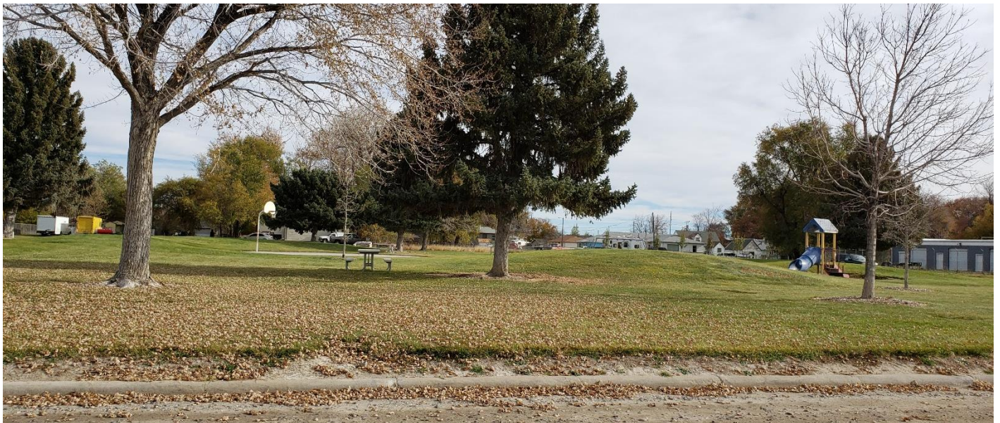
Subject of photo: Comanche Park from S Plainview Street, Billings, MT 59101 Photo is taken looking: East

PHOTOGRAPHS (35mm or good quality digitals of each exterior side of property, and photos of adjacent streetscape) Photocopy this page for additional photos