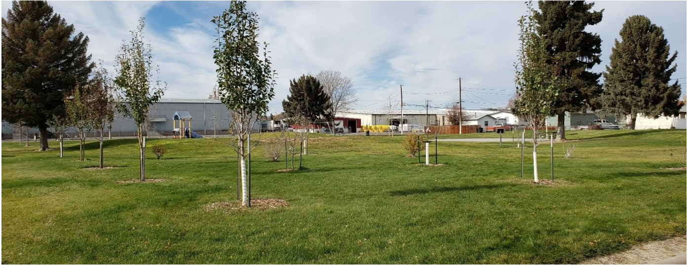
Subject of photo: Comanche Park from the alley, Billings, MT 59101 Photo is taken looking: South