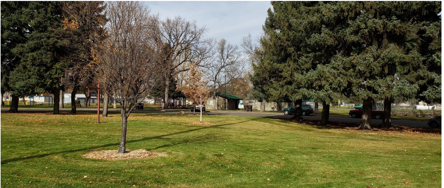
Subject of photo: Central Park, 901 Central Ave., Billings, MT 59101 Photo is taken looking: North

PHOTOGRAPHS (35mm or good quality digitals of each exterior side of property, and photos of adjacent streetscape) Photocopy this page for additional photos