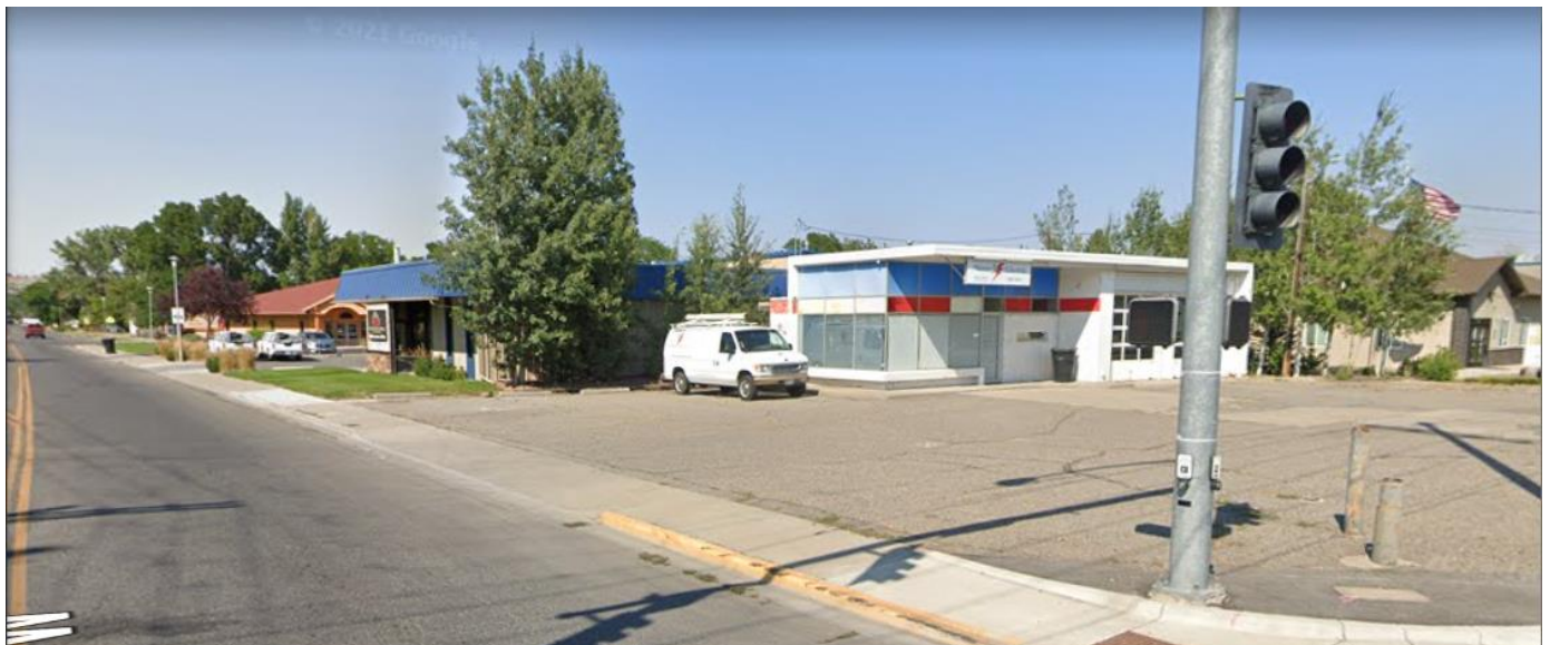
Subject of photo: Commercial properties along 8 th Street W, Billings, MT 59101 Property across the street to the east of the subject property