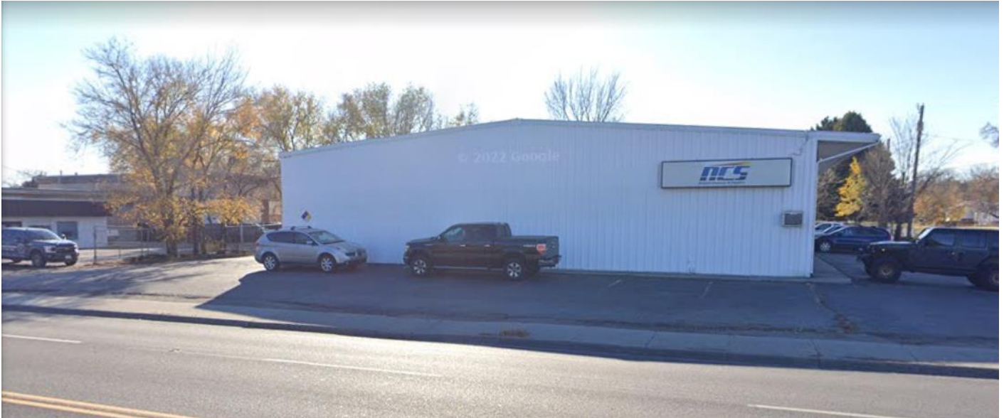
Subject of photo: Commercial property along 8 th Street W, Billings, MT 59101 Property across the street to the south of the subject property

PHOTOGRAPHS (35mm or good quality digitals of each exterior side of property, and photos of adjacent streetscape) Photocopy this page for additional photos