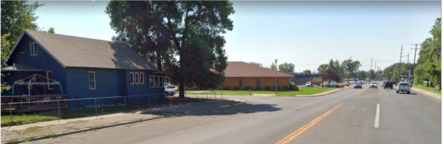
Subject of photo: Residential & commercial properties along 8 th Street W, Billings, MT 59101 Property across the street to the east of the subject property

Photocopy this page for additional photos