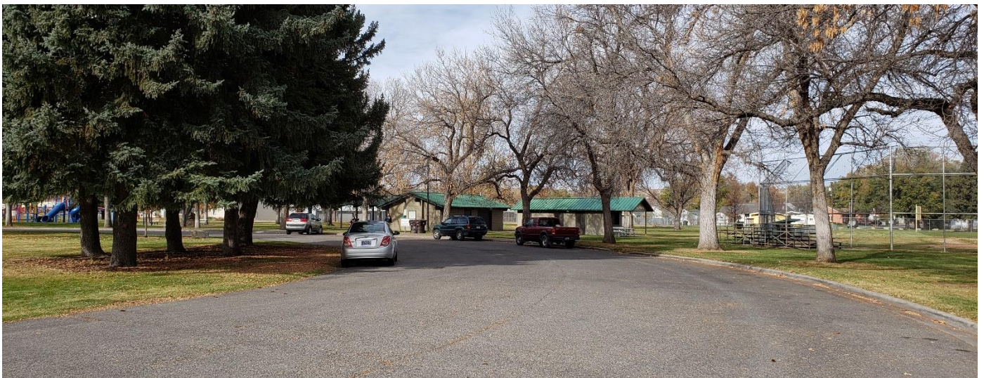
Subject of photo: Central Park main entrance, 901 Central Ave., Billings, MT 59101 Photo is taken looking: Northwest