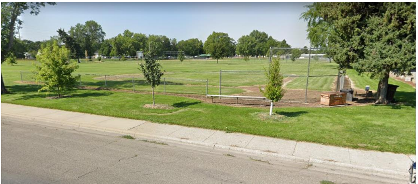
Subject of photo: Central Park, 901 Central Ave., Billings, MT 59101

Photo is taken from the intersection of 8 th Street West & Central Avenue looking: Northwest