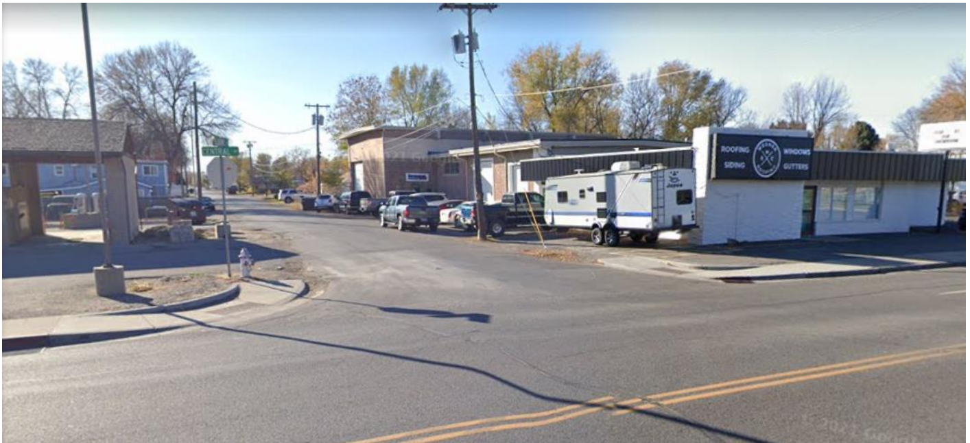
Subject of photo: Commercial properties along 8 th Street W, Billings, MT 59101 Property across the street to the south of the subject property