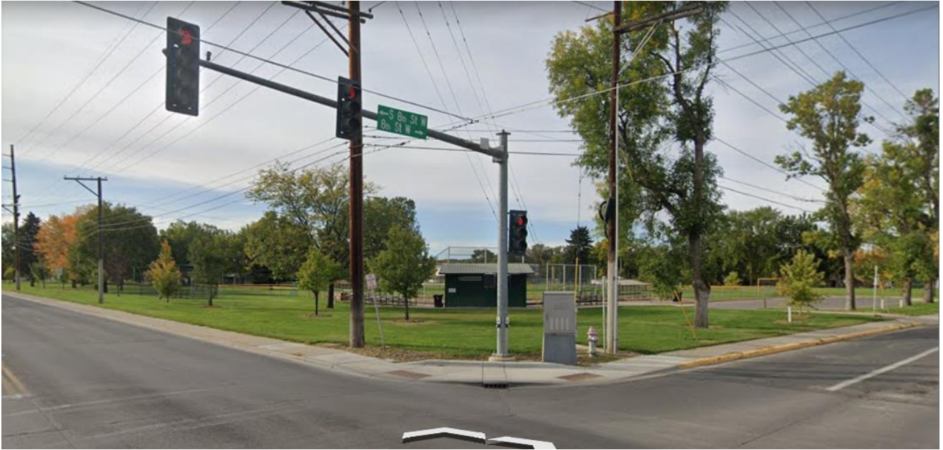
Subject of photo: Central Park, 901 Central Ave., Billings, MT 59101

Photocopy this page for additional photos