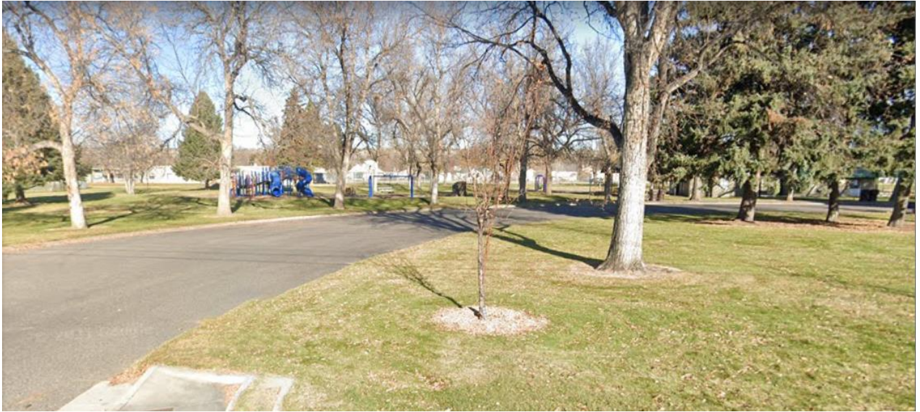
Subject of photo: Central Park main entrance & playground, 901 Central Ave., Billings, MT 59101 Photo is taken looking: North

PHOTOGRAPHS (35mm or good quality digitals of each exterior side of property, and photos of adjacent streetscape) Photocopy this page for additional photos