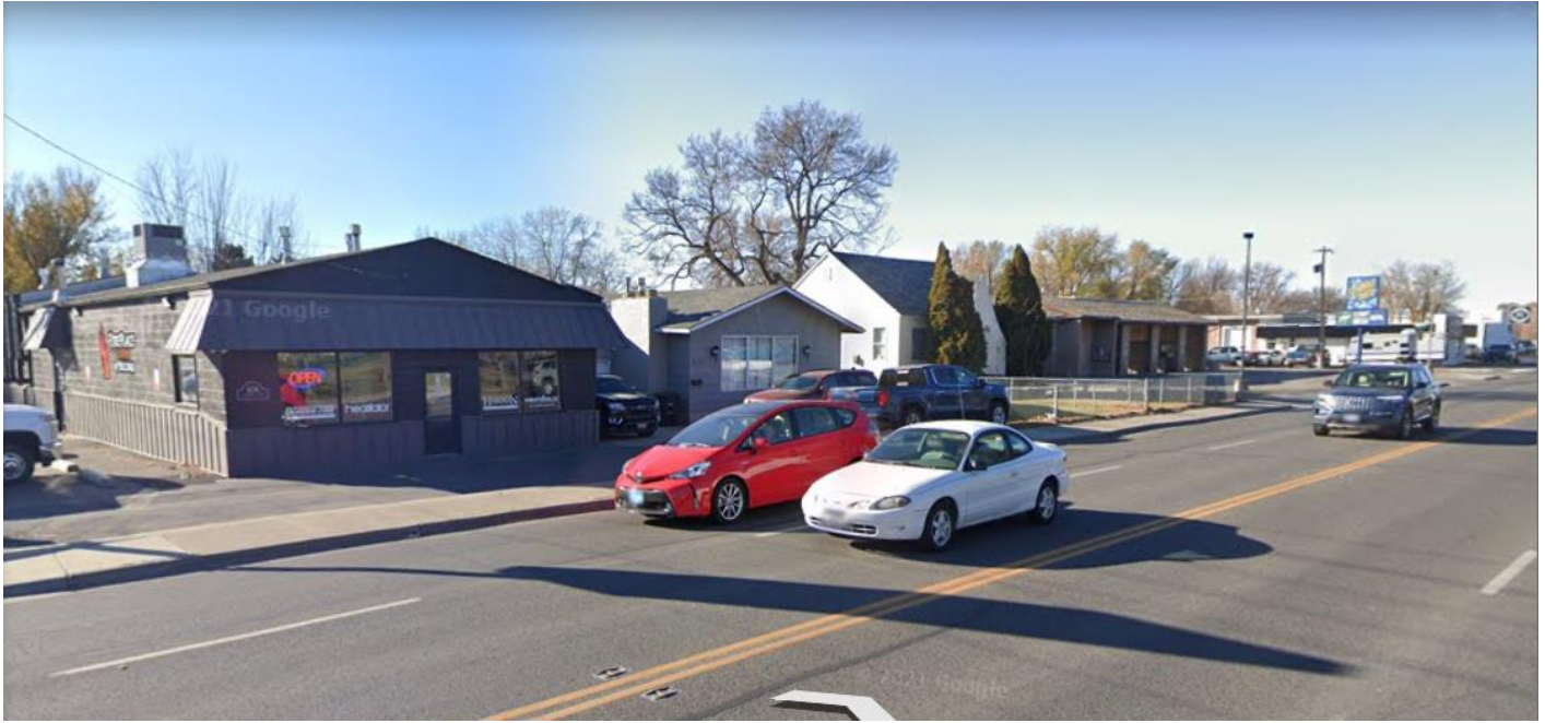
Subject of photo: Commercial & residential properties along 8 th Street W, Billings, MT 59101 Property across the street to the south of the subject property

Photocopy this page for additional photos