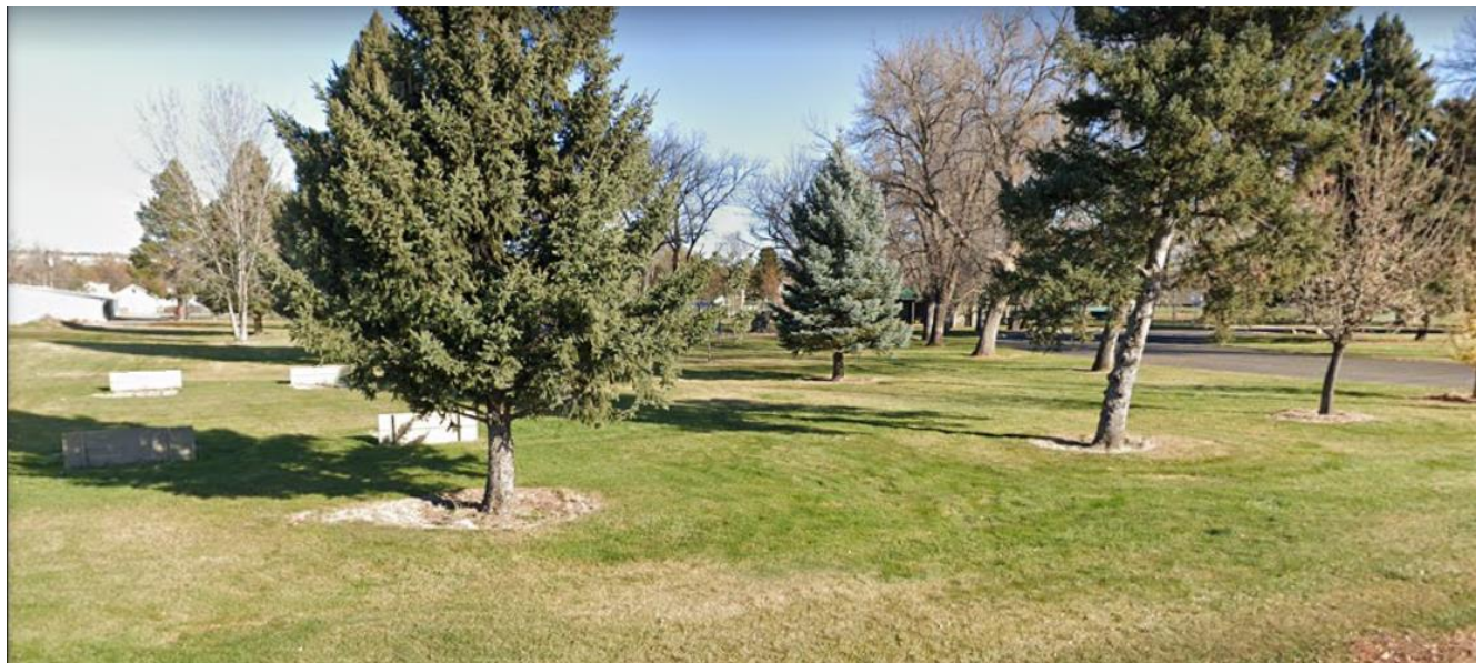
Subject of photo: Central Park, 901 Central Ave., Billings, MT 59101 Photo is taken looking: North