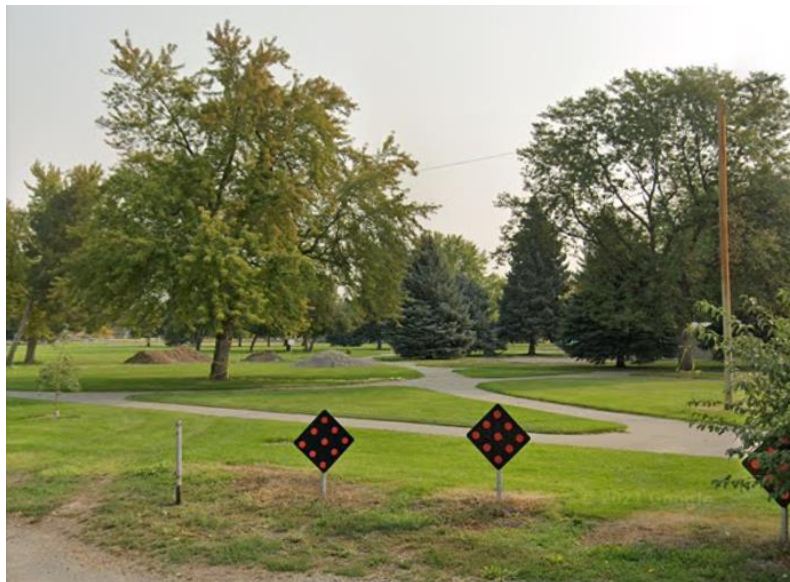
Subject of photo: Optimist Park trail system, Billings, MT 59101 Photo is taken from Ryan Ave looking: Northeast