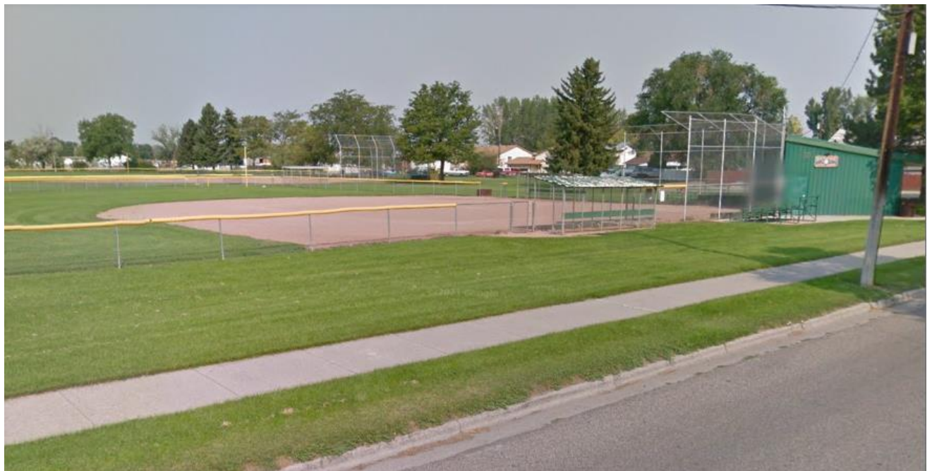
Subject of photo: Optimist Park from Hallowell Lane, Billings, MT 59101 Photo is taken looking: Northwest