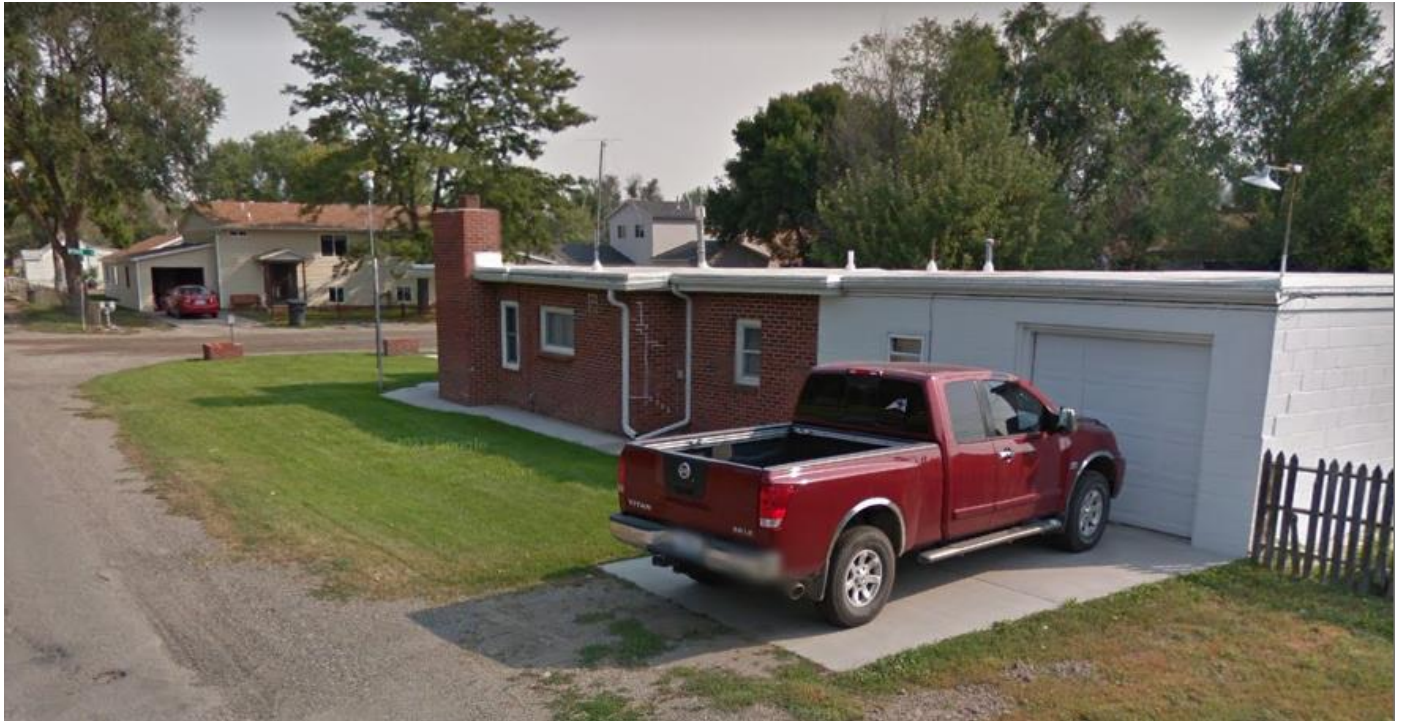
Subject of photo: Residential properties along south end of Hallowell Lane, Billings, MT 59101 Photo Taken Looking: Northeast

Photocopy this page for additional photos