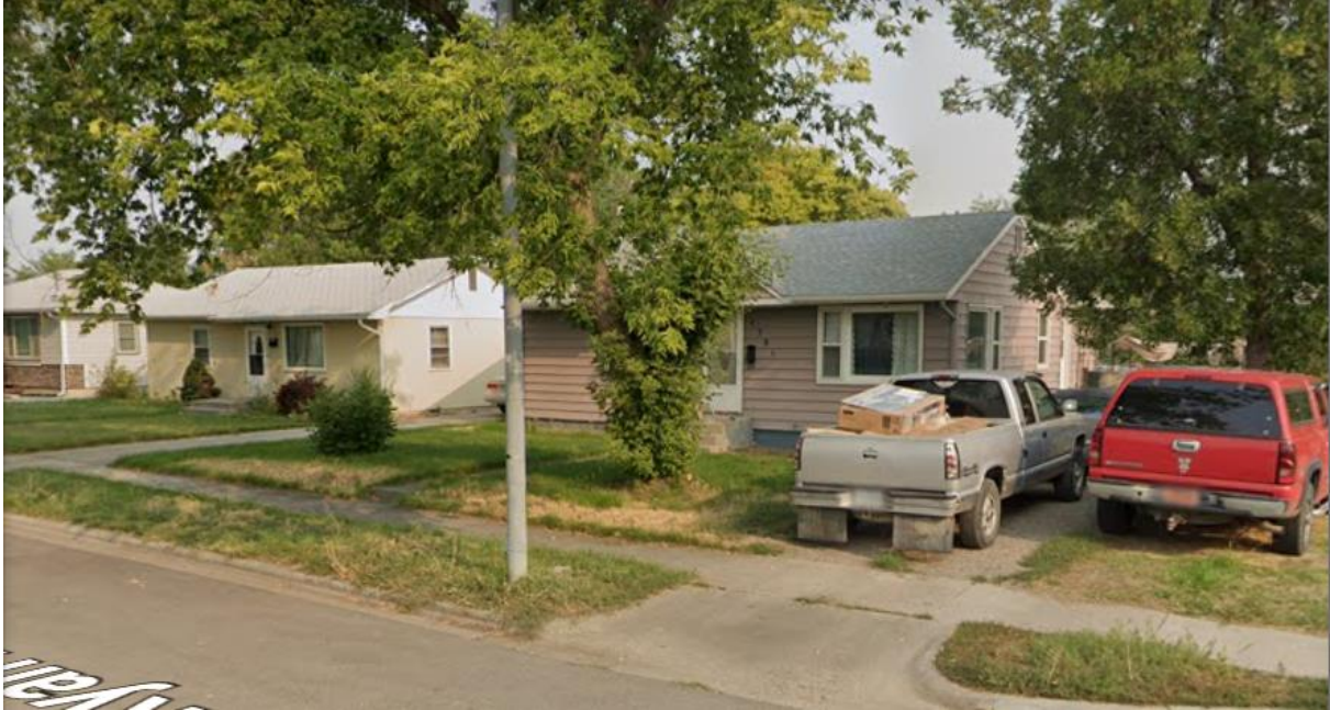
Subject of photo: Residential properties along at the east end of Ryan Ave, Billings, MT 59101

Photocopy this page for additional photos