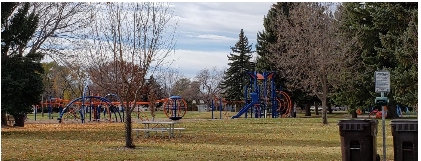
Subject of photo: Optimist Park from Hallowell Lane, Billings, MT 59101 Photo is taken looking: West