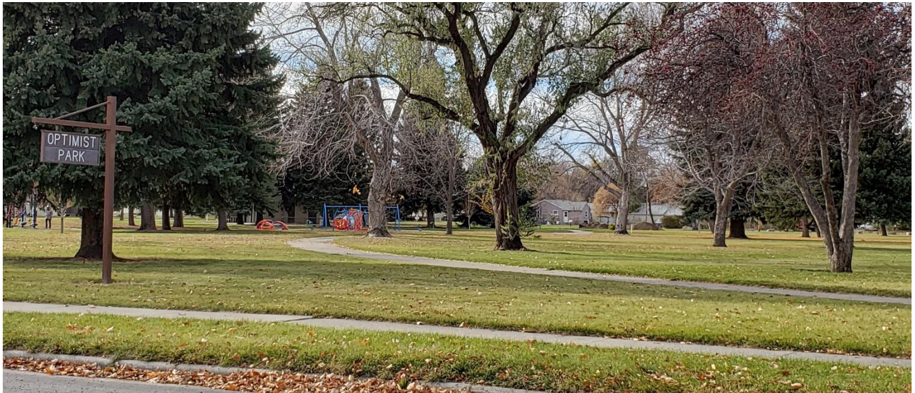
Subject of photo: Optimist Park from Hallowell Lane, Billings, MT 59101 Photo is taken looking: Southwest

PHOTOGRAPHS (35mm or good quality digitals of each exterior side of property, and photos of adjacent streetscape) Photocopy this page for additional photos