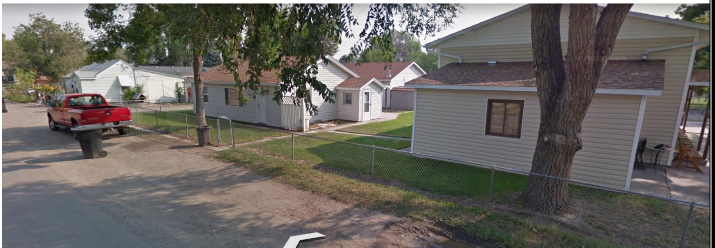
Subject of photo: Residential properties along Hallowell Lane, Billings, MT 59101 Photo Taken Looking: Northeast

Property across the street to the east of the subject property