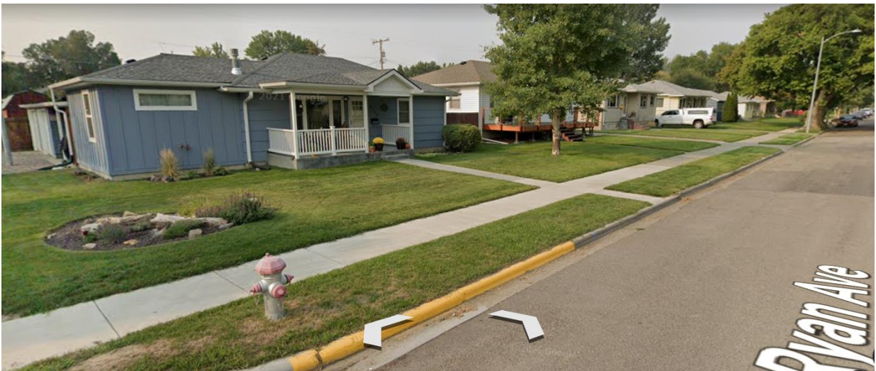
Subject of photo: Residential properties at the east end of Ryan Ave, Billings, MT 59101

Property across the street to the west of the subject property