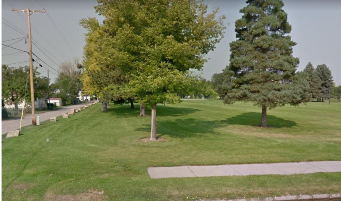
Subject of photo: Optimist Park from Hallowell Lane, Billings, MT 59101 Alley entrance lower left corner Photo is taken looking: West

Photocopy this page for additional photos