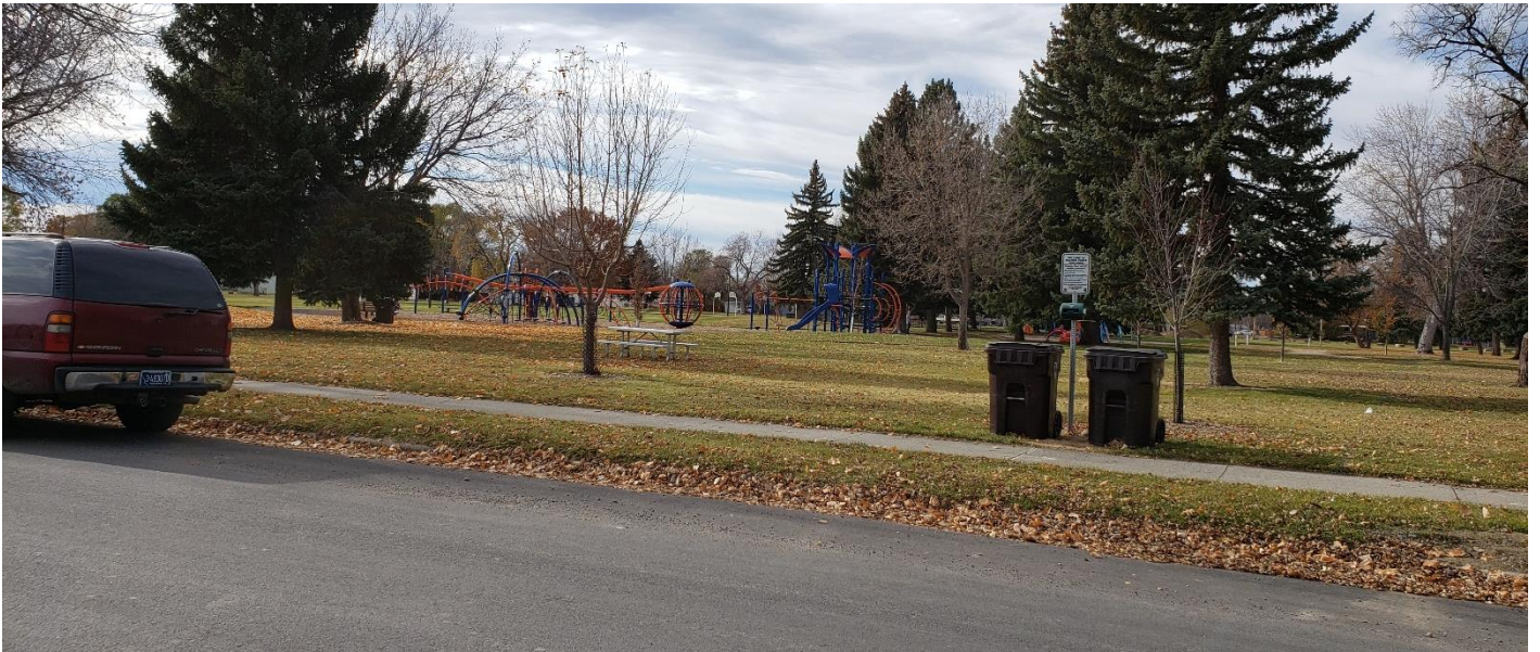
Subject of photo: Optimist Park from Hallowell Lane, Billings, MT 59101 Photo is taken looking: Southwest

PHOTOGRAPHS (35mm or good quality digitals of each exterior side of property, and photos of adjacent streetscape) Photocopy this page for additional photos