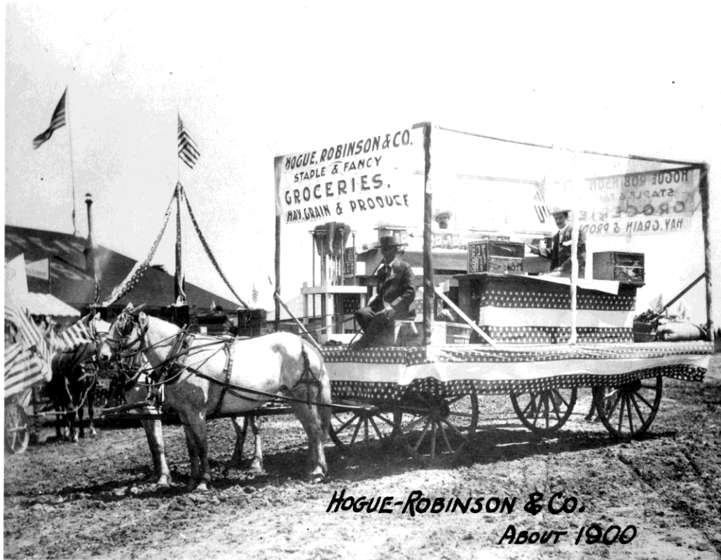
HOGUE-ROBINSON & CO. ABOUT 1900

Only historic reference found for this property, no photos.