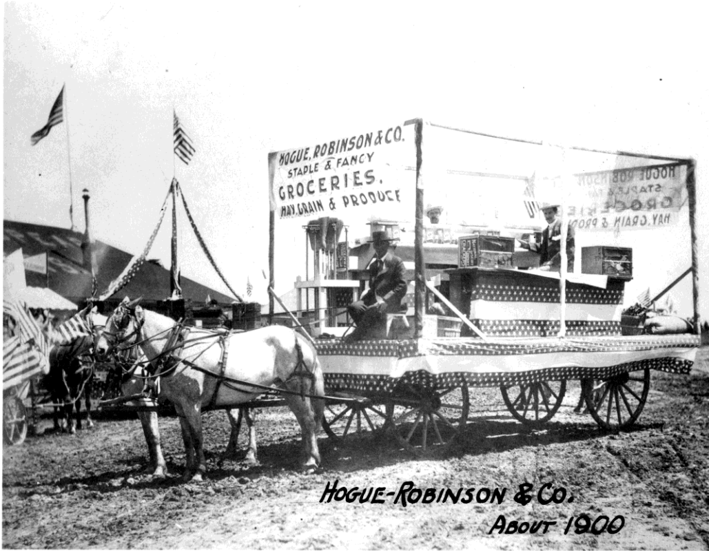
HOGUE-ROBINSON & CO. ABOUT 1900

Only historic reference found for this property, no photos.