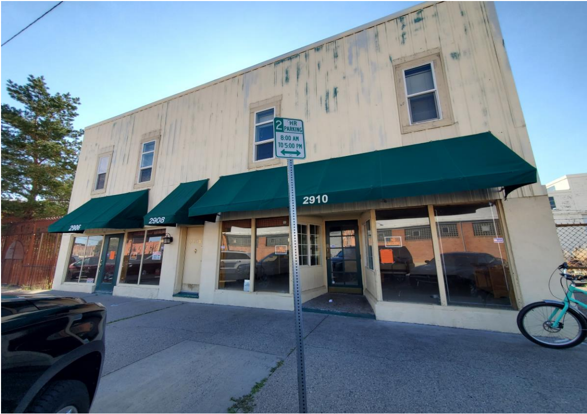
View south from Minnesota