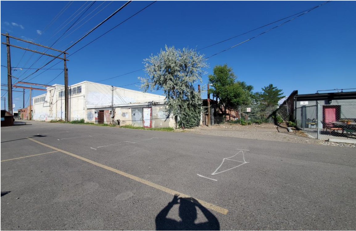
Rear of building in CLDI parking lot