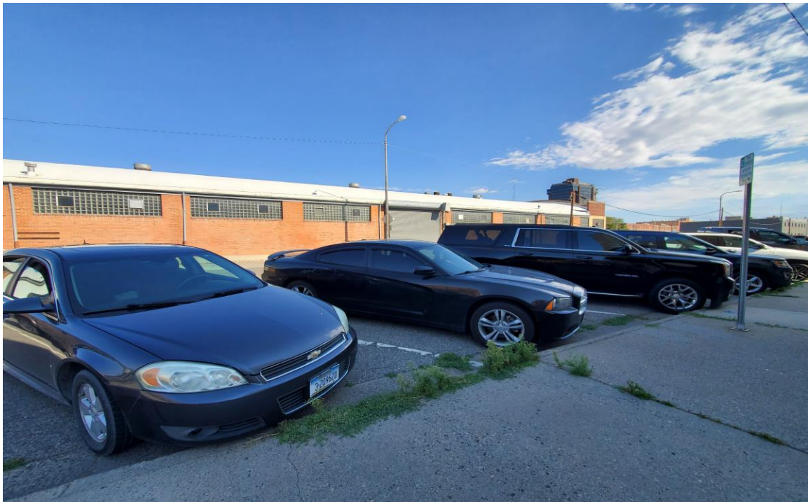
View north across Minnesota