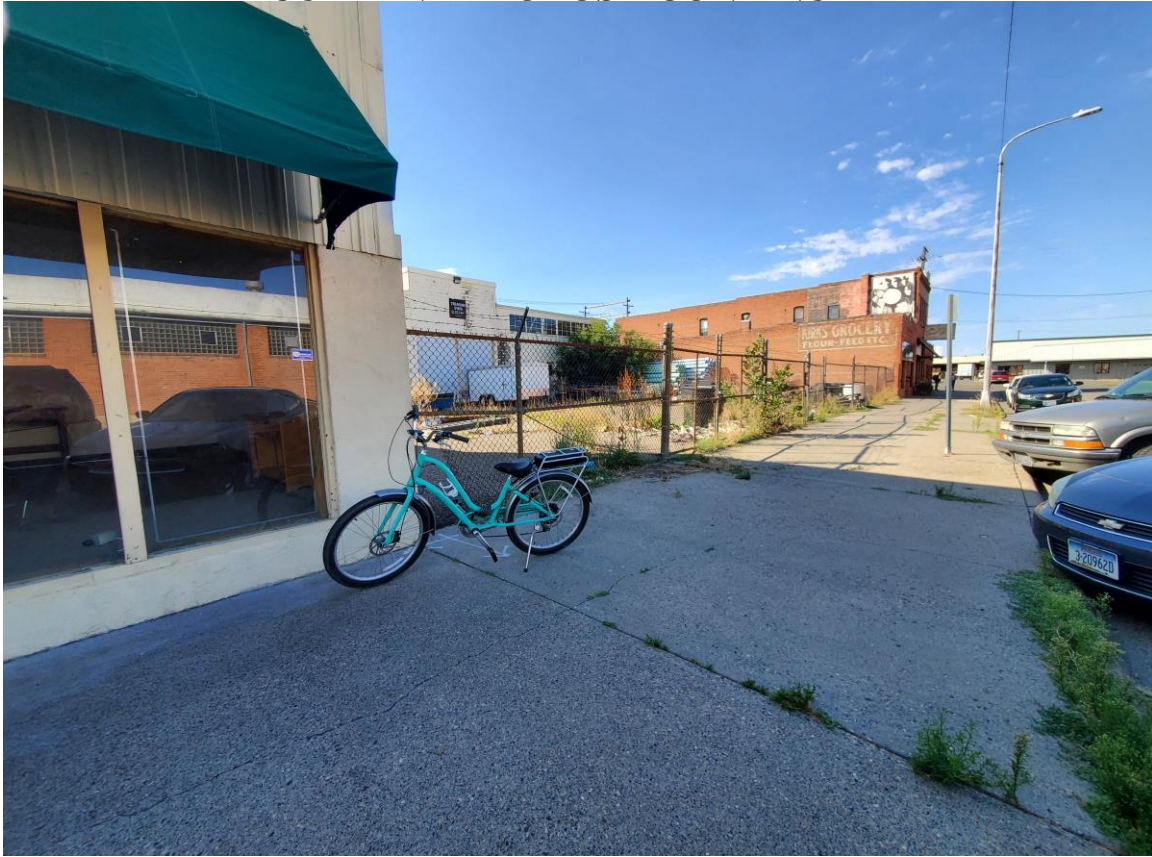
View southwest from Minnesota