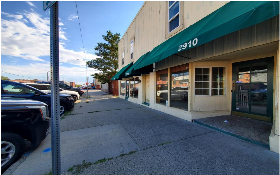
View southeast from Minnesota