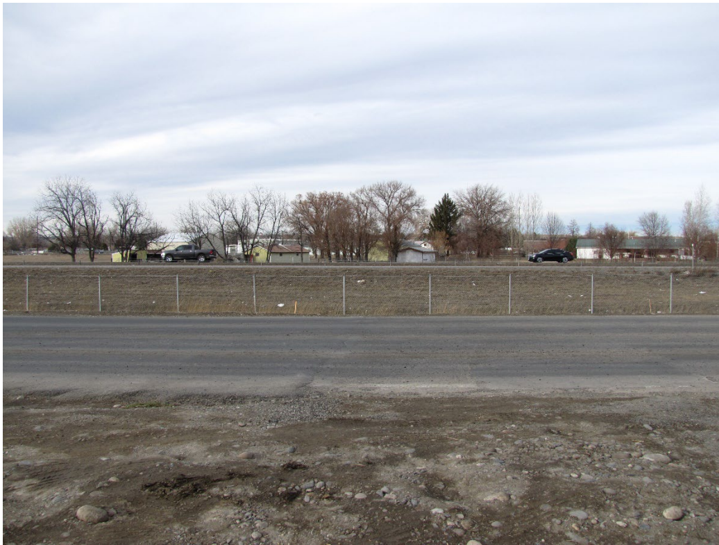
View north across S Frontage Road and I-90