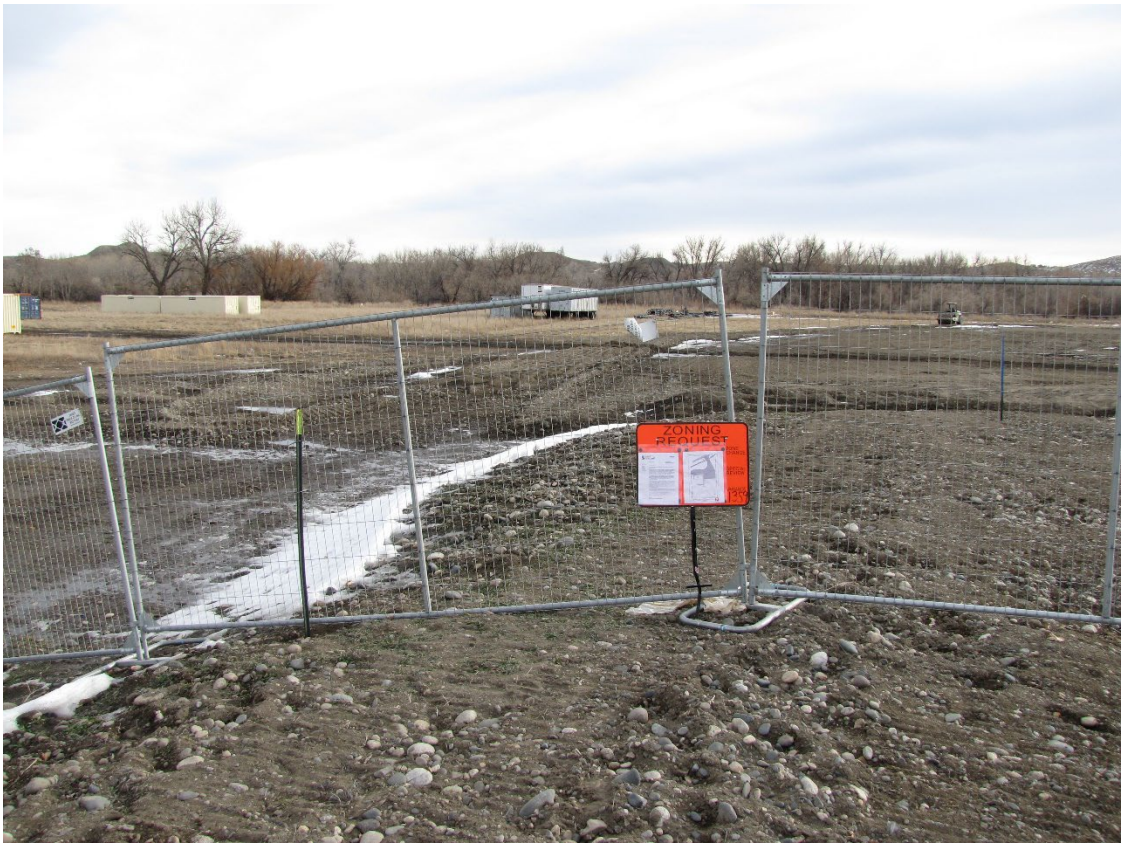
Subject Property – 3160 S Frontage Road