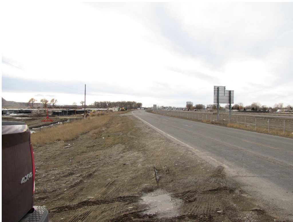
View south and west along S Frontage Road