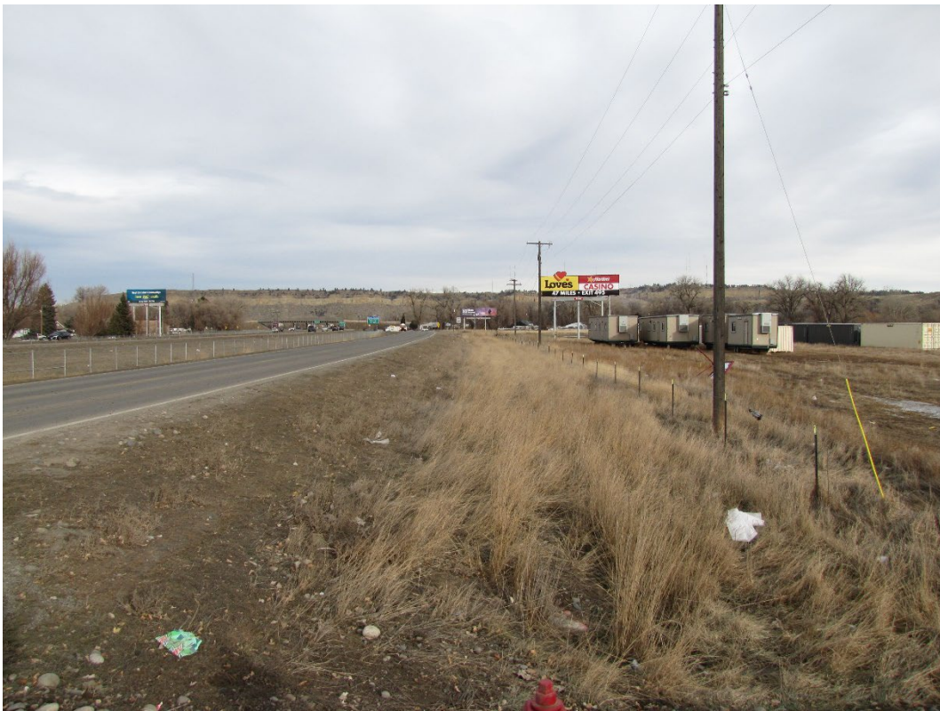
North and east along S Frontage Road