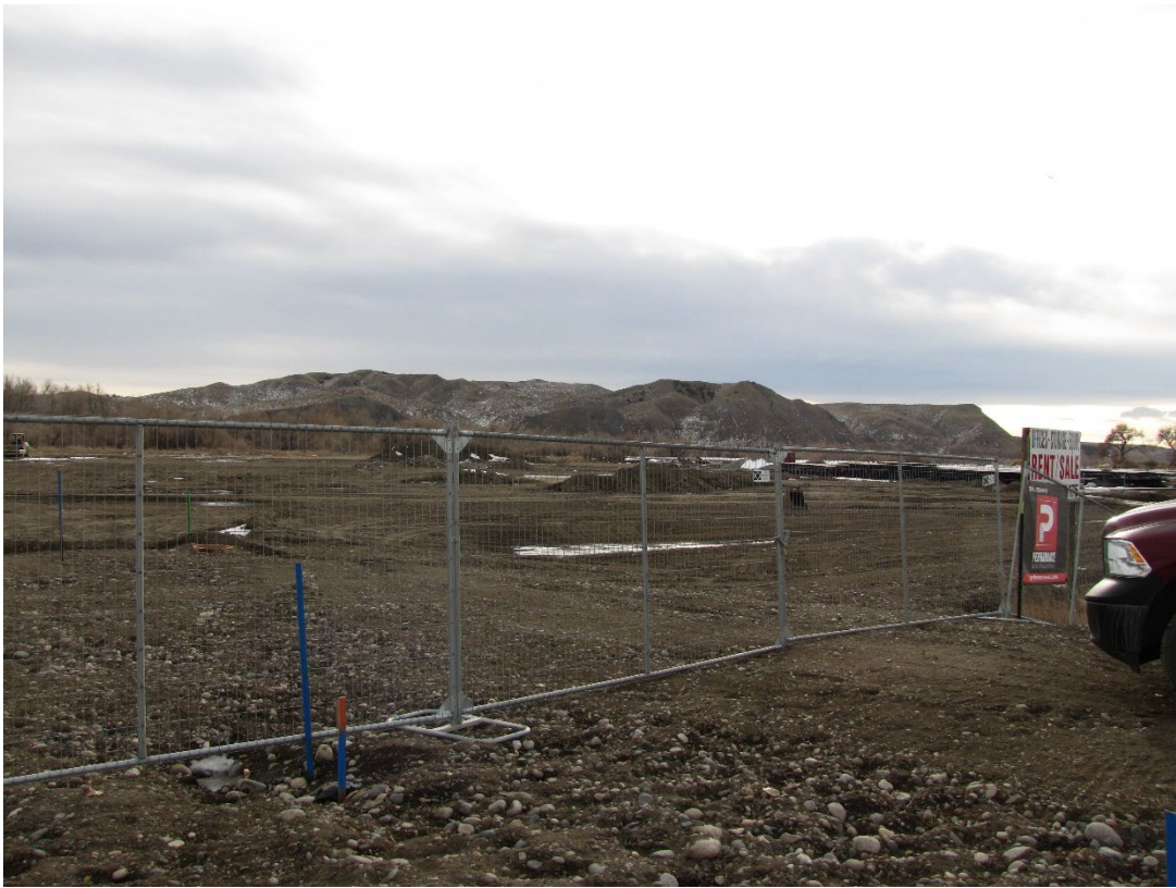
View southwest across subject property