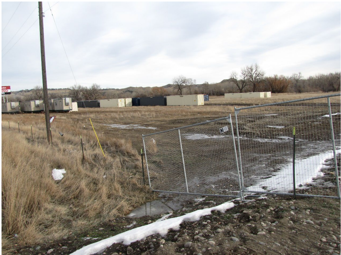
View southeast across subject property