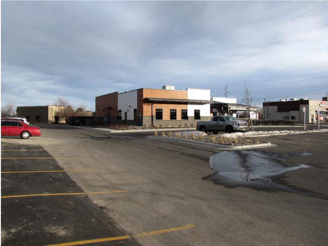
Looking south east