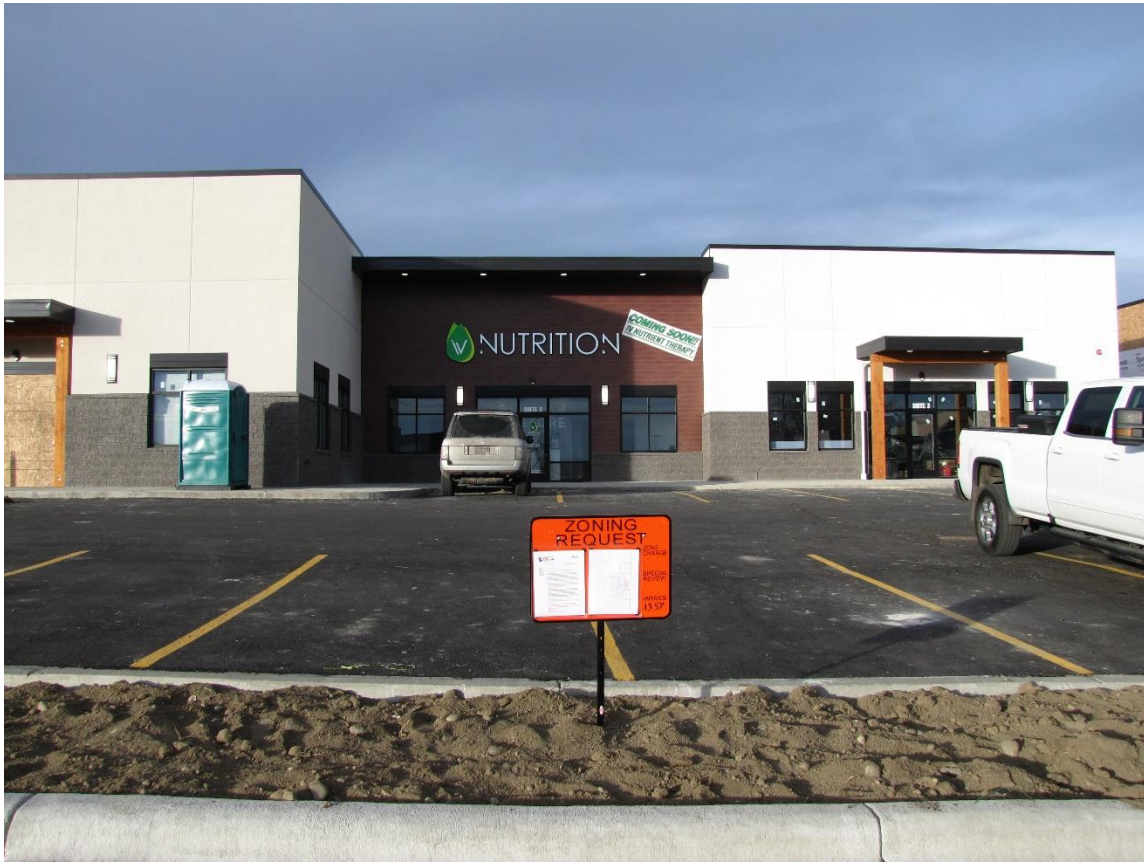
Looking North toward the subject property