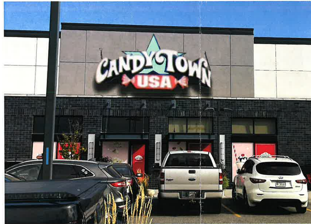
PHOTO RENDERING NEW MOUNTING LOCATION