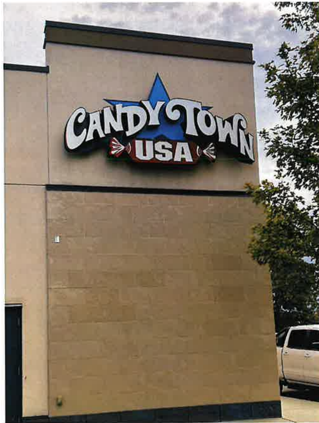
2ND EXISTING SET 6' X 12' APPROXIMATE TO BE MOUNTED INSIDE STORE - VERIFY LOCATION AND SPACE REQUIRED.