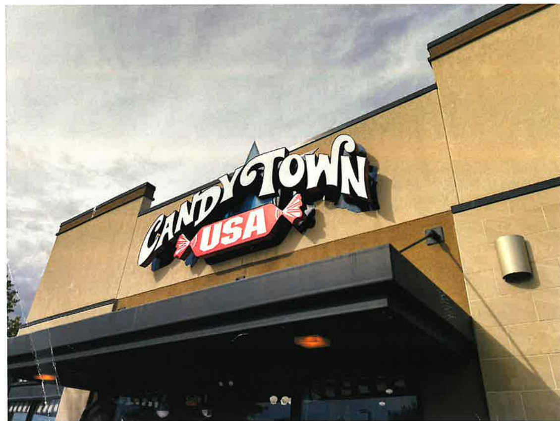
EXISTING LETTER SET