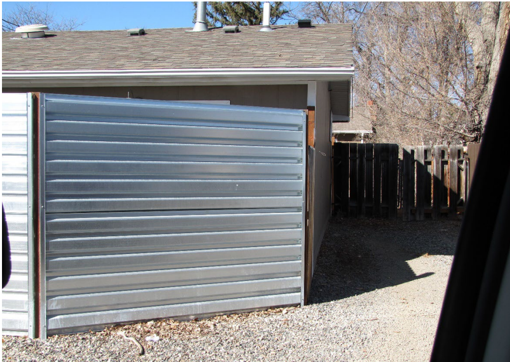
Fenced enclosure from alley