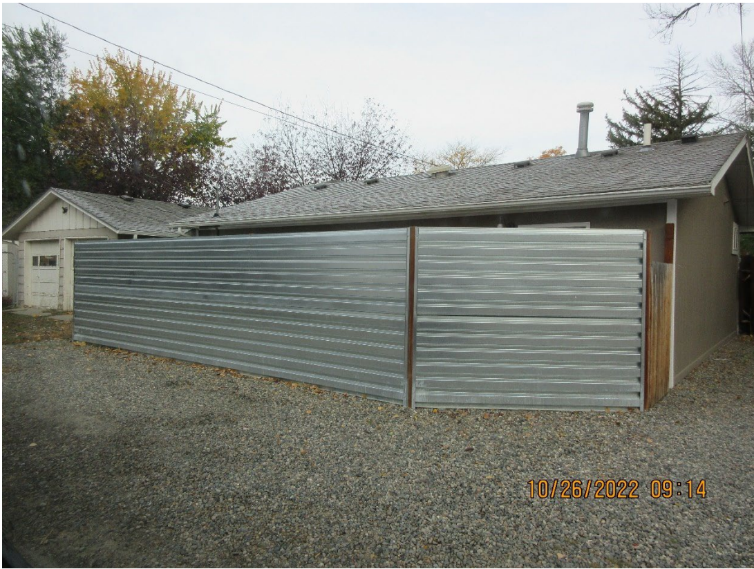
Fence at alley behind 920 Howard