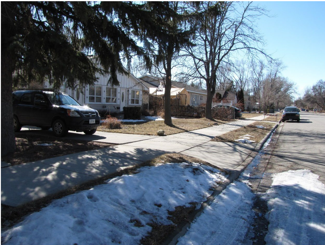
View west along Howard Avenue