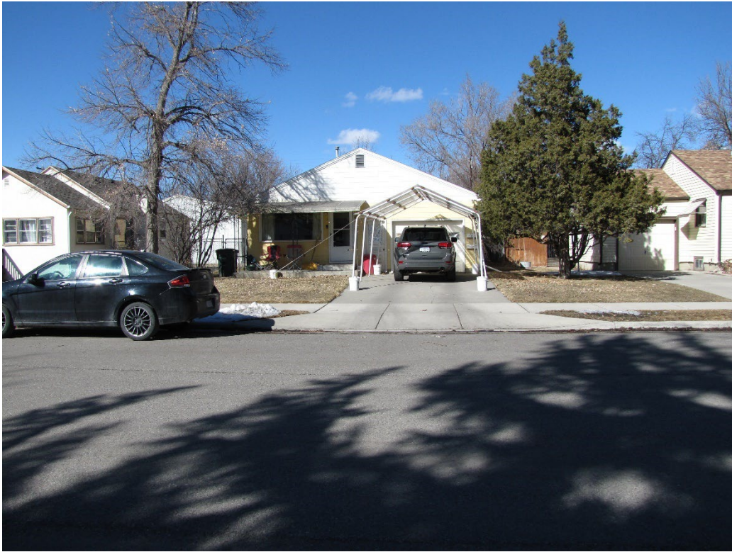
View north across Howard Avenue