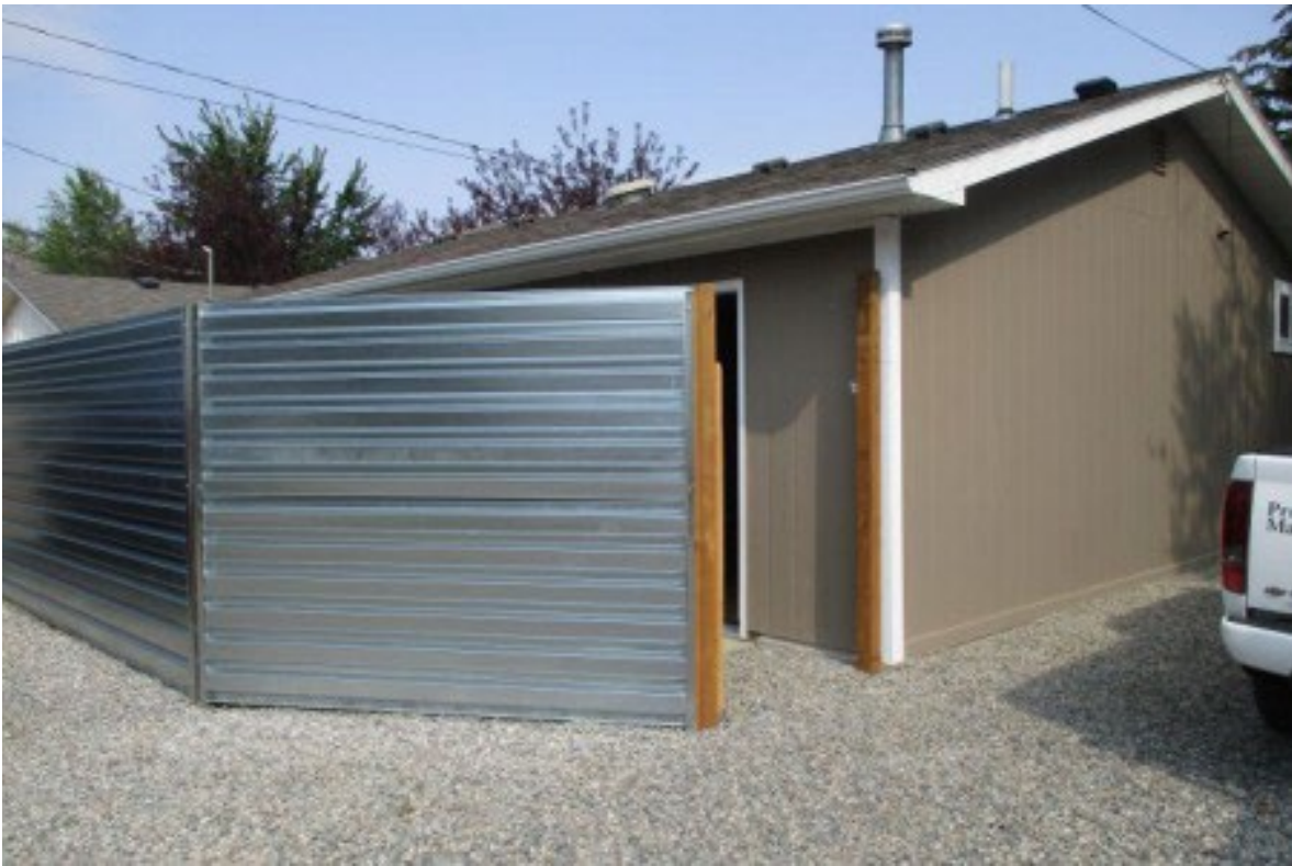
Fence under construction – applicant photos