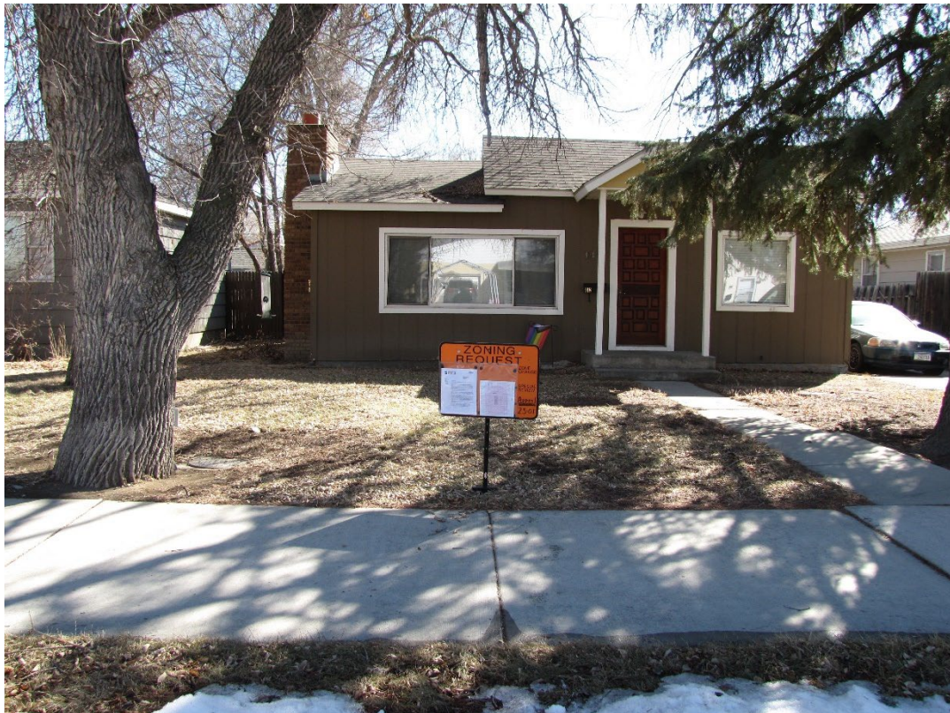
Subject property from Howard Avenue