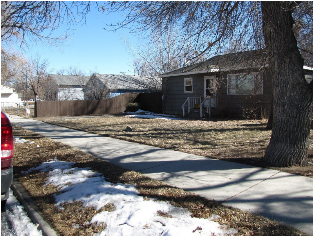
View east of subject property