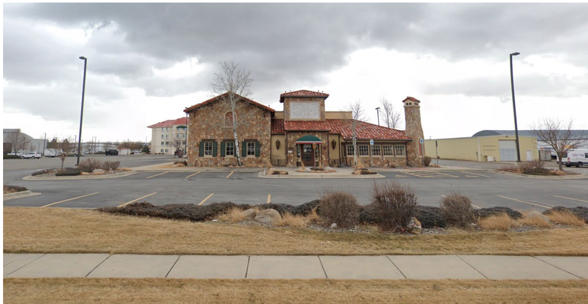
Front of existing vacant restaurant