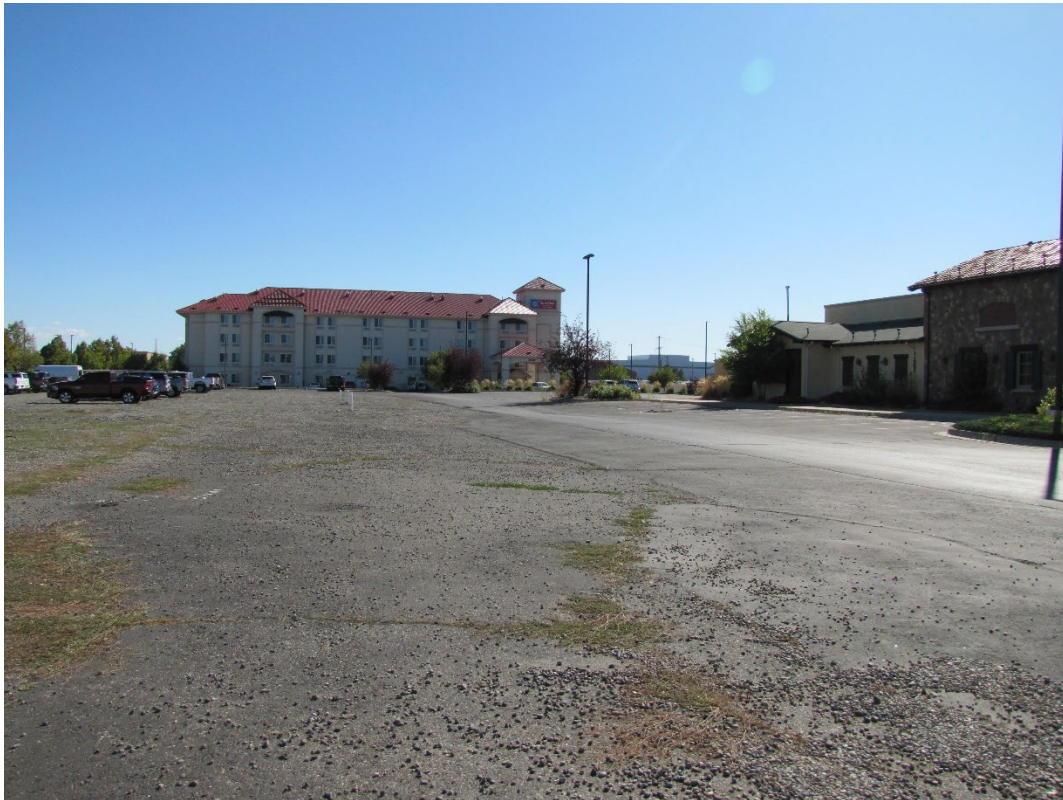
View south to the extended stay hotel