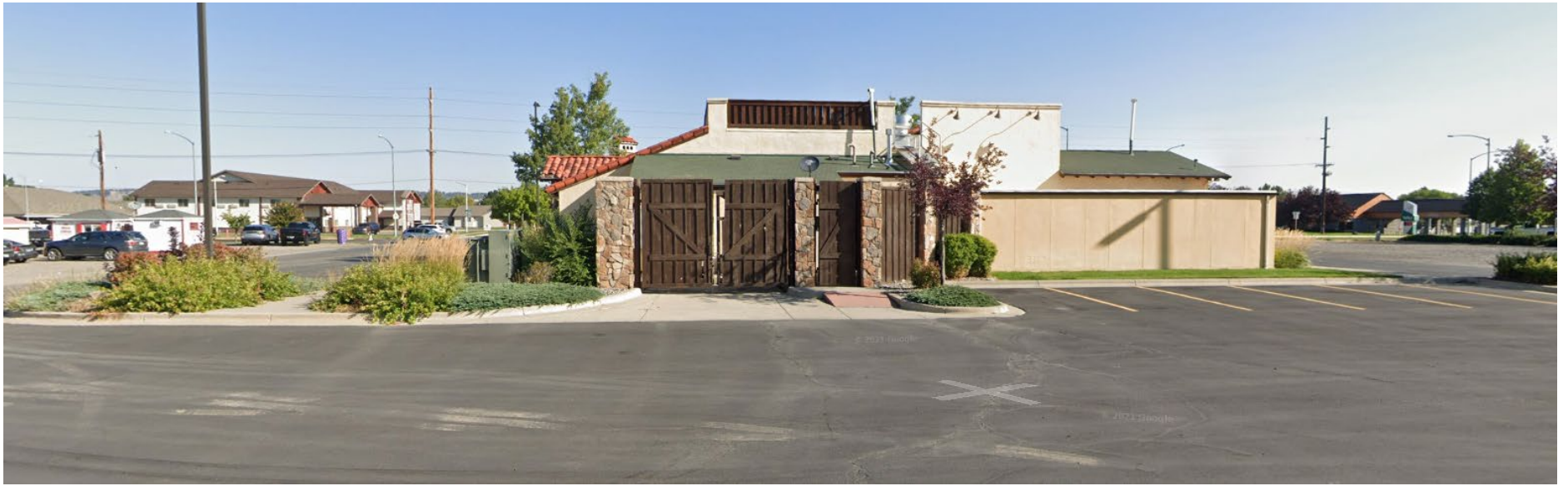
Rear of existing vacant restaurant