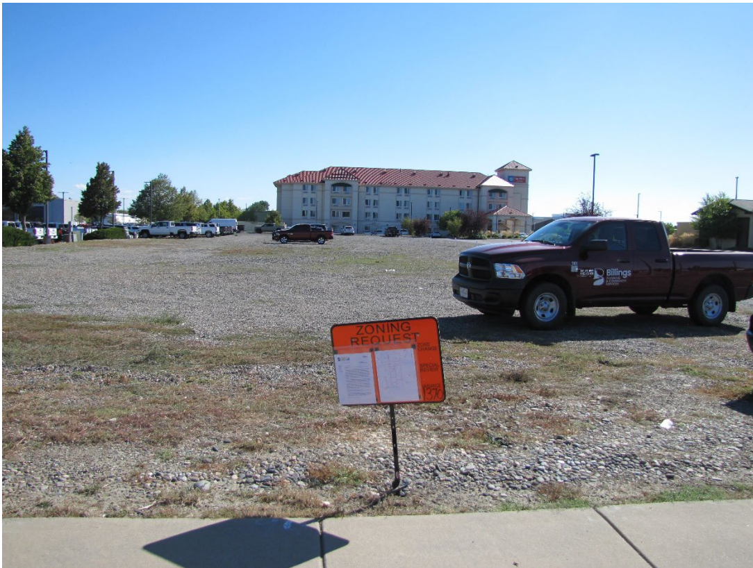
Subject Property – 3036/3042 King Ave W