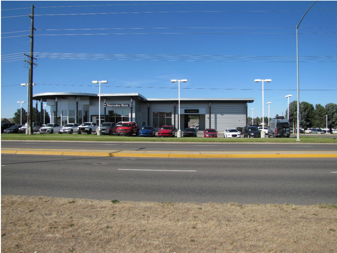
View north across King Ave W