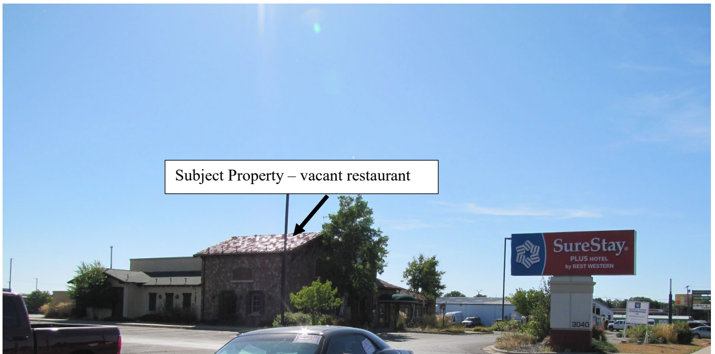
View southwest across subject property