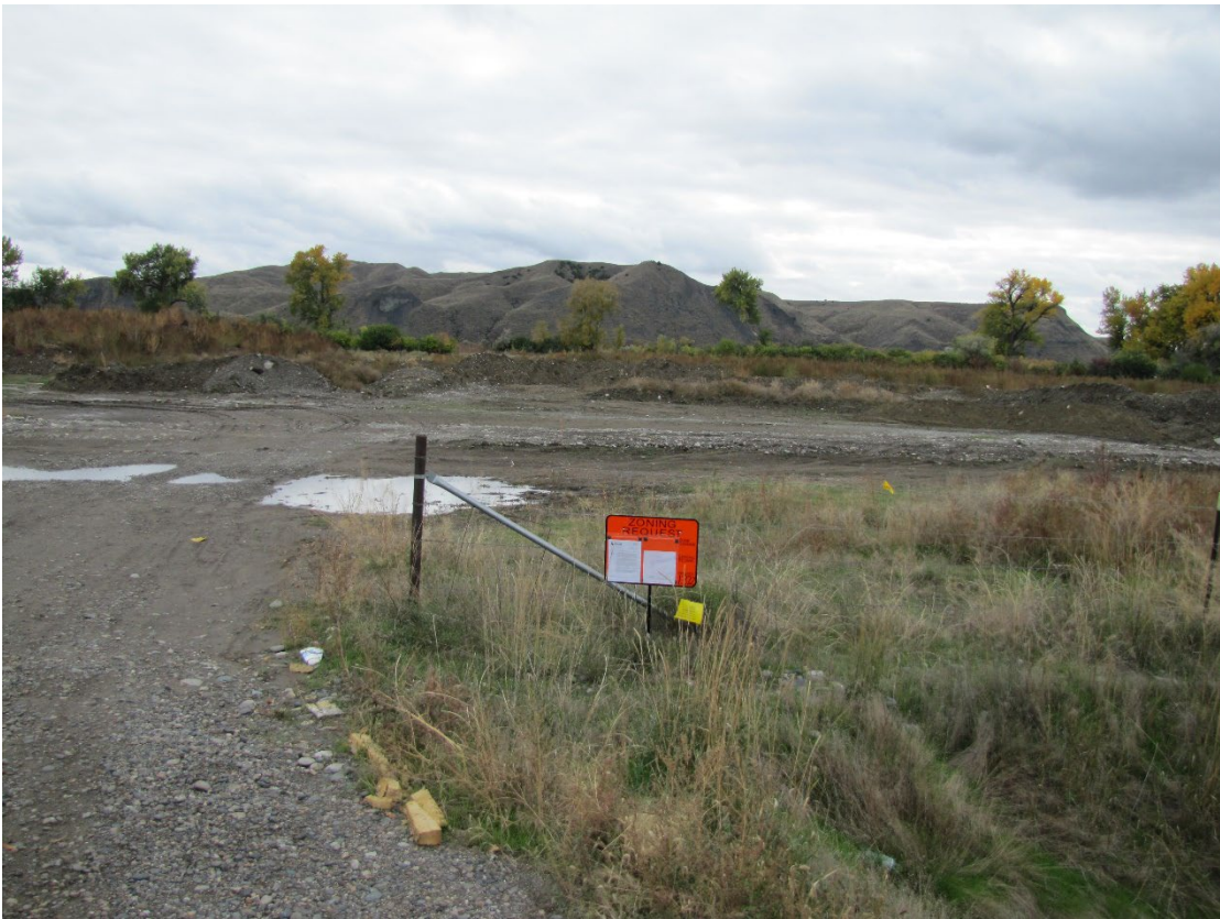
Subject Property – 3508 S Frontage Rd