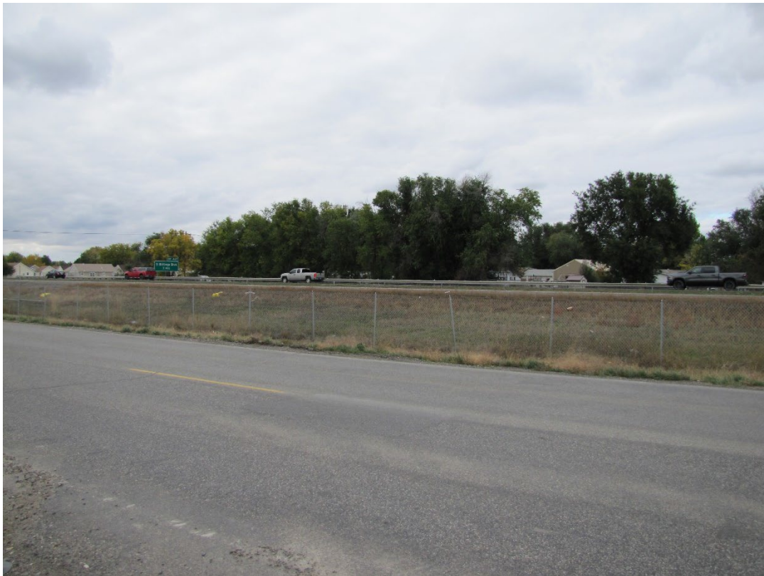
View north west across I-90