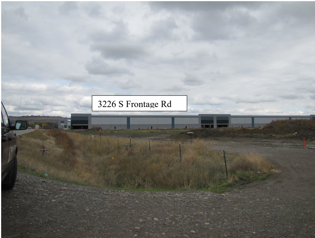
View east on S Frontage Rd