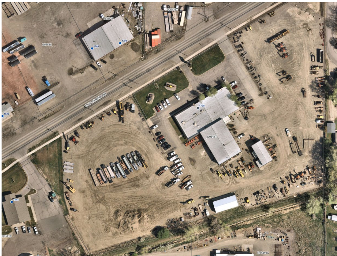
1728 Old Hardin Road