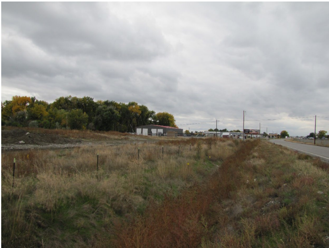
View west on S Frontage Rd