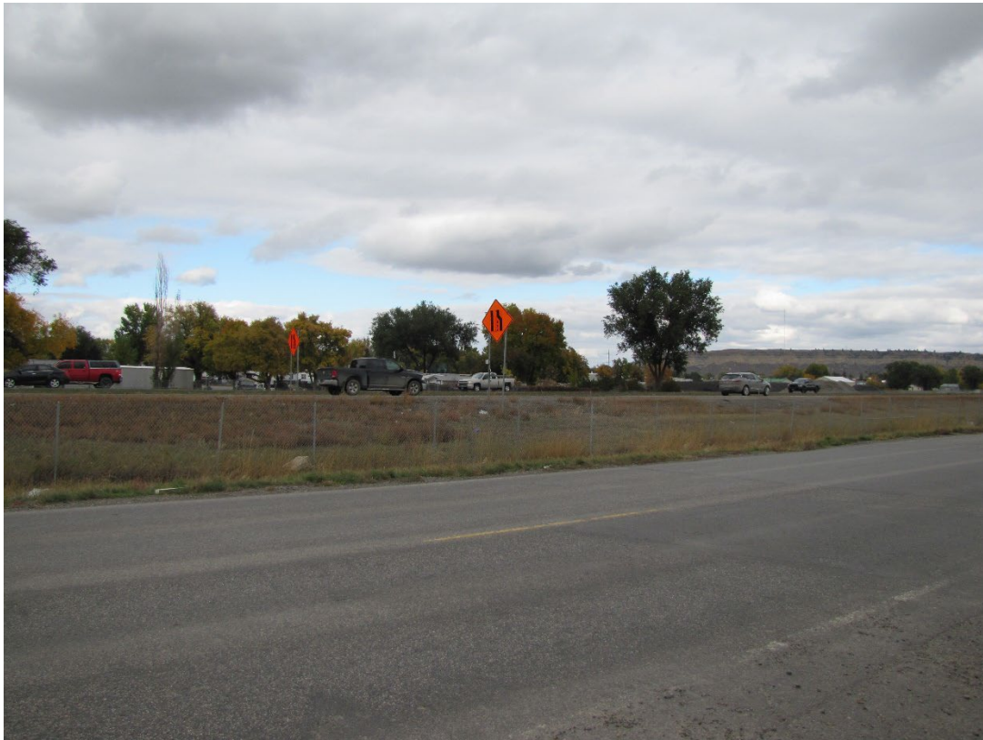
View north east across I-90