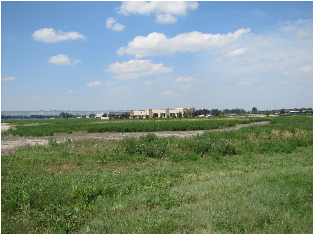
View north east to Billings Dialysis Clinic