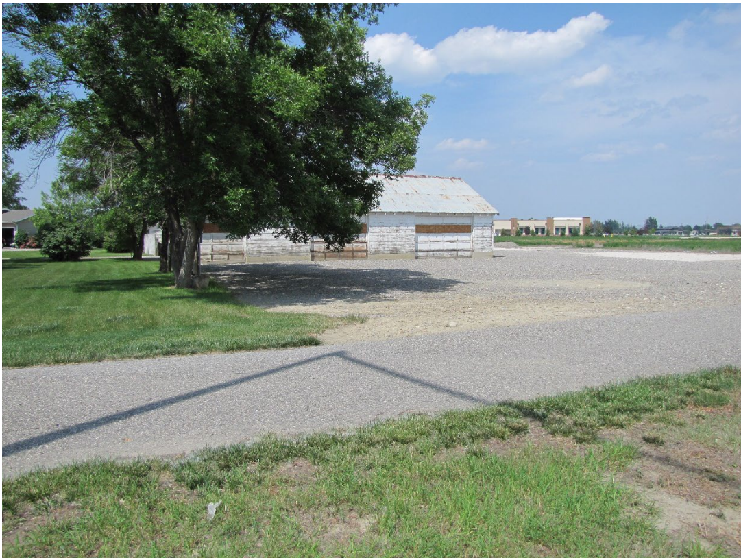
View north east – agricultural buildings on subject property