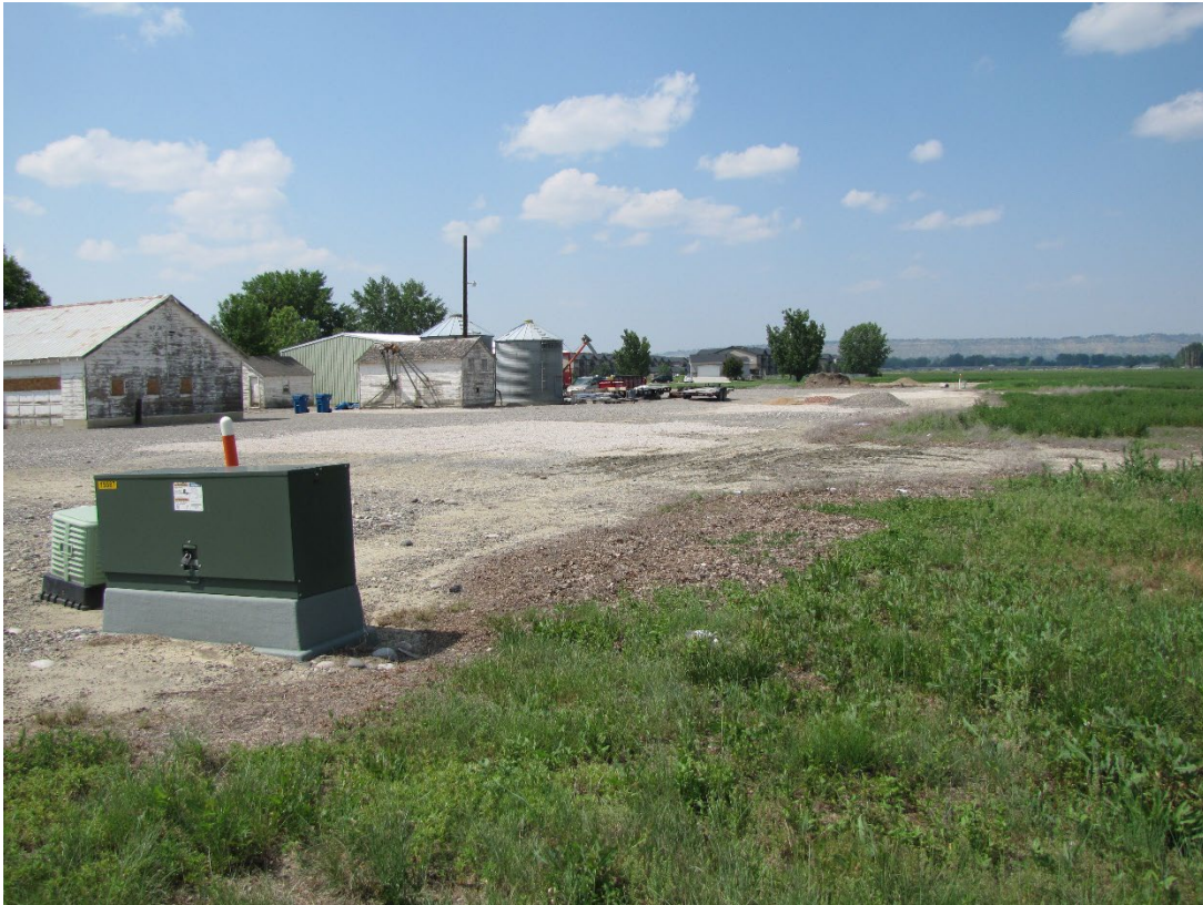
View north west – agricultural operations on subject property