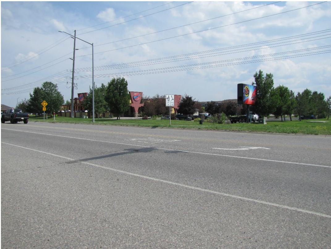
View south east across King Ave W