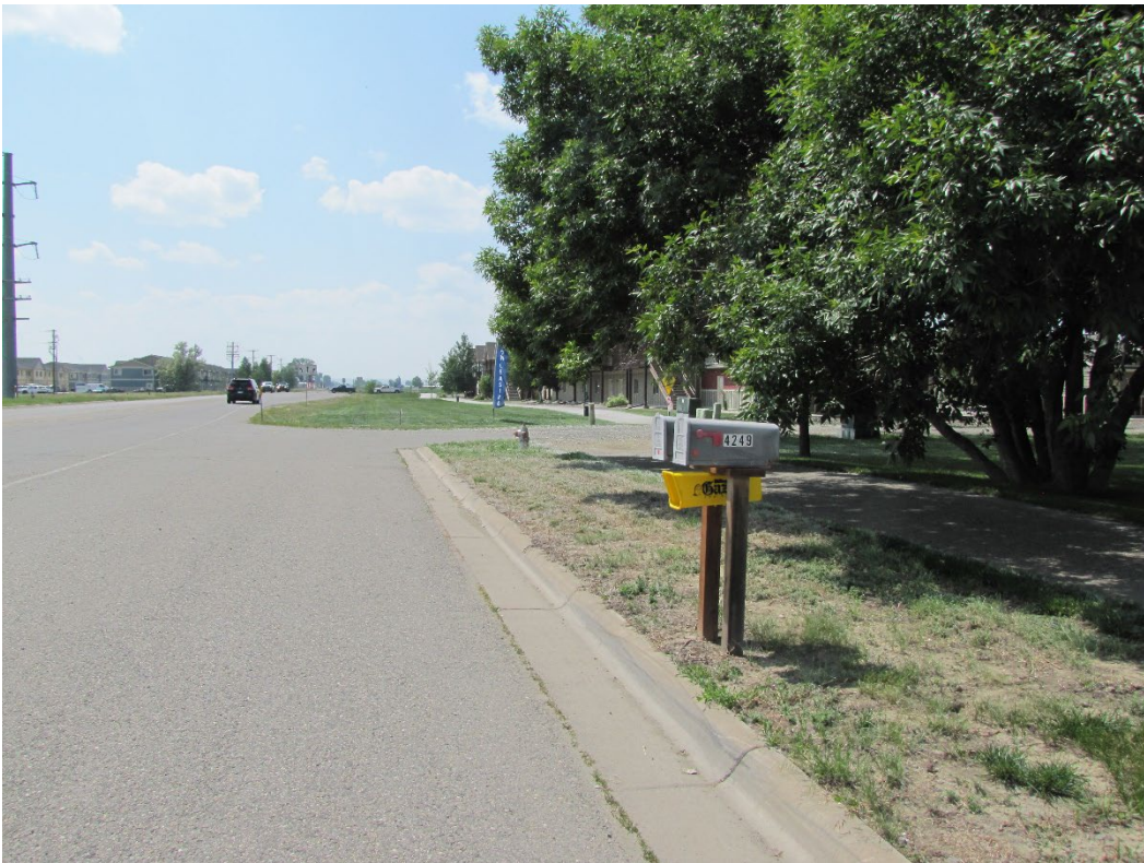
View west on King Ave W