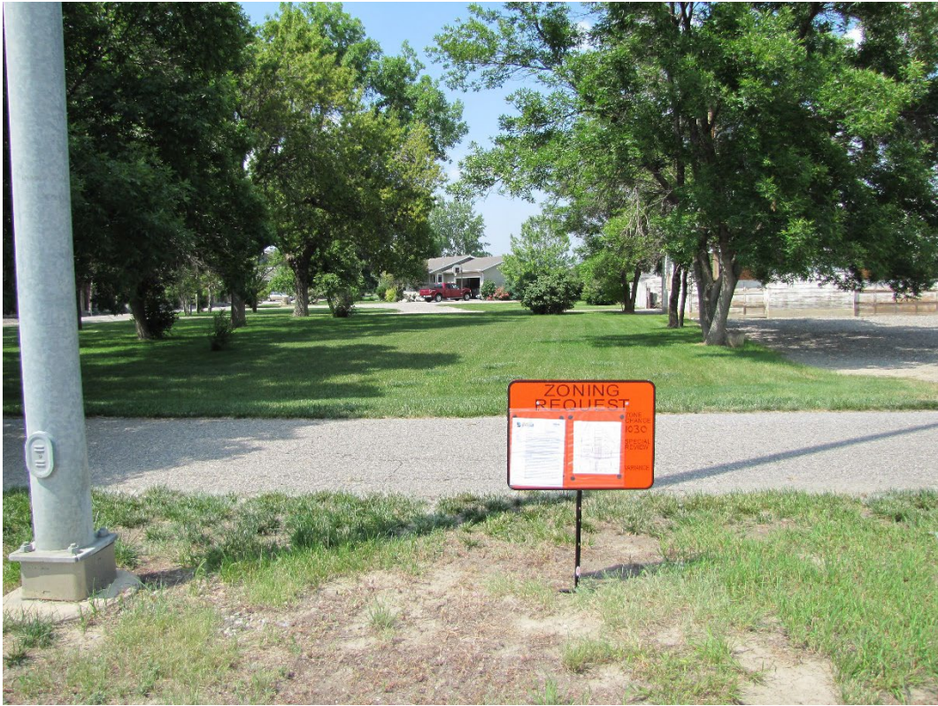
Subject Property view from King Ave West