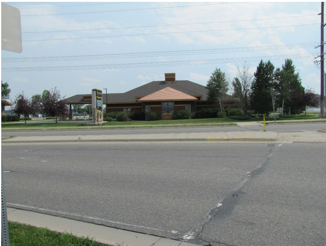
View south across King Ave W to Montana Sapphire