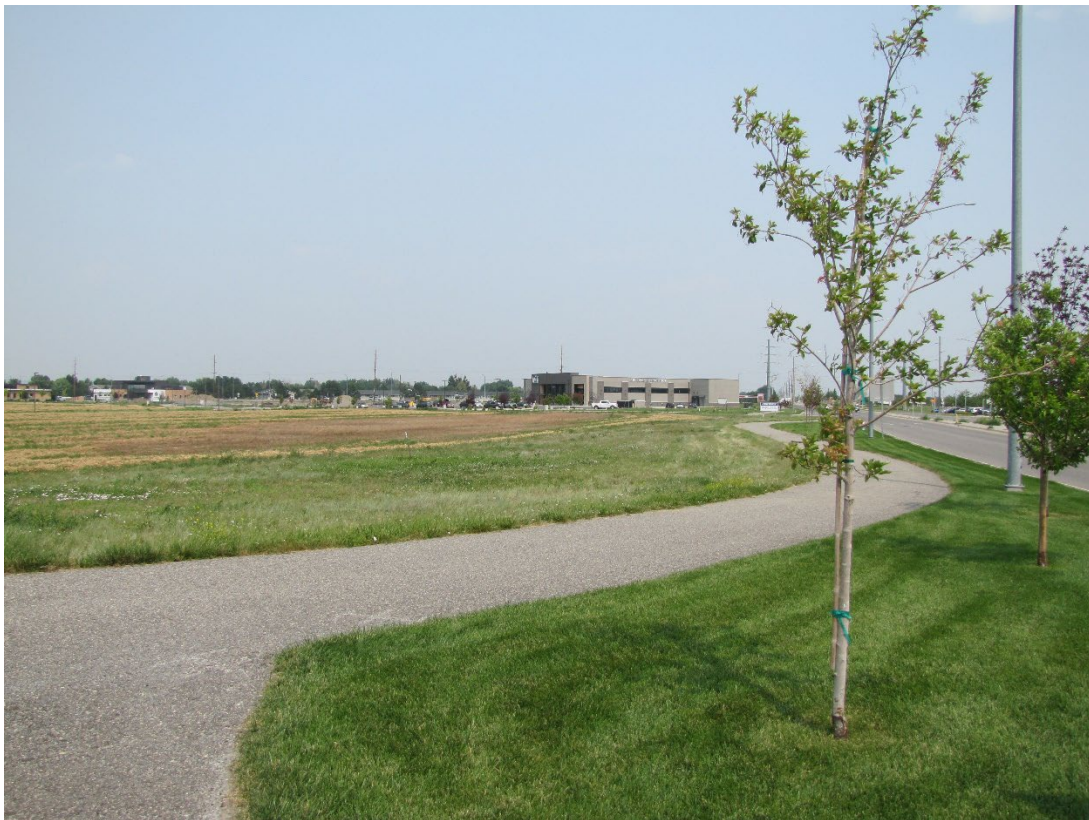
View east on King Ave W