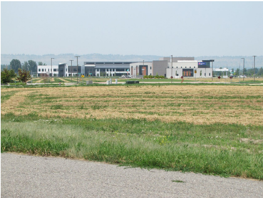
View north to Rocky Vista University and new medical services