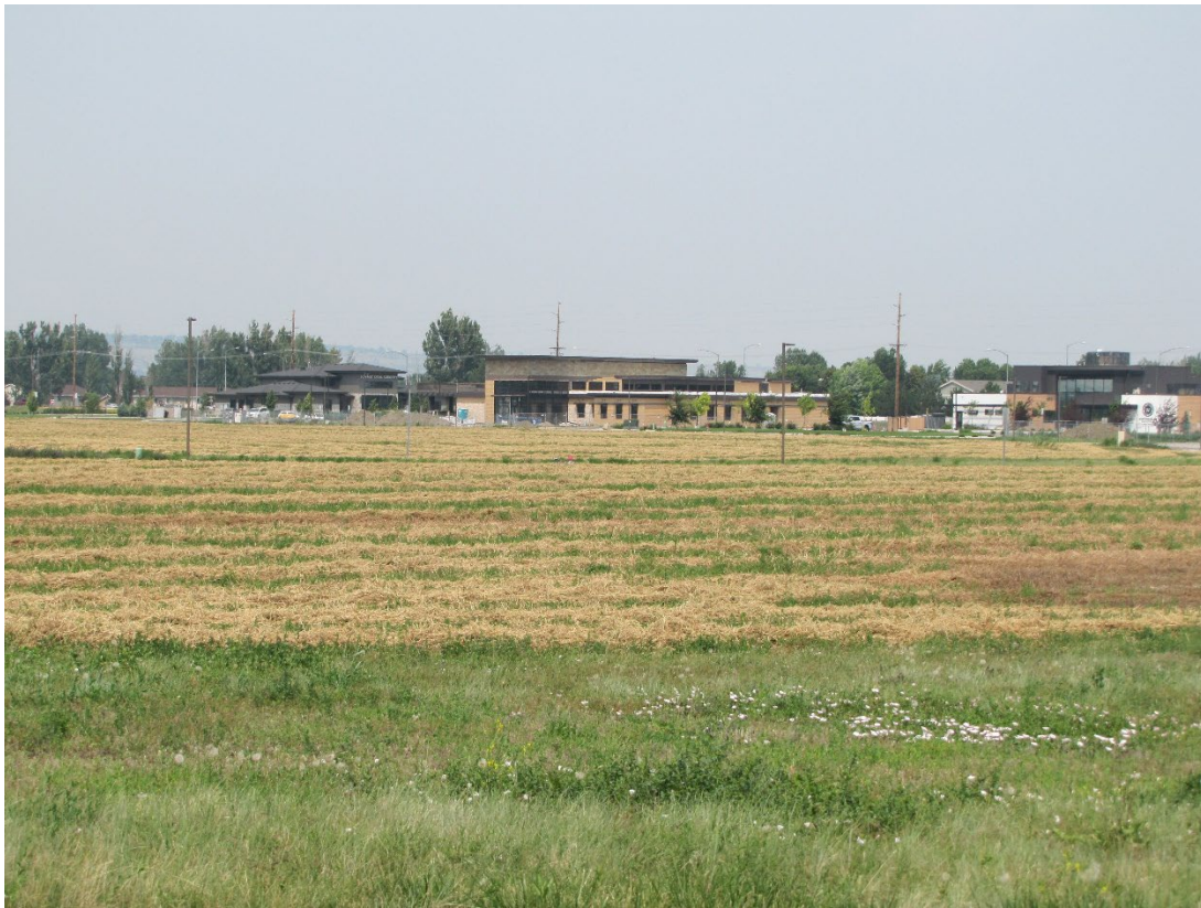
View north east to medical services in St Vincent Healthcare with frontage on Shiloh Rd