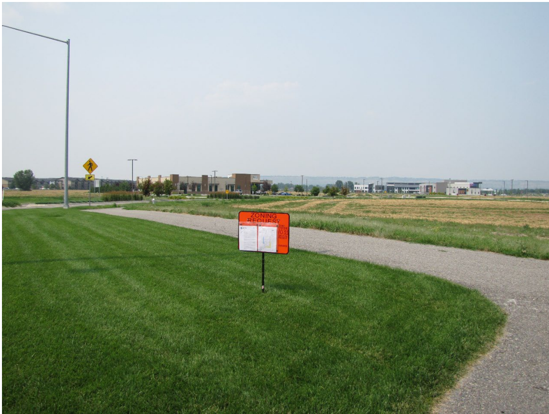
Subject Property view from King Ave West – north and east