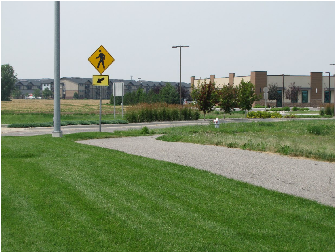
View north west – Billings Dialysis Clinic and Interpointe Apts