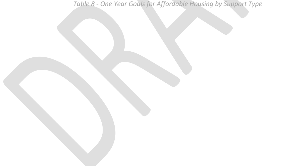
Table 8 - One Year Goals for Affordable Housing by Support Type