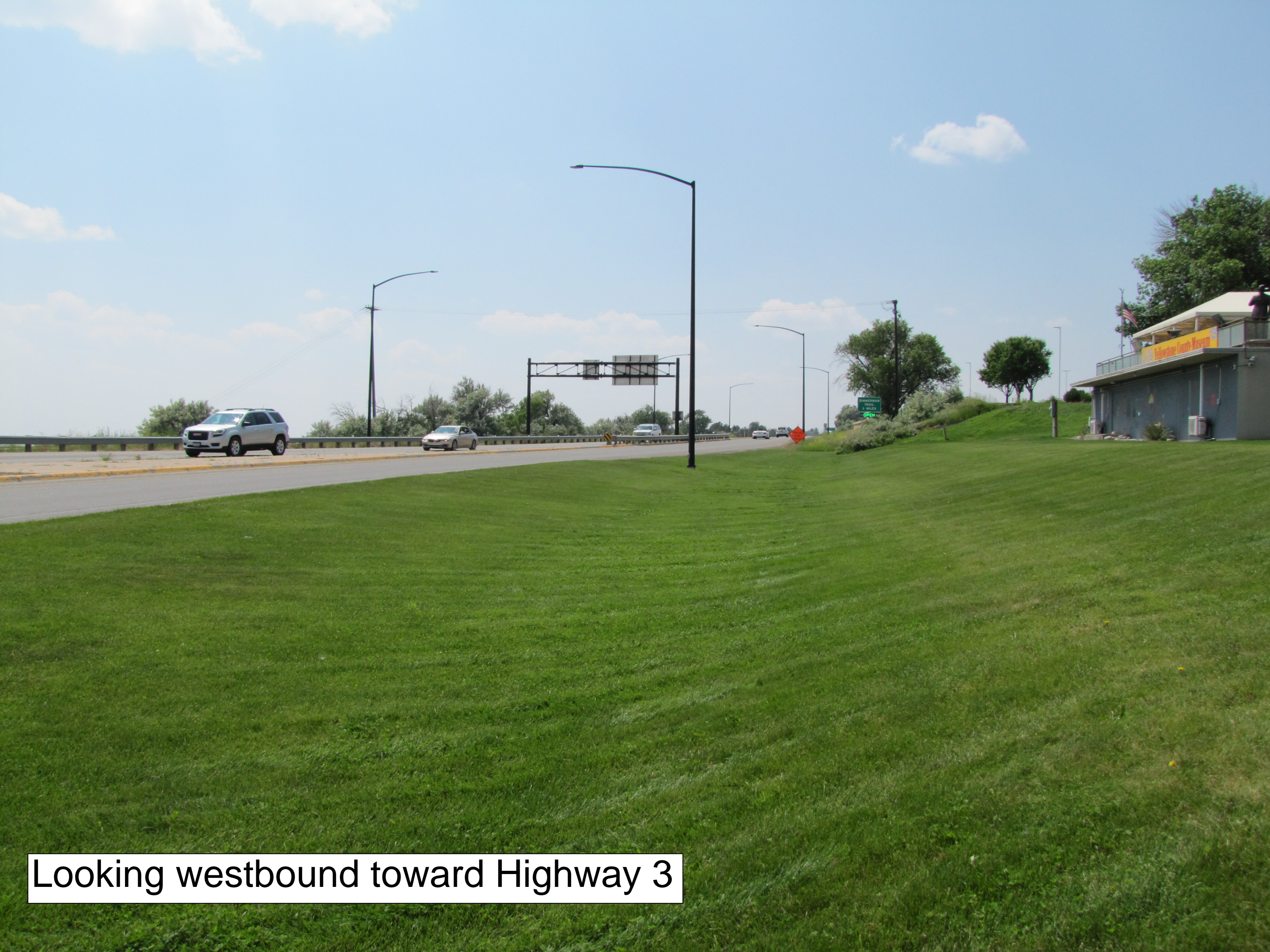
Looking westbound toward Highway 3