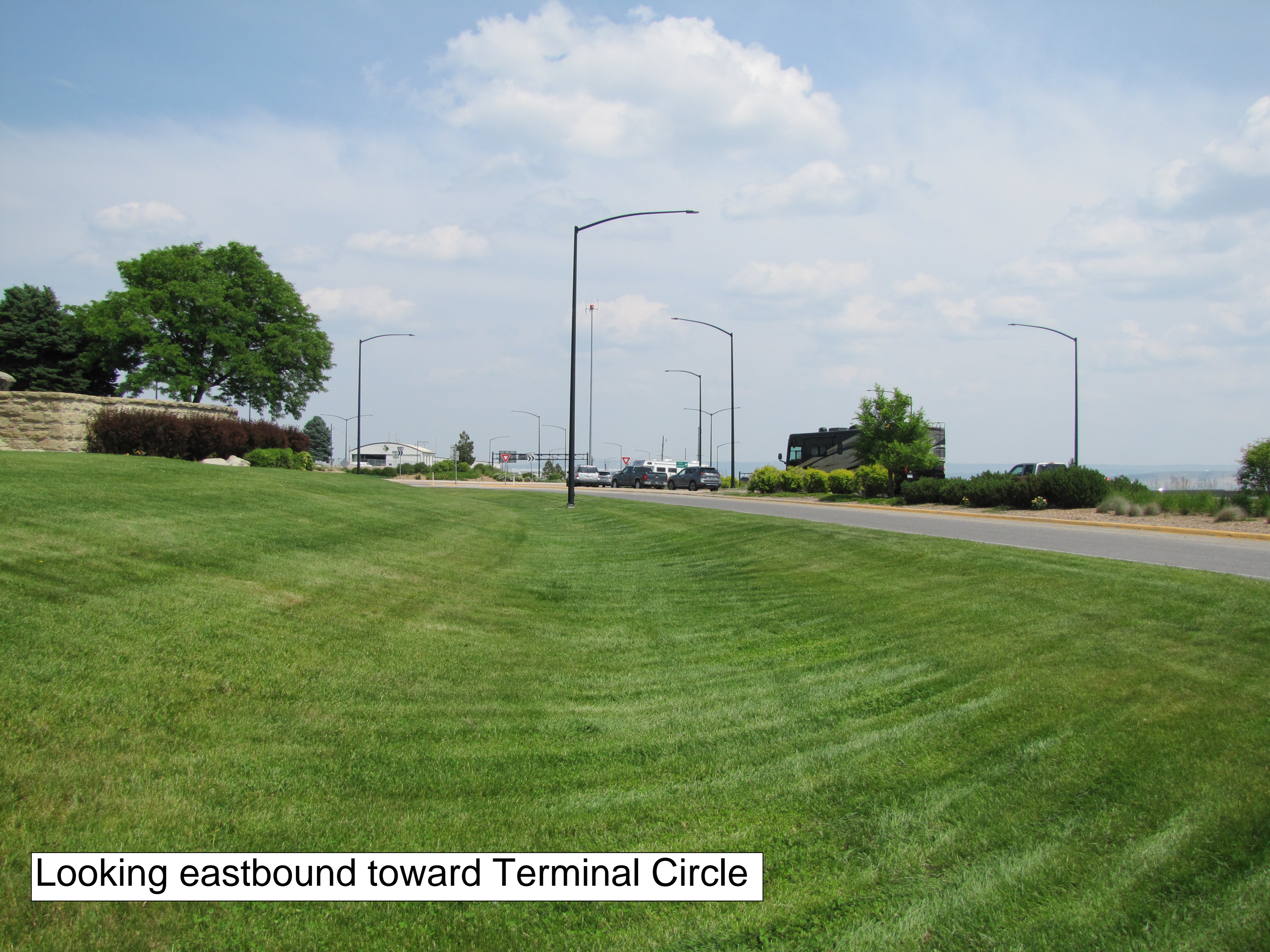
Looking eastbound toward Terminal Circle