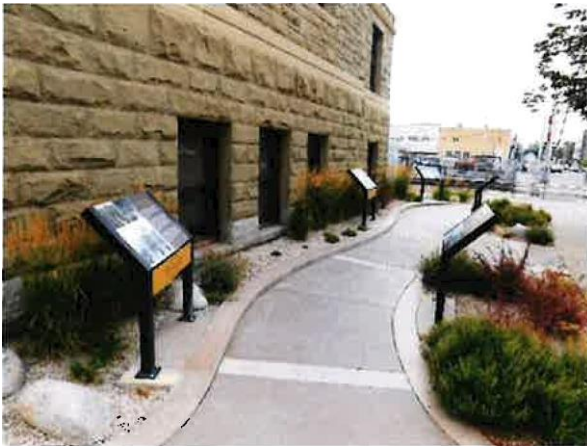
Interpretive panels at Western Heritage Center