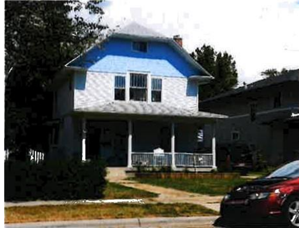
343 Clark Avenue (demolition)