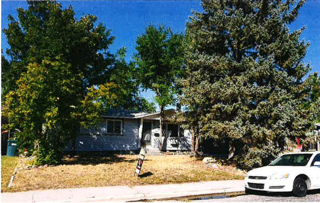
Subject: 1709 Saint Johns Ave, Billings, MT 59102 Description: Front façade; photographer facing north

PHOTOGRAPHS (35mm or good quality digitals of each exterior side of property, and photos of adjacent streetscape) Photocopy this page for additional photos