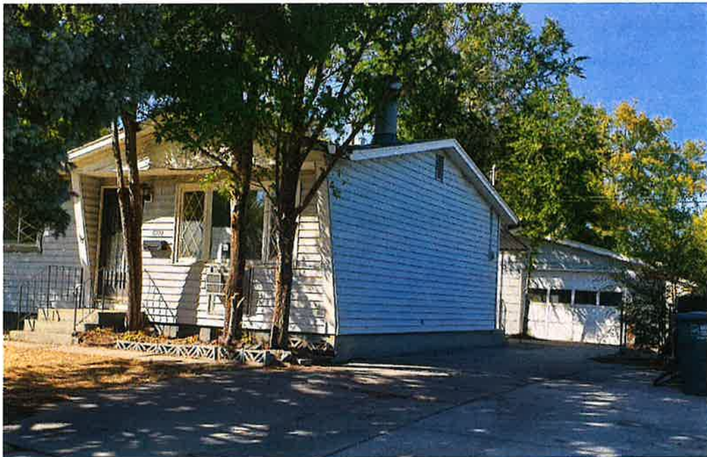
Subject: 1709 Saint Johns Ave, Billings, MT 59102 Description: Alternative view of the front and east side of the house & detached garage