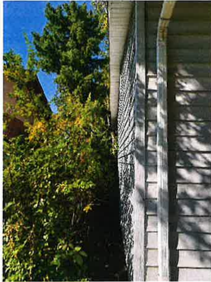
Subject: 1709 Saint Johns Ave, Billings, MT 59102 Description: View of the west side of the house

PHOTOGRAPHS (35mm or good quality digitals of each exterior side of property, and photos of adjacent streetscape) Photocopy this page for additional photos