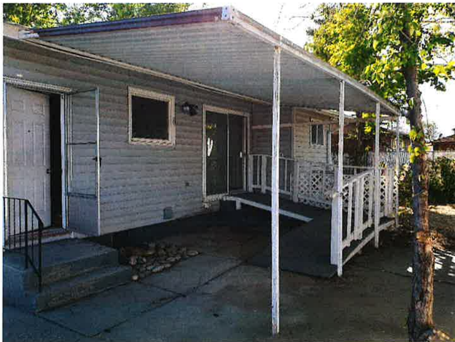
Subject: 1709 Saint Johns Ave, Billings, MT 59102 Description: View of the back (north side) of the house