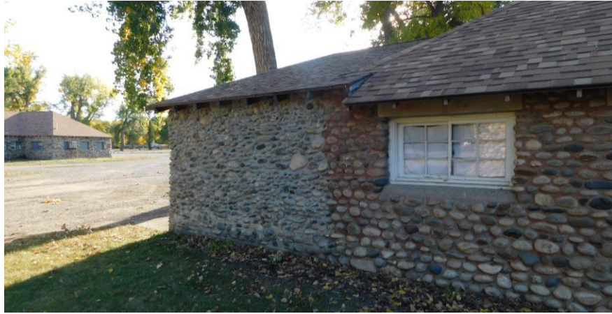
Similar red dye separation to the American Legion building, which is just west of Calamity's Dance Hall (Rifle Club long building).