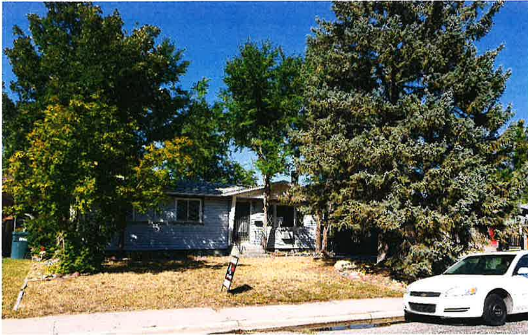
Subject: 1709 Saint Johns Ave, Billings, MT 59102 Description: Front façade; photographer facing north

PHOTOGRAPHS (35mm or good quality digitals of each exterior side of property, and photos of adjacent streetscape) Photocopy this page for additional photos