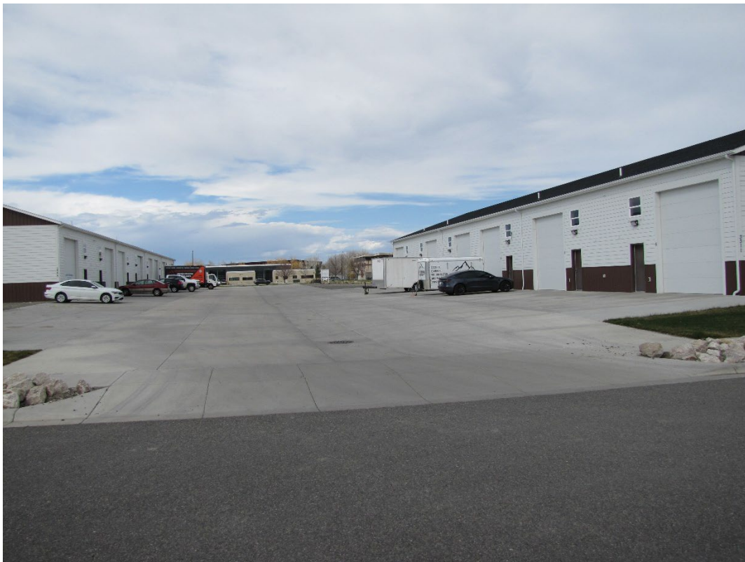
The front of the adjacent property to the west – 3311 & 3335 Conrad Rd