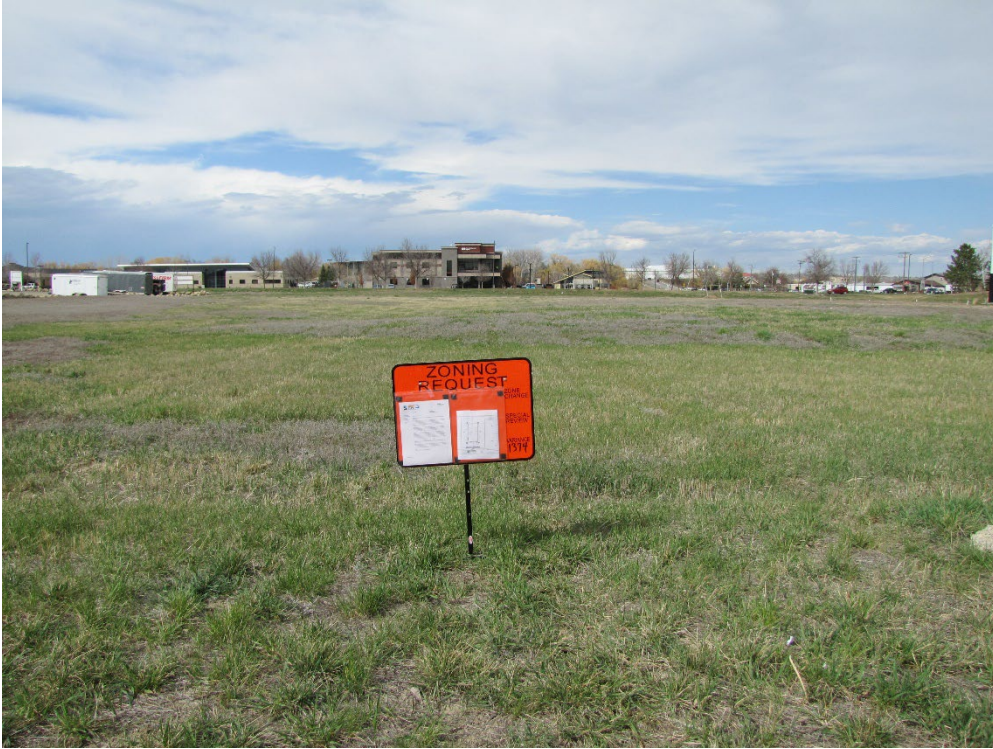
Subject property looking north from Conrad Rd