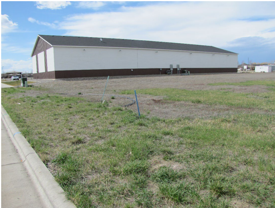
View to the west of subject property