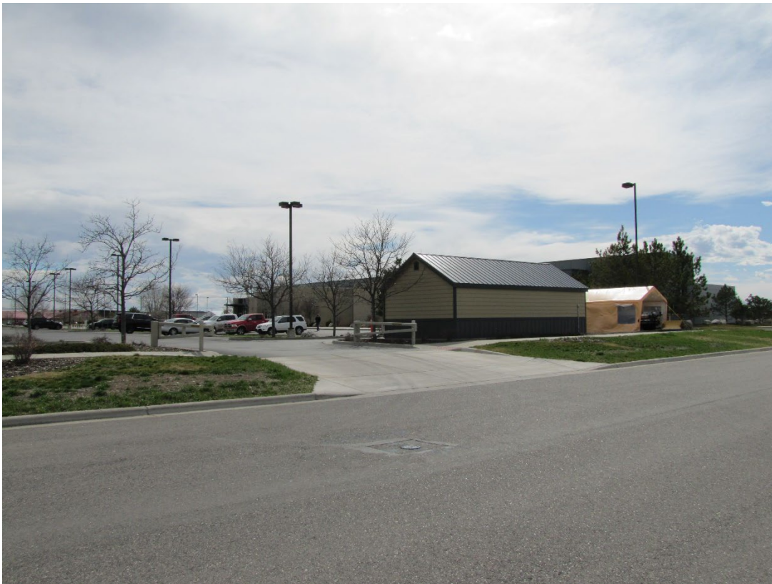
View south across Conrad Rd – Zoot Enterprises at 3333 Conrad Rd