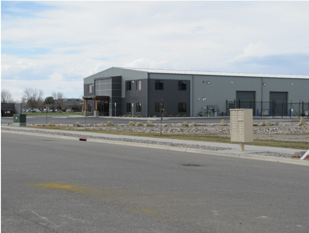
The business two parcels to the west at 3345 Conrad Rd