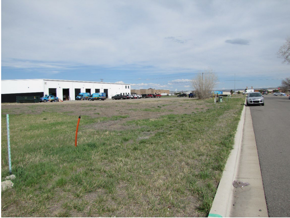
View to the east of subject property