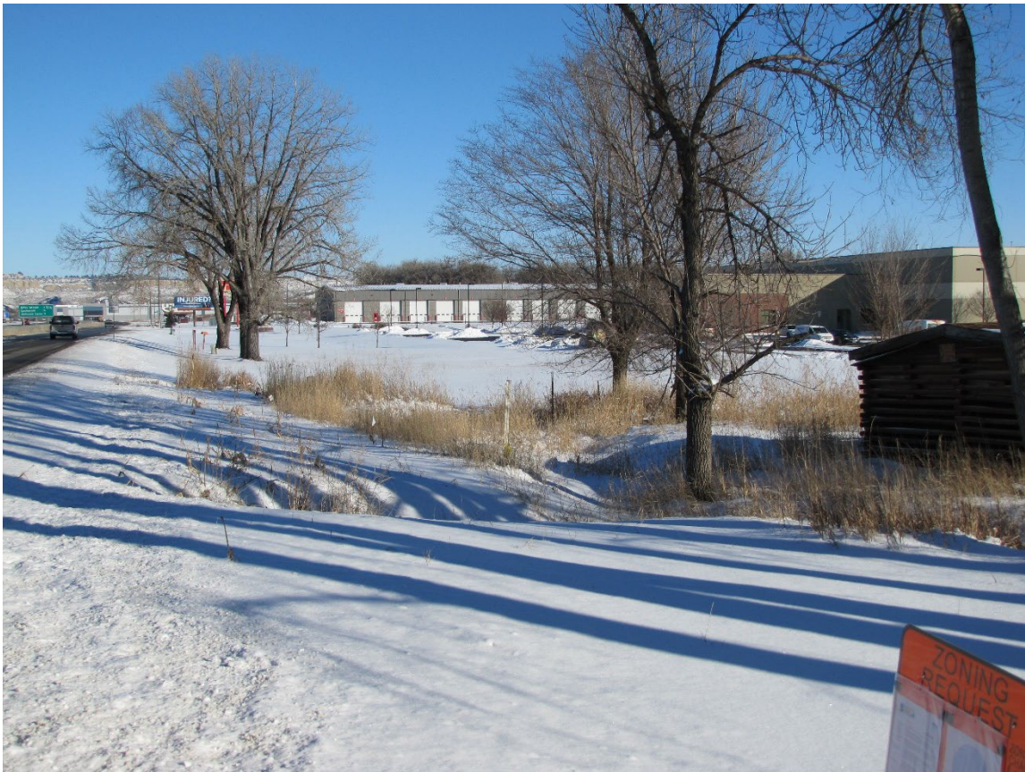
View south and east to adjacent commercial warehouses