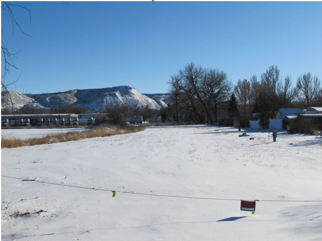
View south at subject property from S Frontage Rd