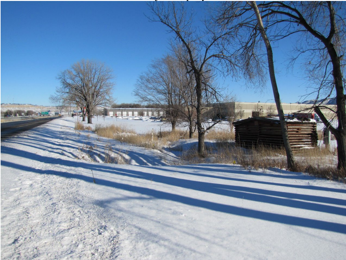
View east along South Frontage Rd