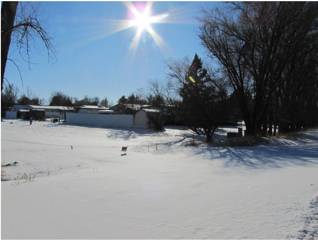
View south and west across subject property