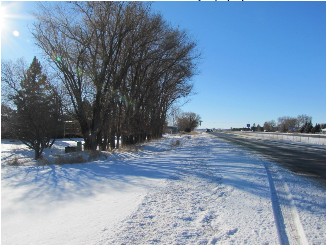
View west on S Frontage Rd