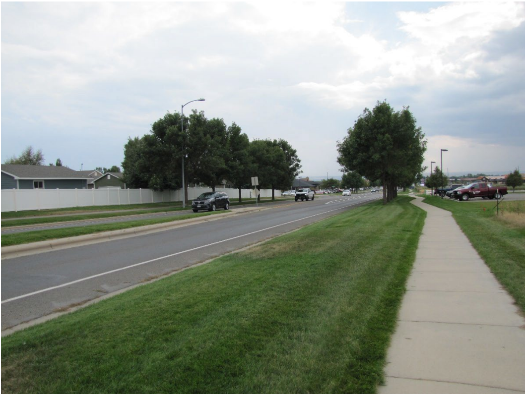
View south on Zimmerman Trail