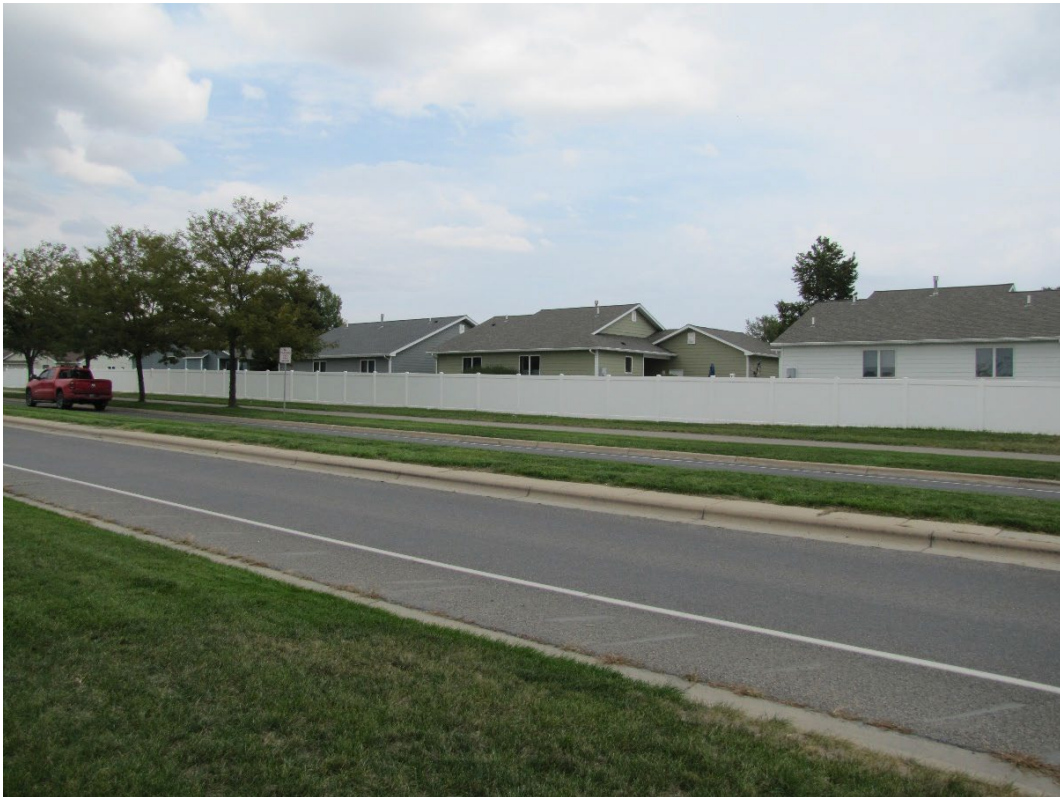
View north and east across Zimmerman Trail