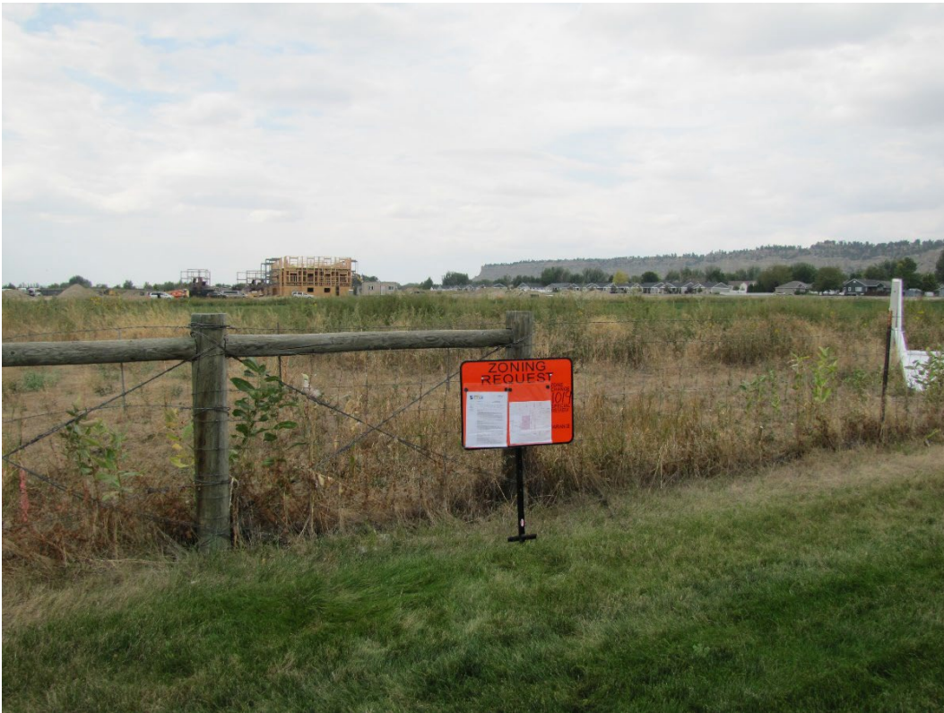
Subject Property – view west from Zimmerman Trail