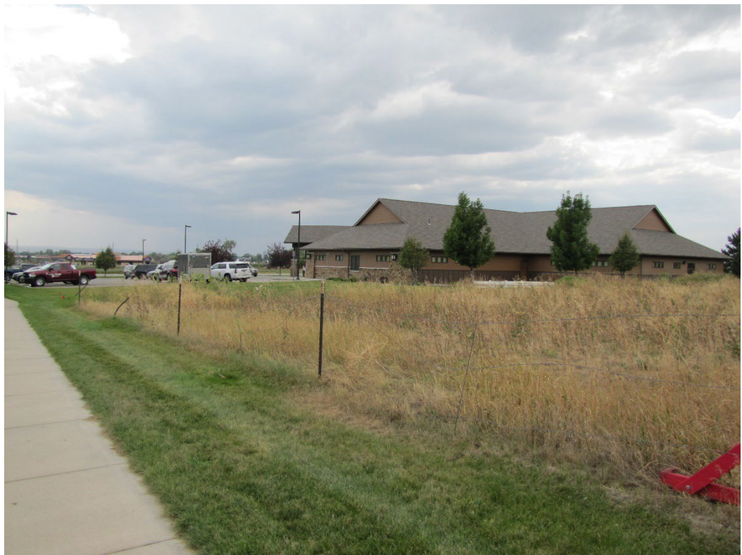
View south to the Children's Clinic – directly south of subject property