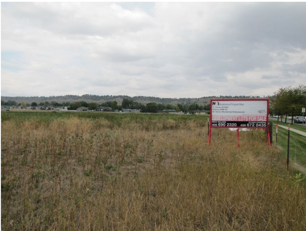
View north on Zimmerman Trail