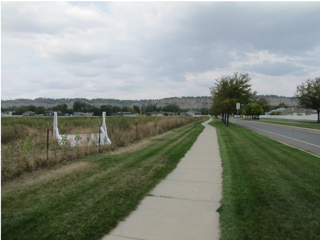
View north on Zimmerman Trail