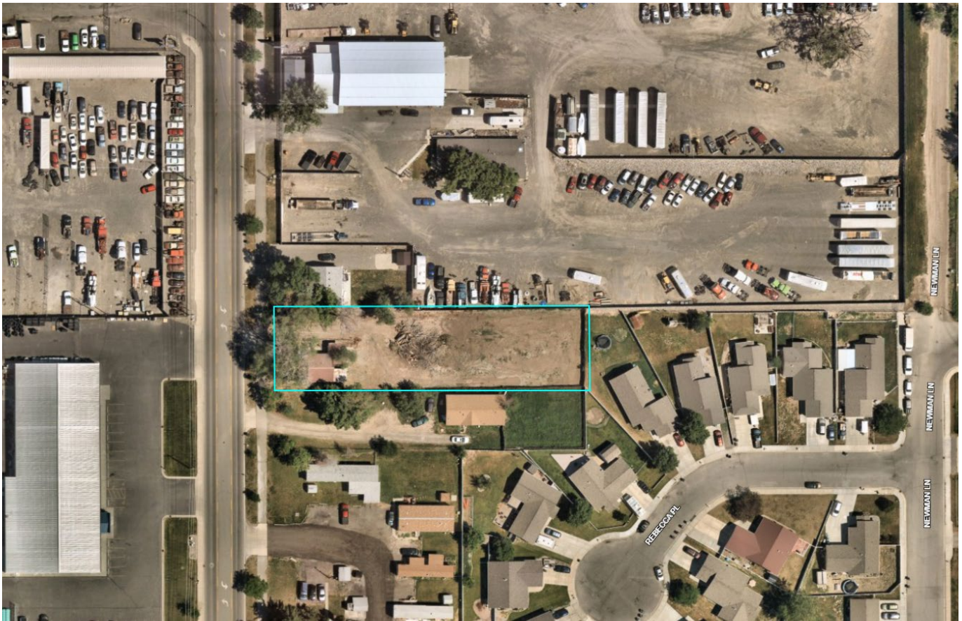
Current aerial of subject property