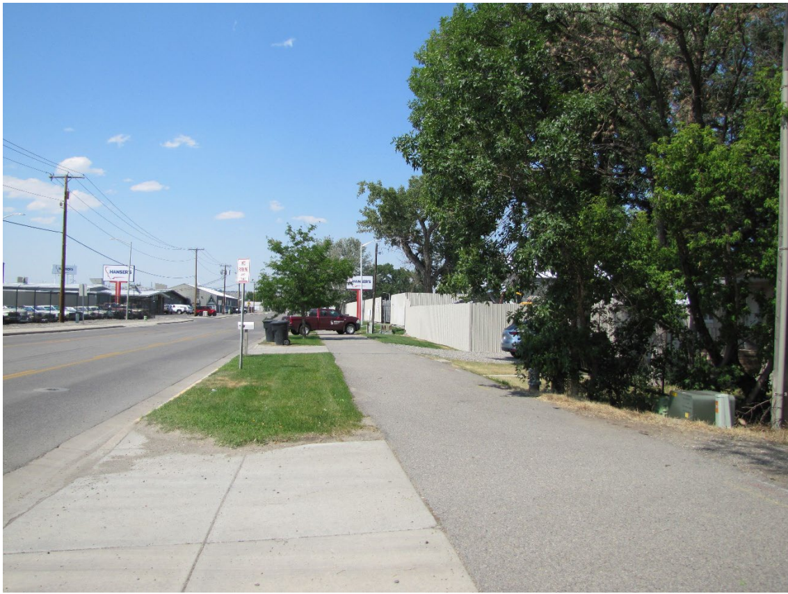
View north on S Billings Blvd