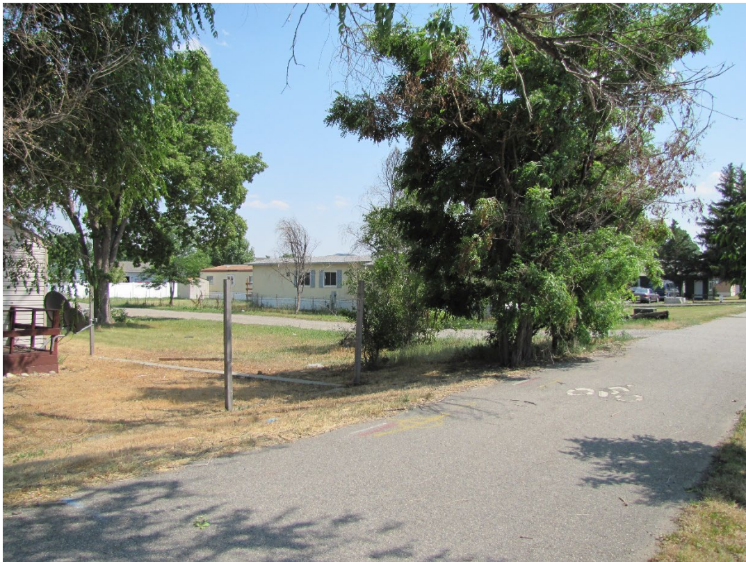
View southeast to adjacent residential properties