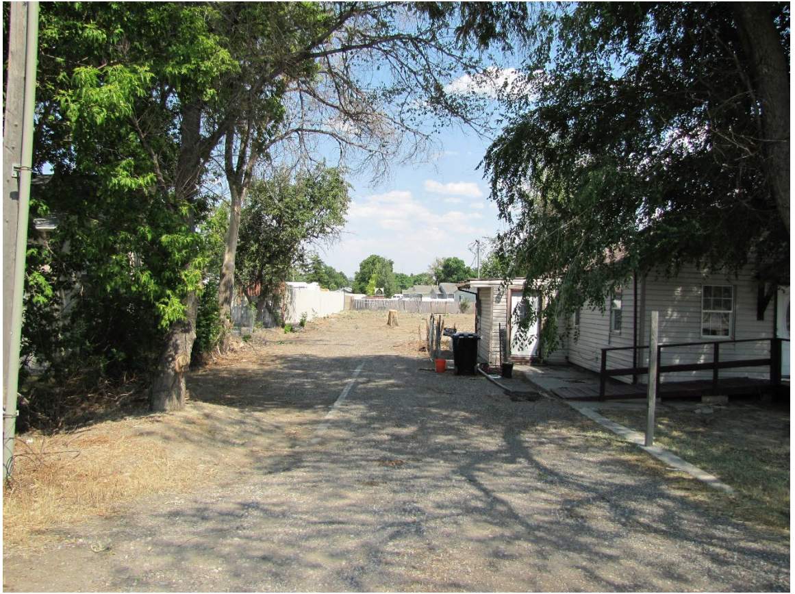
View east into subject property rear yard