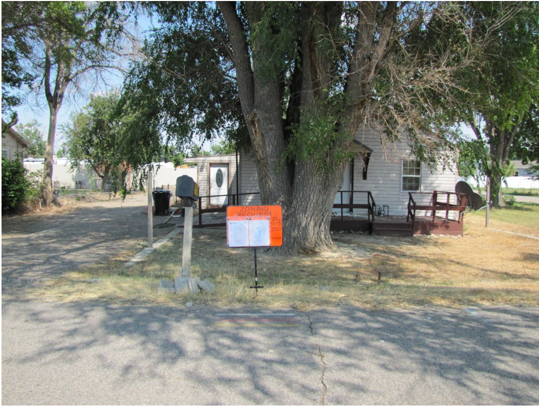
Subject Property – 529 S Billings Blvd