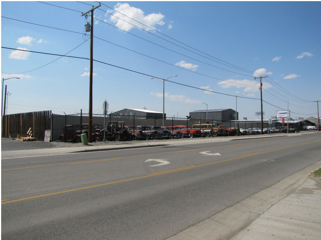
View northwest across S Billings Blvd