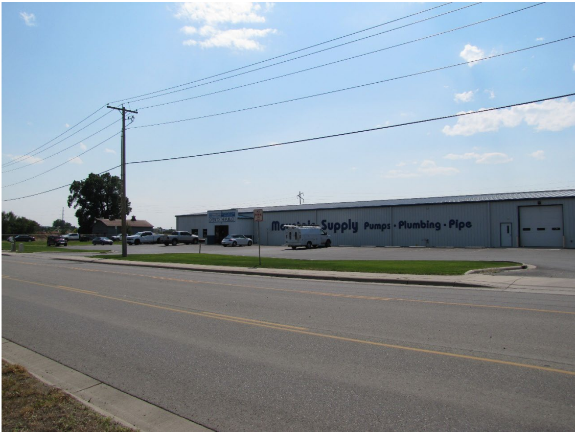
View southwest across S Billings Blvd