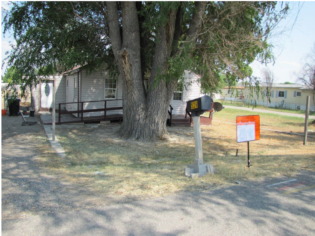
View southeast across subject property