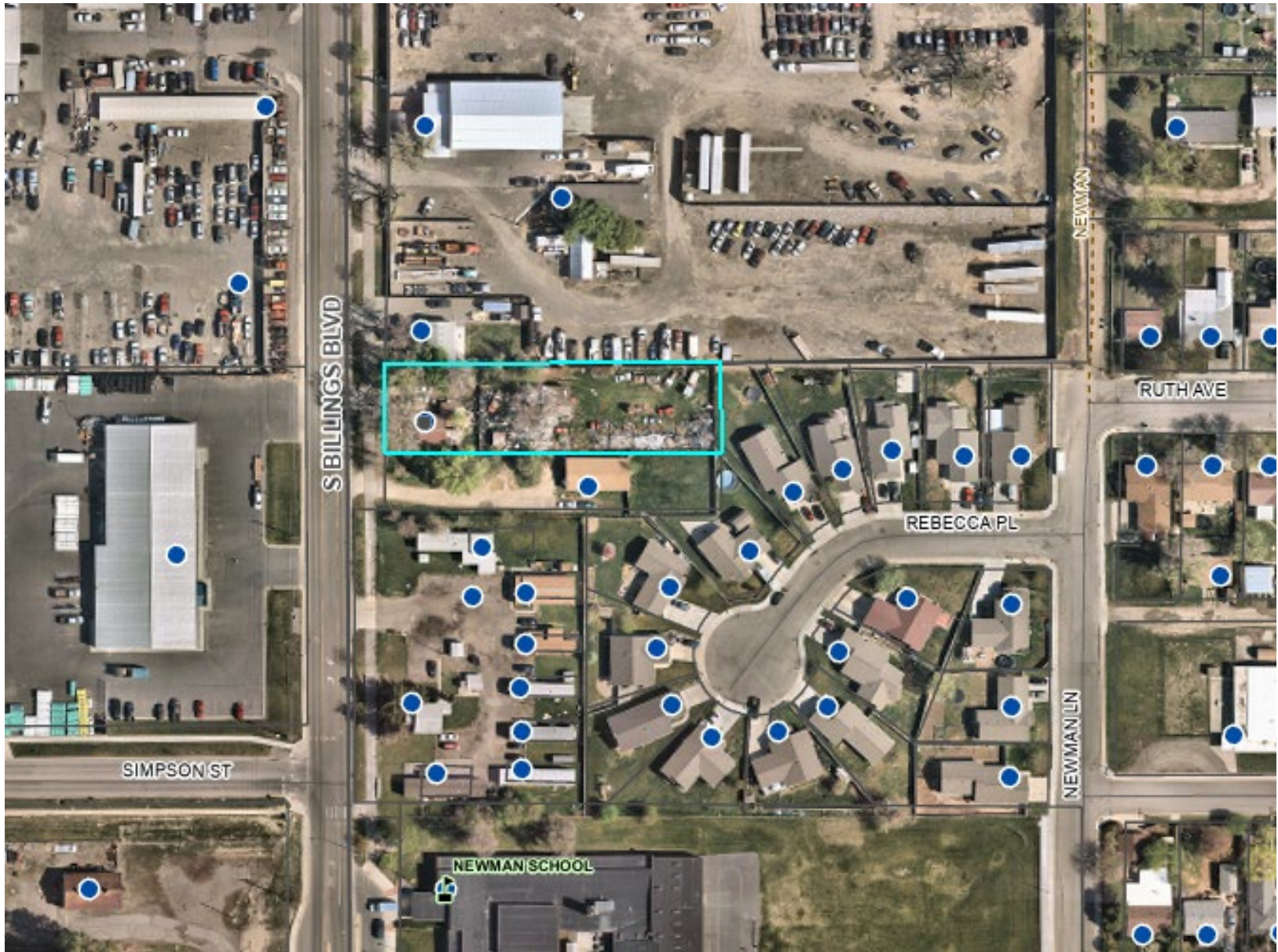
Subject Property May 2023 aerial