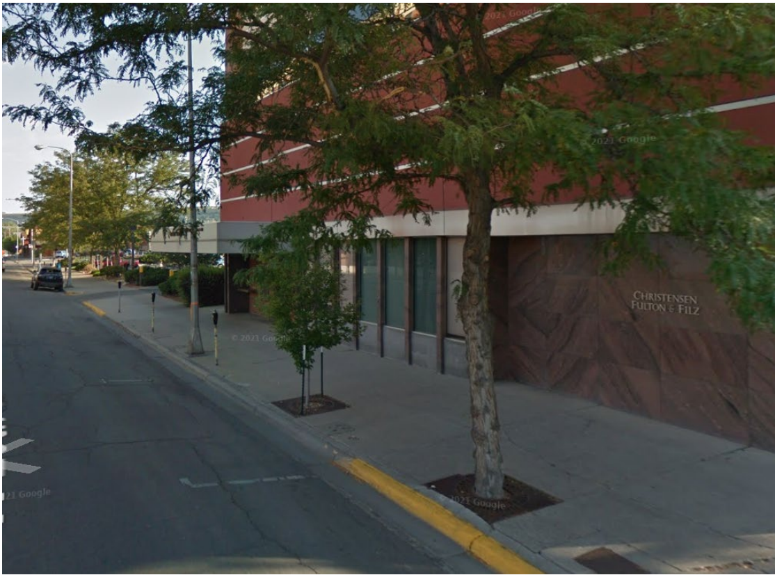
View north along N 29 th St