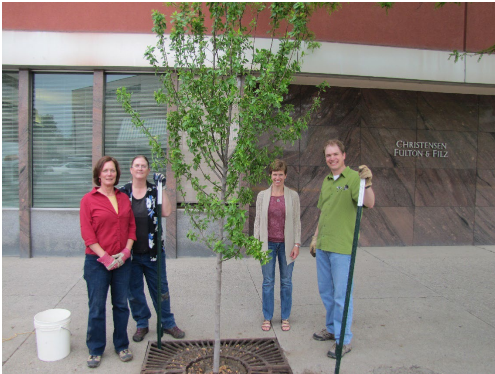
Planning Division tree planting on N 29 th St Arbor Day 2013