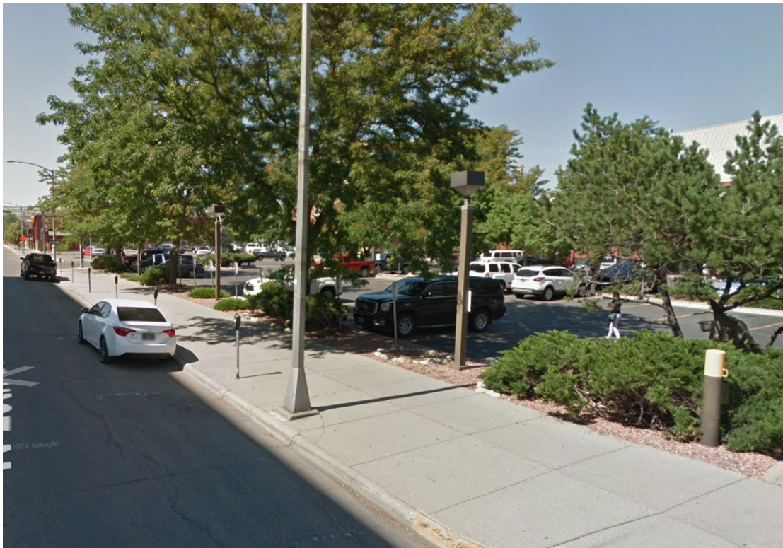
View north along N 29 th St