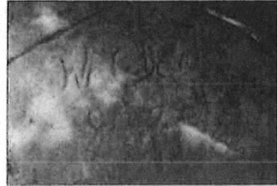
A William Clark signature in an area of other graffiti is visible on the Rimrocks overlooking Billings. The site is near Kelly's Grave on Black Otter Trail and has been protected with a concrete cover. No one is certain if the signature is authentic or a copy of the one at Pompeys Pillar.