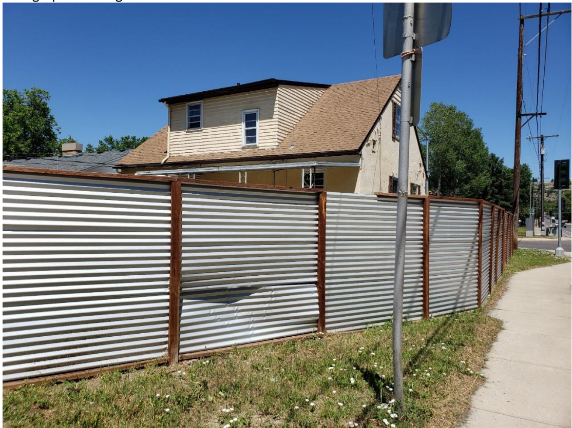
Photo 6: East side of house & fence Photographer Facing: Northwest

Description: 1302 Parkhill Drive, Billings, MT 59102