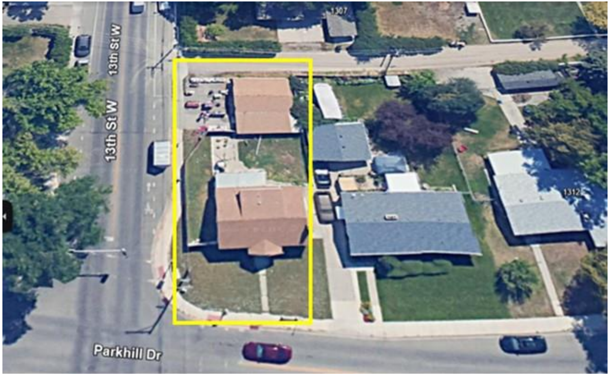
Aerial Photo 14; 1302 Parkhill Drive, Billings