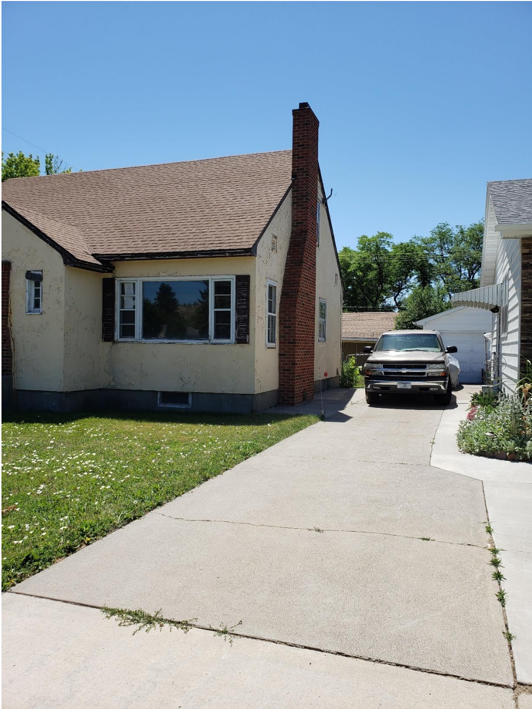
Photo 4: West side of house (driveway NOT part of property) Photographer Facing: Southeast

Description: 1302 Parkhill Drive, Billings