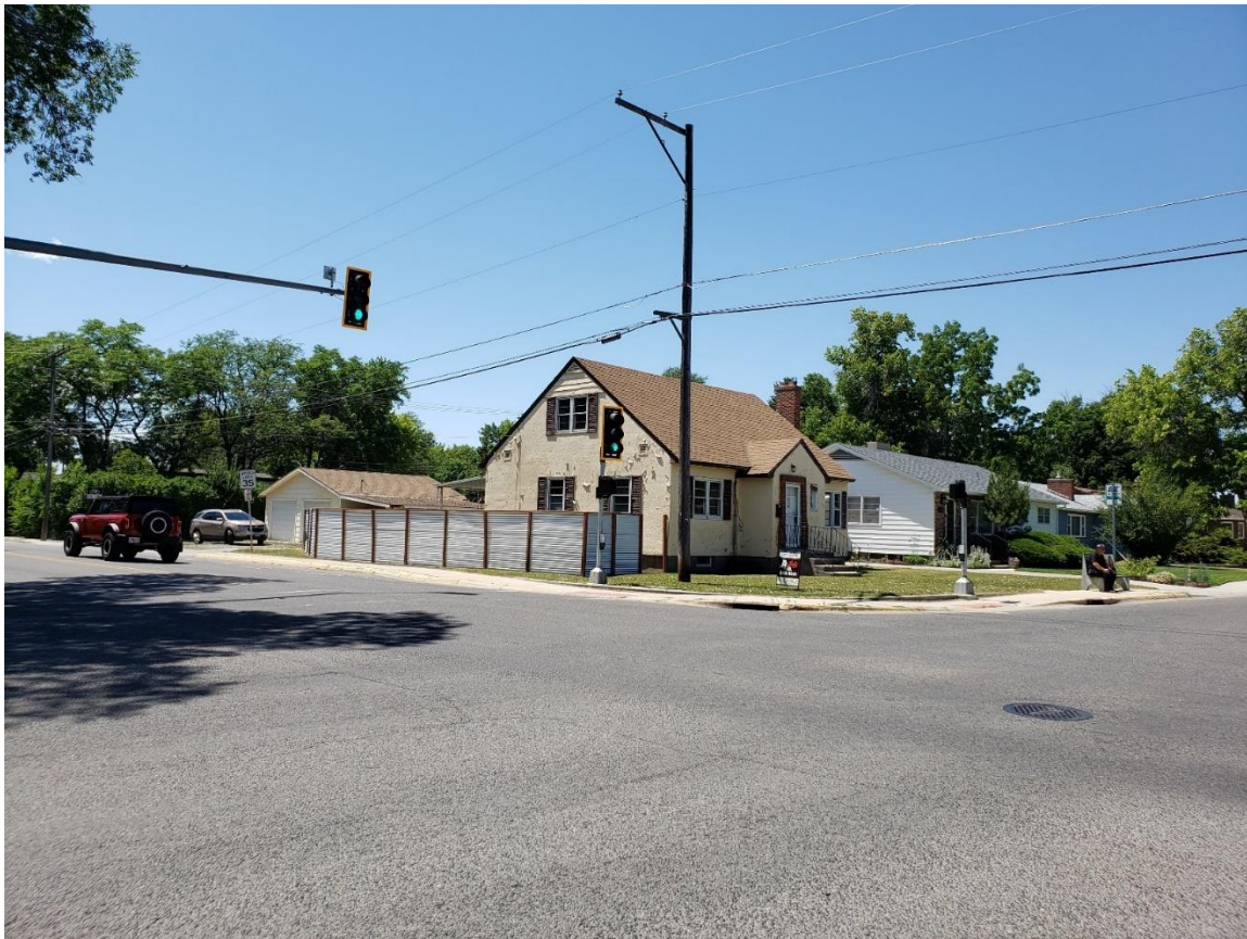
Photo 7: Signalized Intersection & House Photographer Facing: Southwest