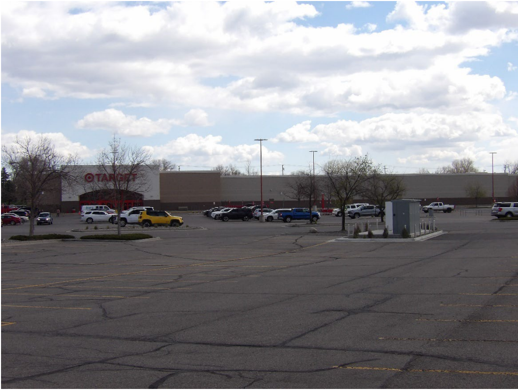
View of Target façade from west end of parking lot