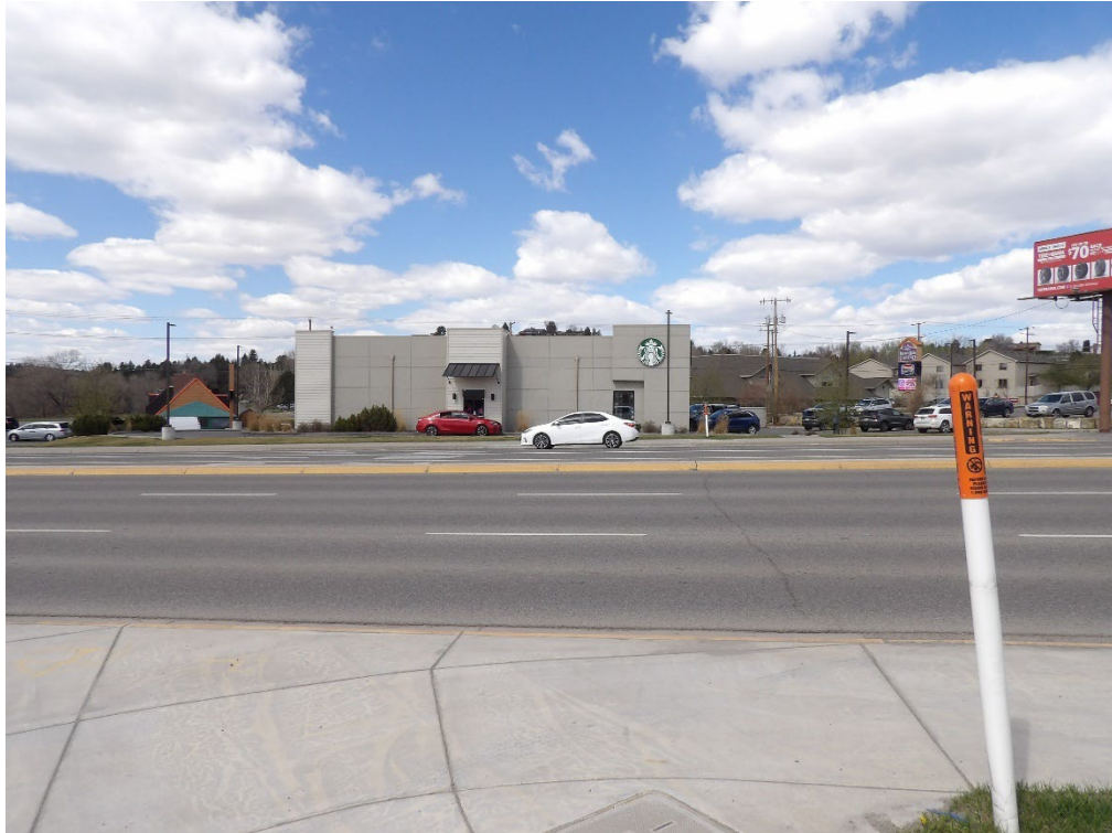
View west across Main Street - Starbucks