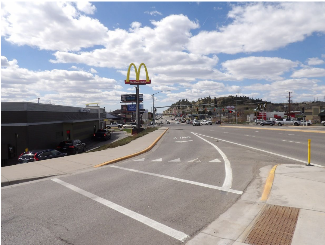
View southwest across Main Street