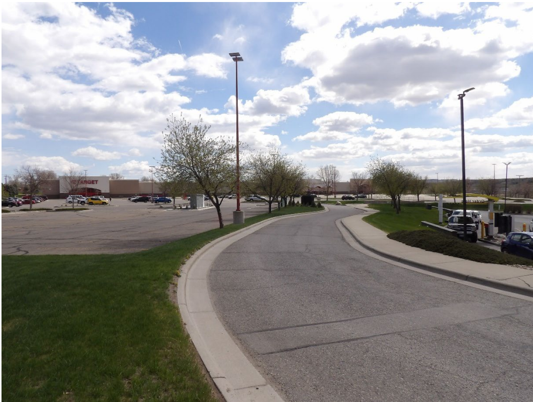
View east from entry driveway