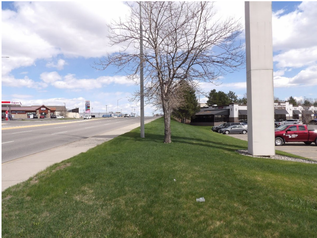
View north along Main Street