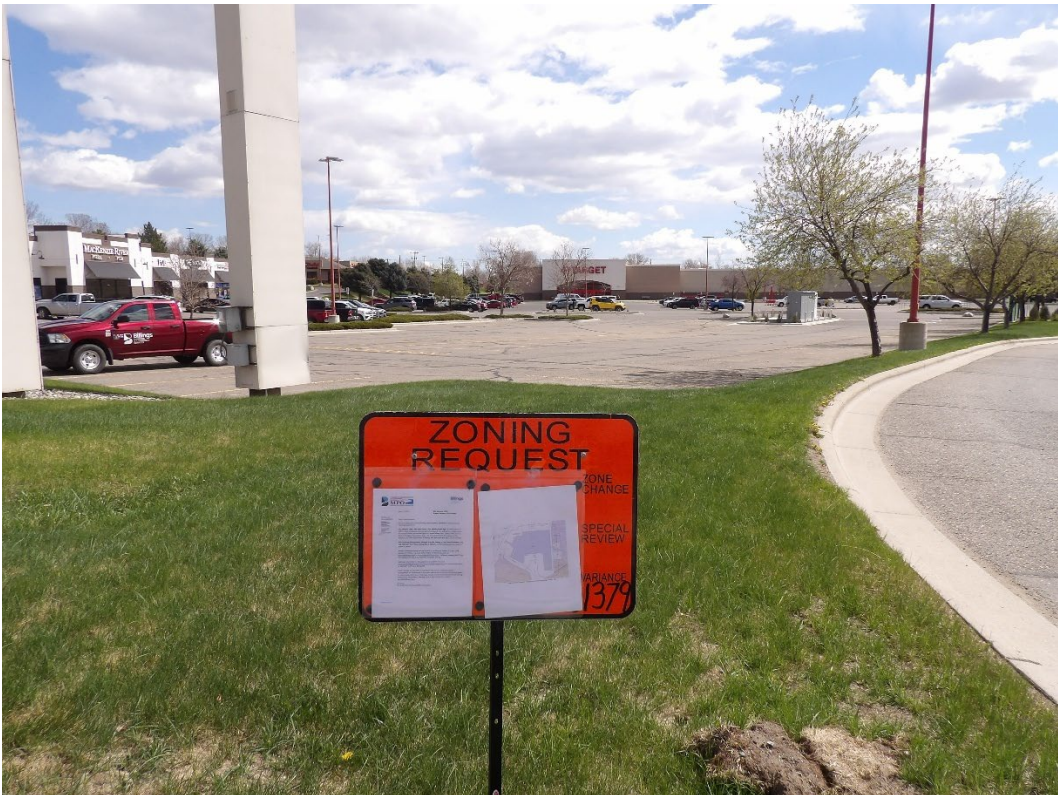
Subject property from primary entry driveway off Main Street