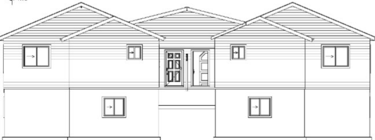
Back Elevation NTS