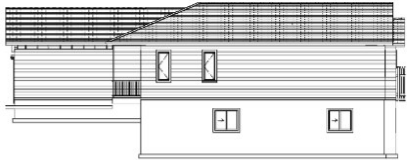
Side Elevations NTS