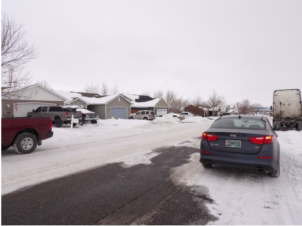
Looking NE from Sierra Granda Blvd