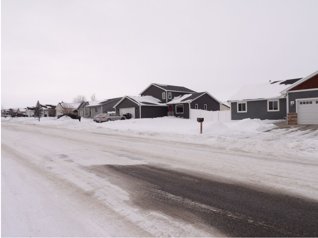
Looking NW from Sierra Granda Blvd