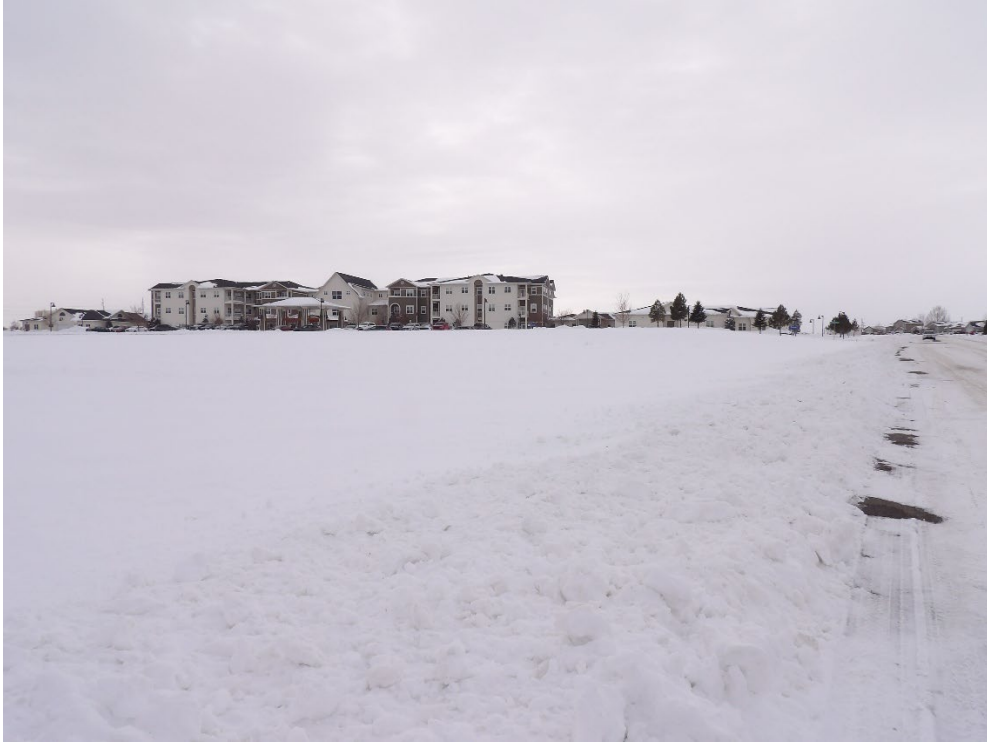
Looking west from Sierra Granda Blvd