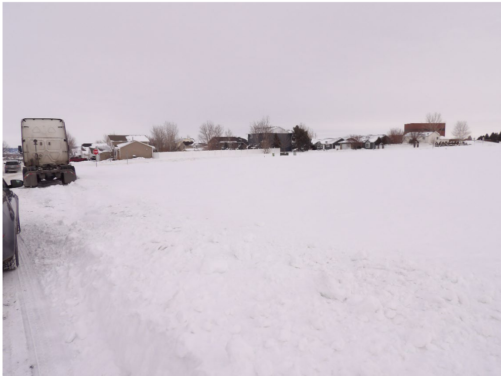
Looking NE from Sierra Granda Blvd