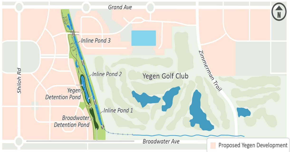
Figure 2: Initial Concept Level Figure