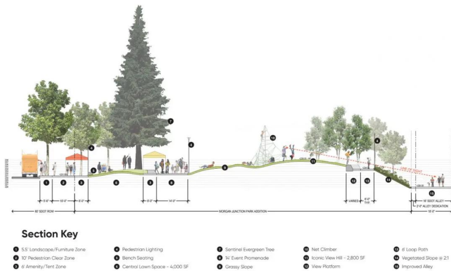
Figure 5: Final Alternative Level Park/Open Space Concept