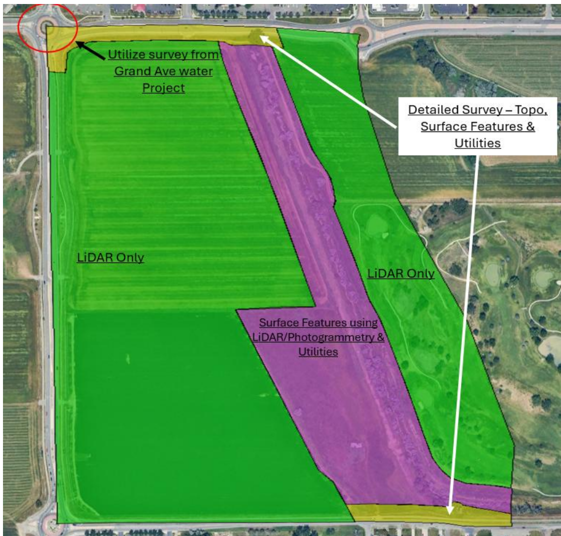
Figure 1 - Final Design Survey Collection & Basemap Extents Assumption