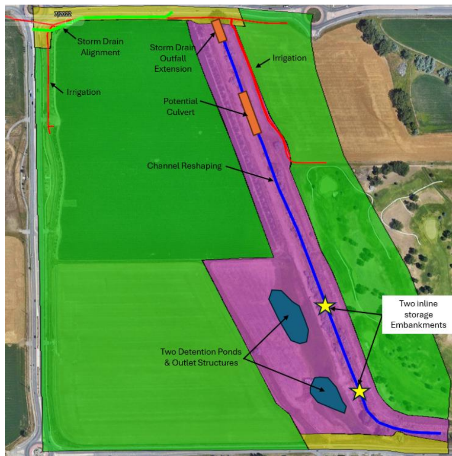
Figure 6 – Assumed Final Design Concept Layout