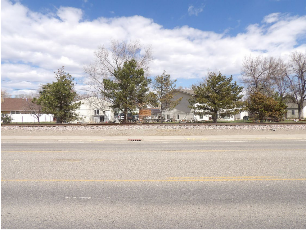
Looking north across State Avenue