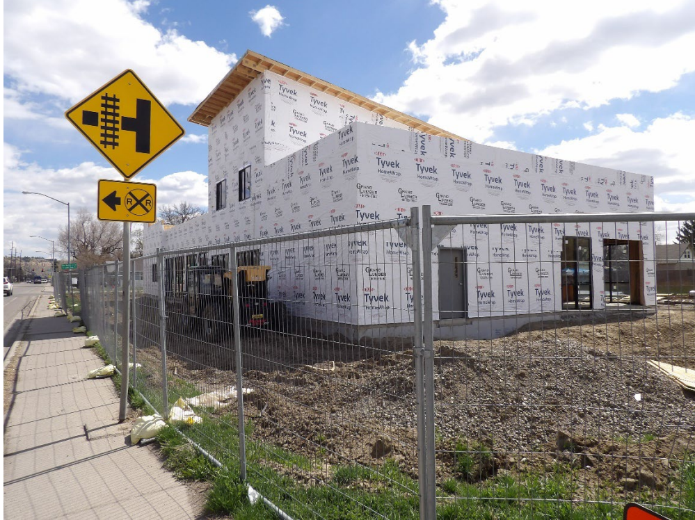
Looking southwest from the State Avenue