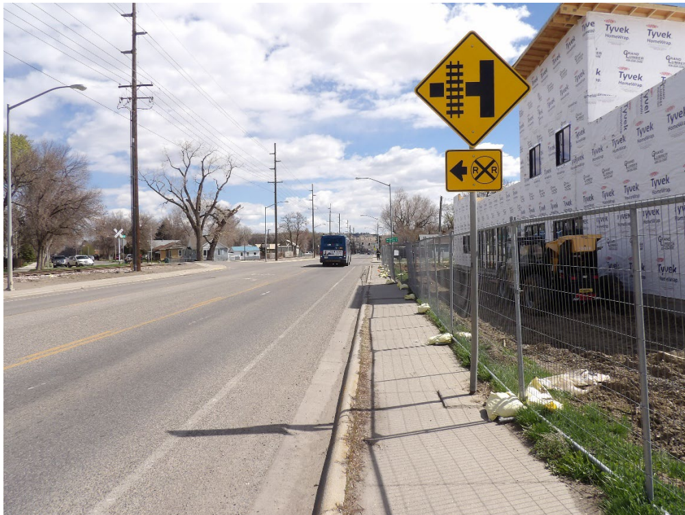
Looking east down State Avenue