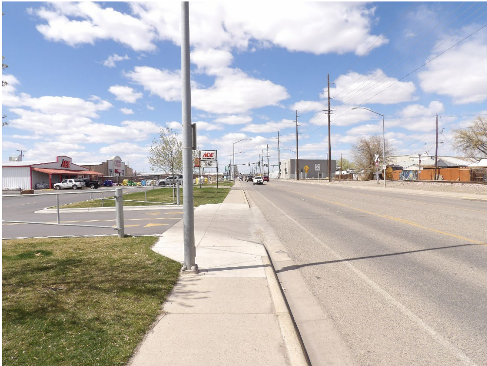
Looking west down State Avenue