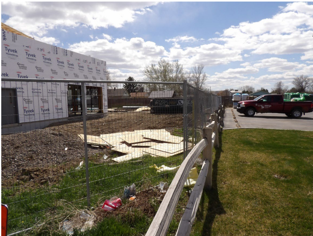
Looking south from State Avenue