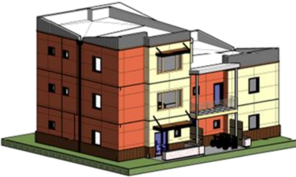
6 3D-5PLEX EXTERIOR FRONT VIEW 1