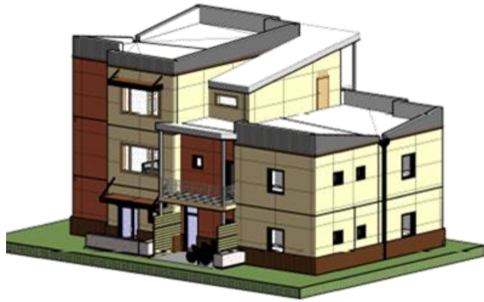
8 3D-5PLEX EXTERIOR FRONT VIEW 2