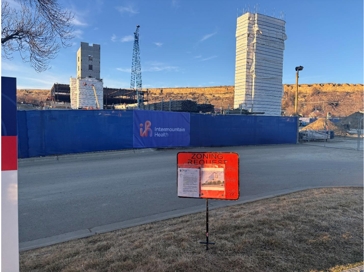
View looking north west at current construction.