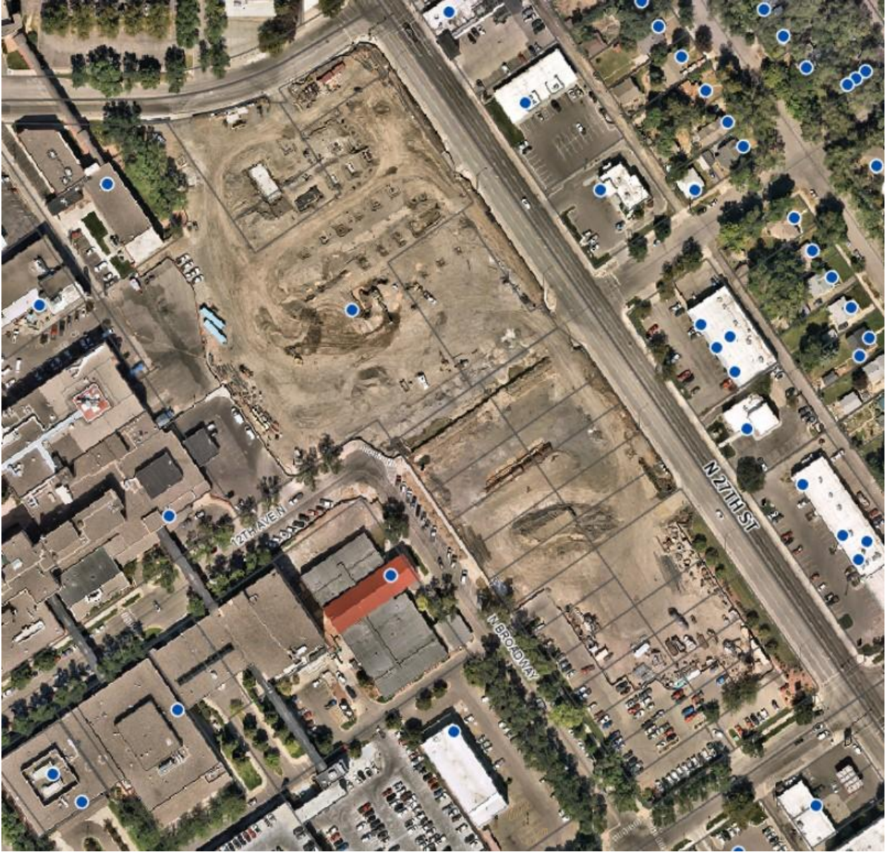
Aerial View of the proposed hospital site.