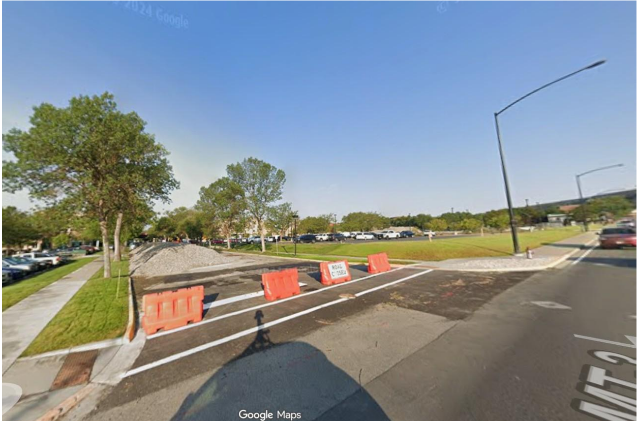
Google image just prior to beginning of construction.