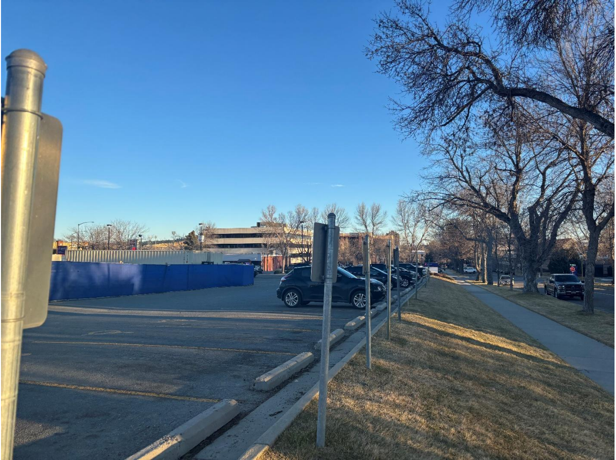
View looking south east with Billings Clinic in the distance.