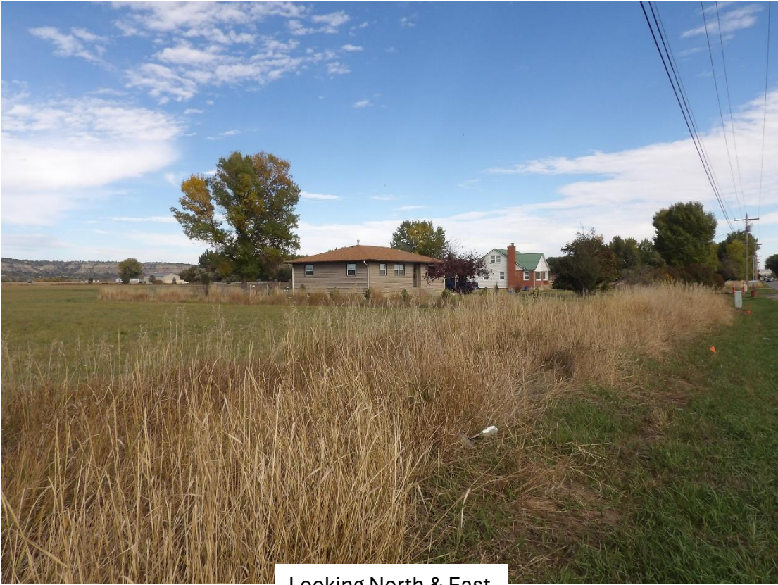
Looking North & East