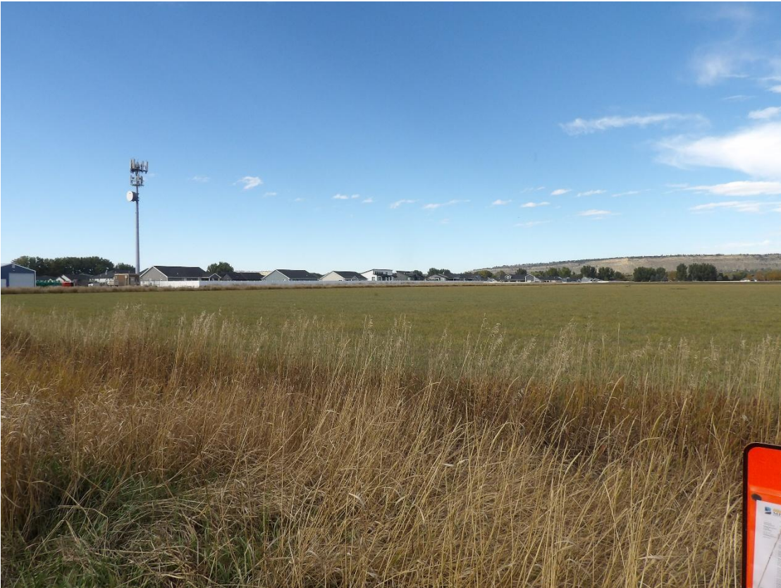
Looking North & West