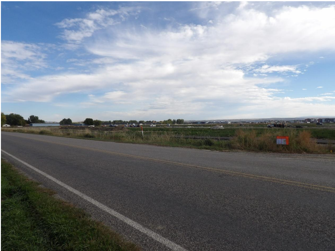
Looking North & West