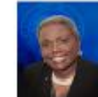
Commissioner Beverly Williams Lauderdale Lakes