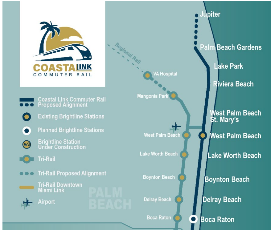
Palm Beach County